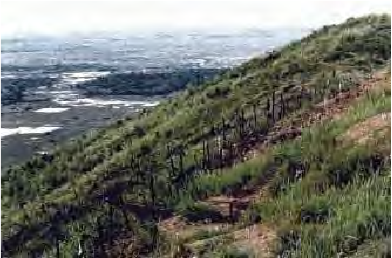
Here is a view of the hills of the south end of Phù Cát Air Base.