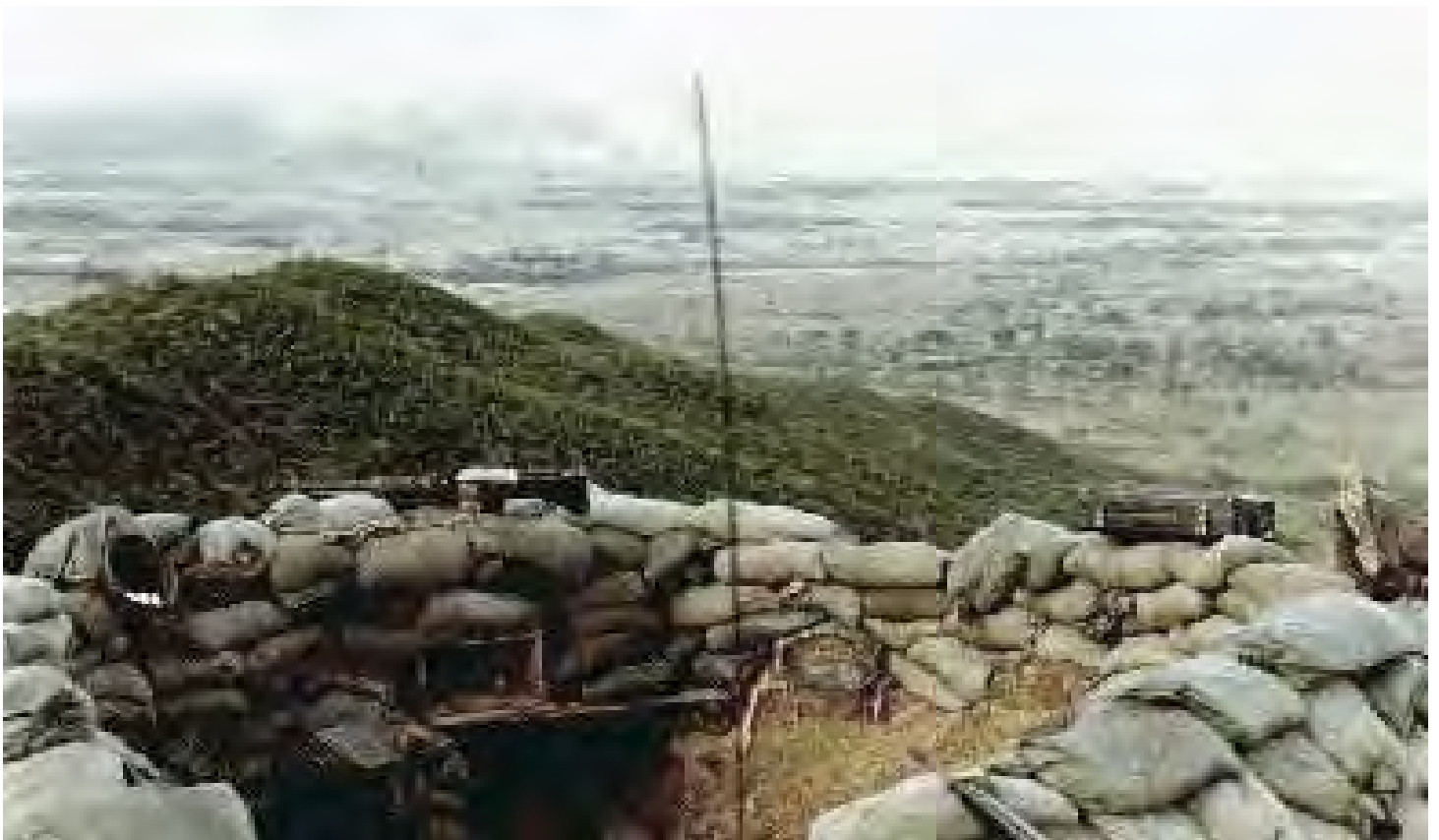
The Security Police squadron had an OP on the top of one of the hills (left side).