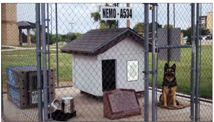
Nemo Memorial today at the United States Security Forces Museum at Joint Base San Antonio Lackland, TX

"The Security Forces museum already had an exhibit about military working dogs," said Tracy English, 37th