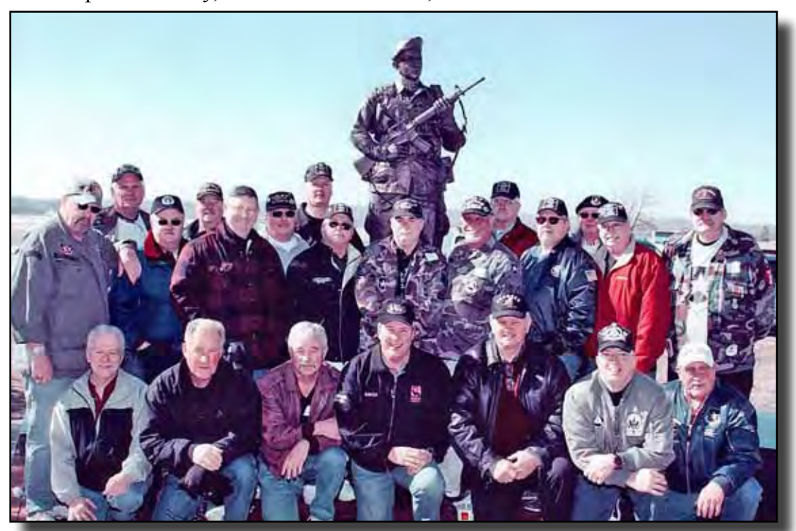
The gathering of the men of the VSPA on March 6, 2010 at the Defender Statue on the grounds of the Air Force Museum at Wright-Patterson Air Force Base.

Over 30 old-time Security and Air Police from the Southeast Asia conflict along with wives and family members gathered at the Hope, then spent the day on Saturday for lunch and guided tour of the Museum. Many spent the night Saturday, and those still there Sunday morning were treated to an inside tour of a active C-5 that was stopped at WP AFB. After a large breakfast buffet at the Hope on Sunday, we said our farewells, and headed out for home locations in Ohio,