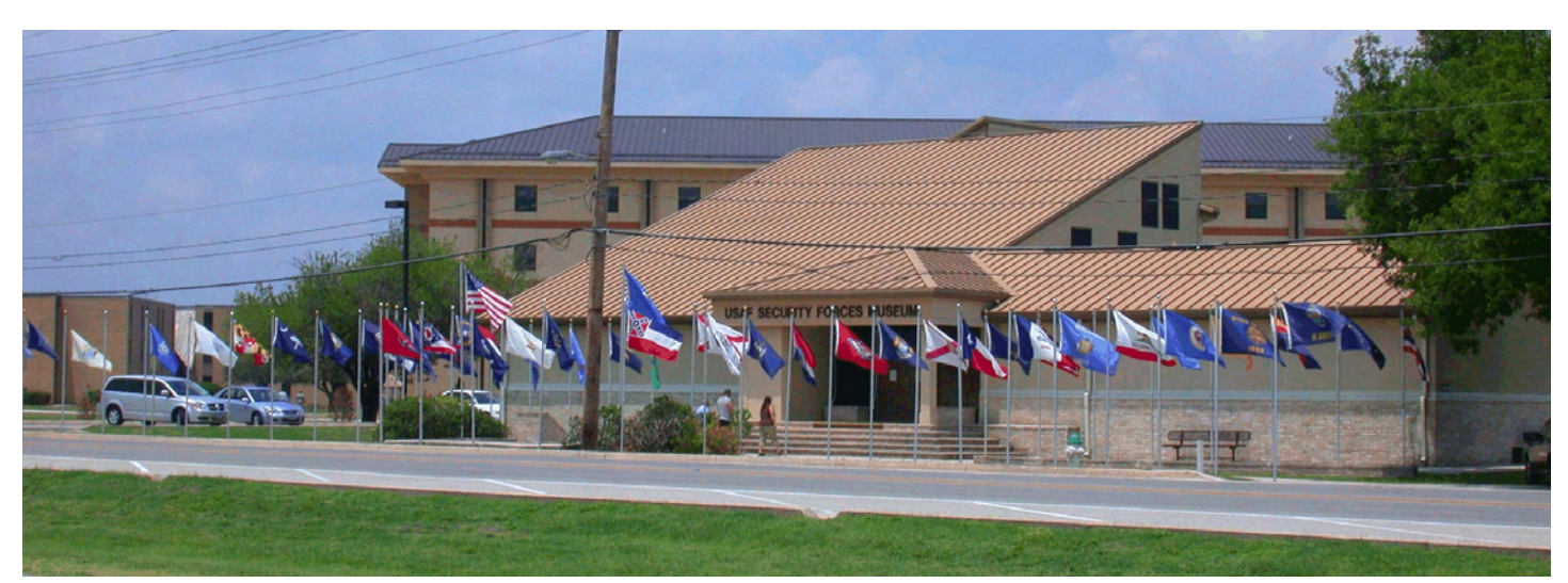
Front Entrance to the Security Forces Museum at Lackland Air Force Base