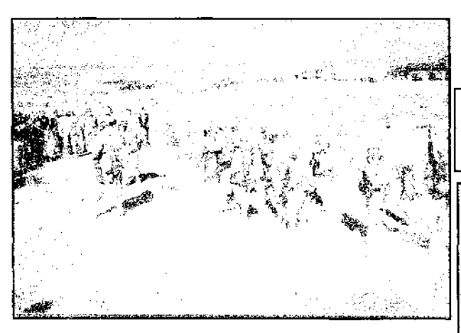
The old Security Police watch the new Security Forces demonstrate their tactics. Different colored cammics!