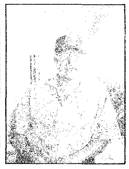
Another of our members was in the hospitality room, food was good and I lost his name.