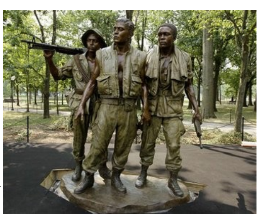
The Three Servicemen statue, at the Vietnam Veterans Memorial in Washington, which was unveiled after it underwent six weeks of restoration work, is seen, Thursday, July 8, 2010.

A private foundation that built the memorial raised about $125,000 to restore the bronze "Three Servicemen" statue of three soldiers for the first time. After 25 years, weather and the hands of millions of visitors were down the patina finish on the soldiers' faces, arms, hands and guns, turning those areas a greenishblue color.