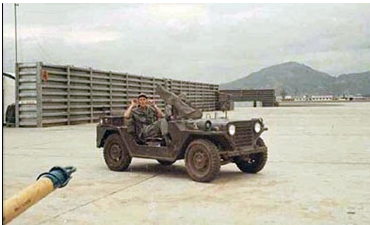
6. Đà Nẵng AB: 366th SPS, QRT Jeep with canvas covered M60.