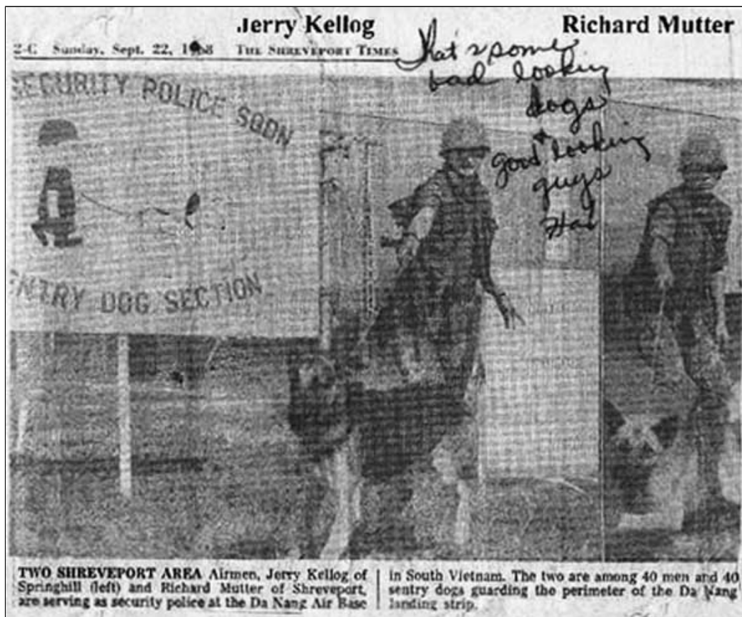
2. Đà Nẵng AB: News Article. Shreveport Times, La., 22 Sep 1968.