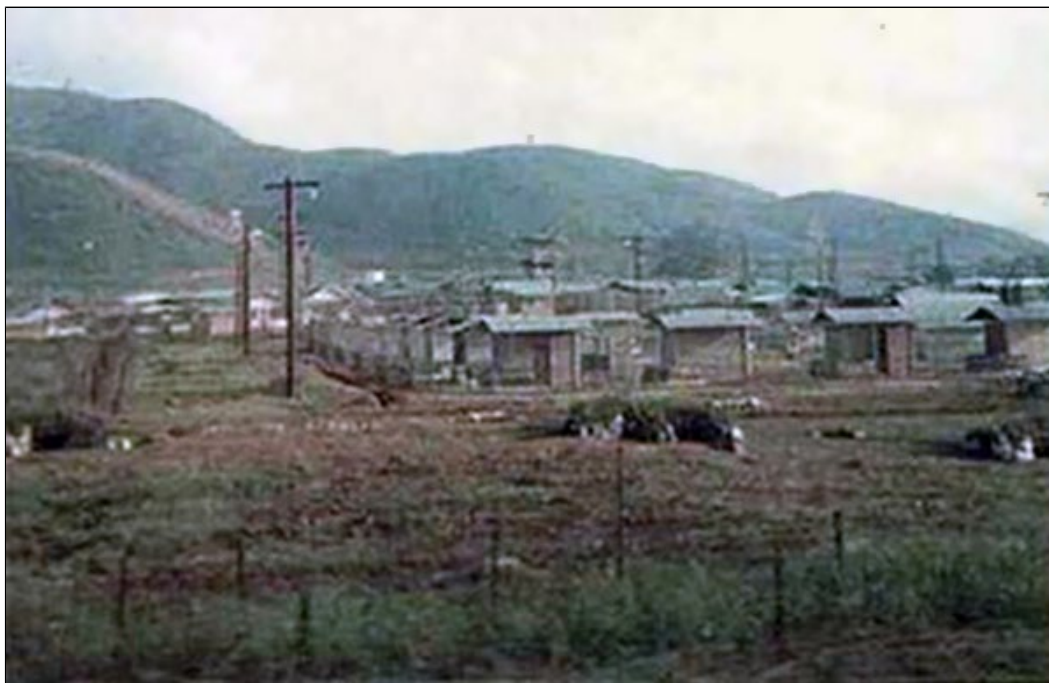
8. Đà Nẵng AB: 366th SPS. POW Camp below Freedom Hill 327.