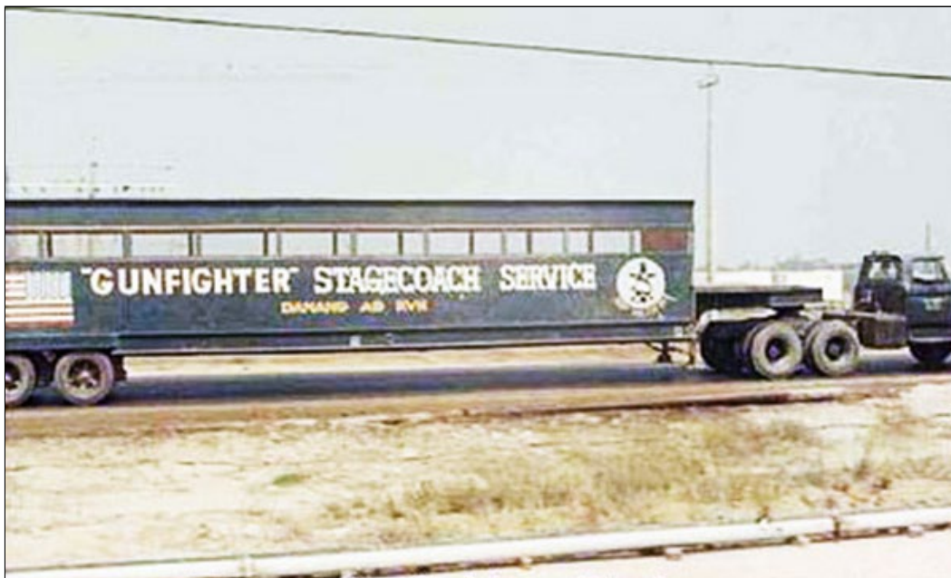
7. Đà Nẵng AB: 366th SPS Gunfighter Stagecoach Service.