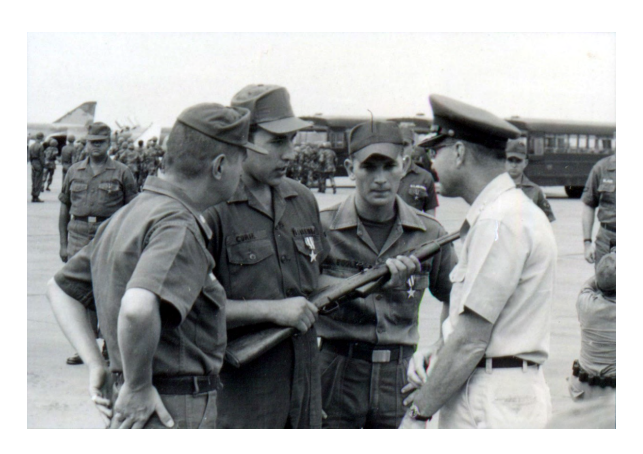
Photograph courtesy of Lt Grove C. Johnson Commander, 377<sup>th</sup> Air Police Squadron, 1966 – 1967