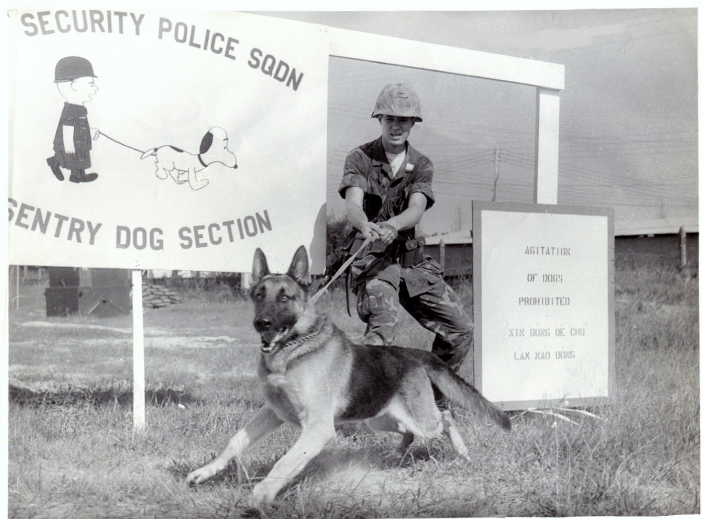
Blackie 129X and myself in front of the kennels