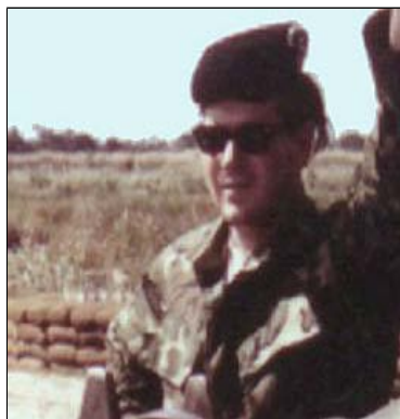
9) (Close up)