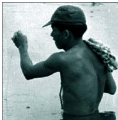
10) Vietnamese fisherman, string-fishing. Look close and you can see the line. He is one of a native ARVN fishing with a thread size string and a very small hook. He was catching what I call minnows and would use here at home for bait. He then cut the heads off and fried the bodies.