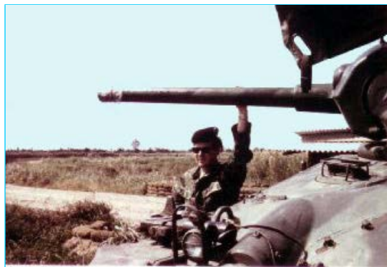
8) Duke Windsor, beside a grounded tank on perimeter road.