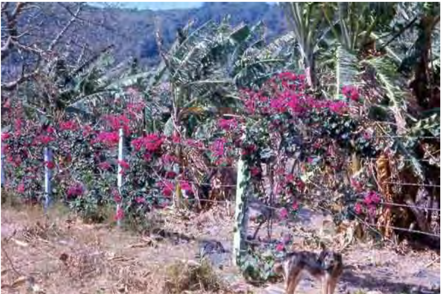
Dai Tan, village stray dog scronging for food. MSgt Summerfield: 16