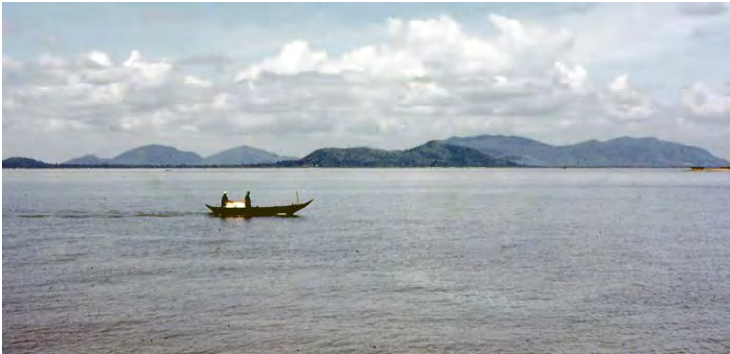
Dai Tan, Long Hai mountains over South China Sea. MSgt Summerfield: 23