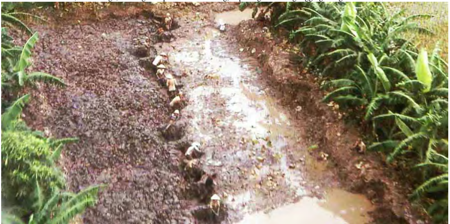
Close UP: Dai Tan, near village, Cobra gunship flies over clearing surprising Viet Cong digging. (left bank) MSgt Summerfield: 18