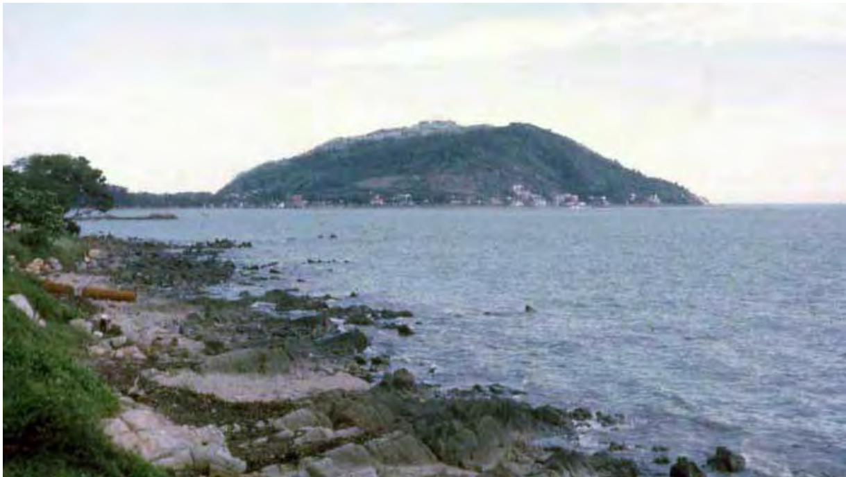
Dai Tan, Long Hai mountains. MSgt Summerfield: 20 and 21