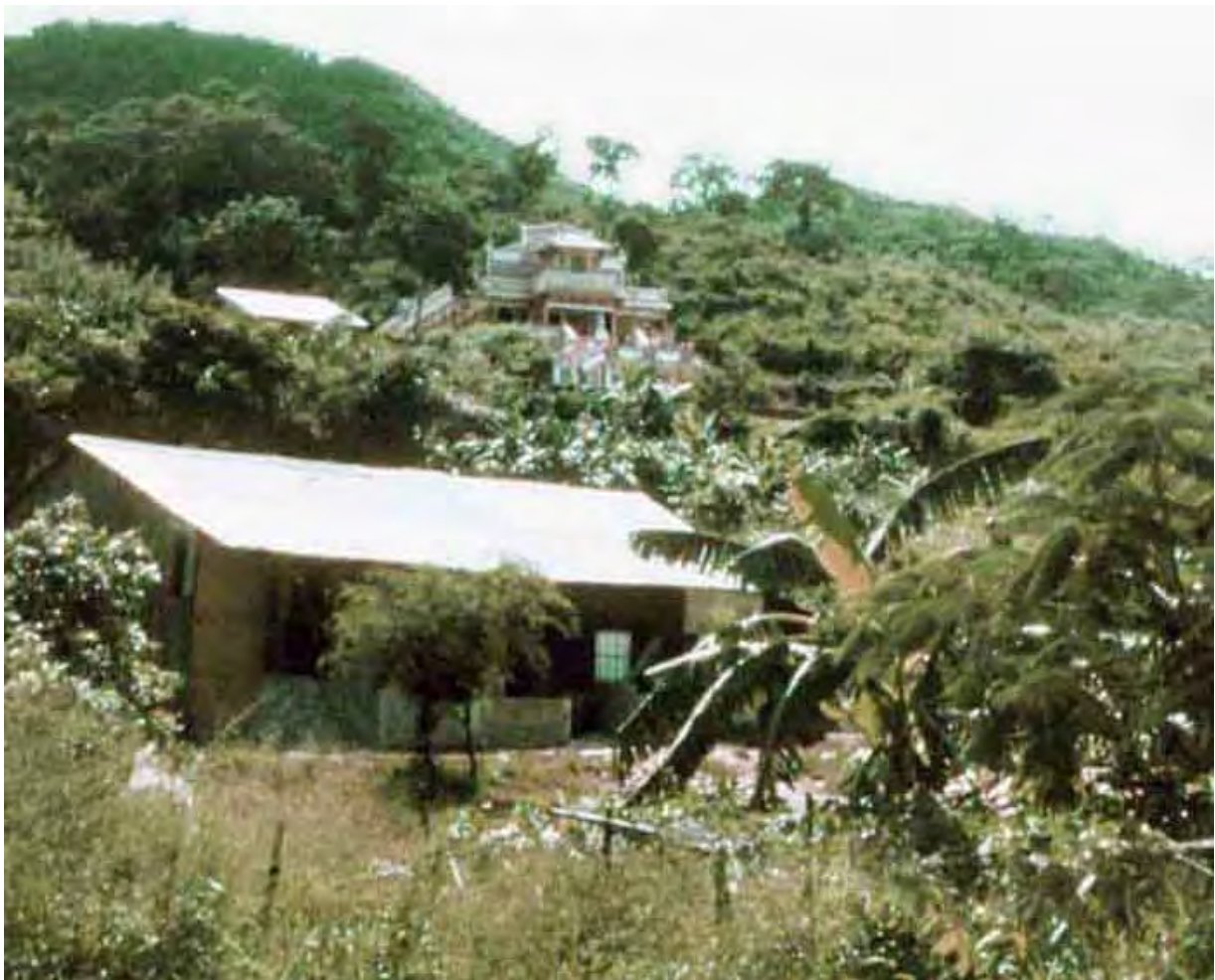
Dai Tan, Vietnamese homes.