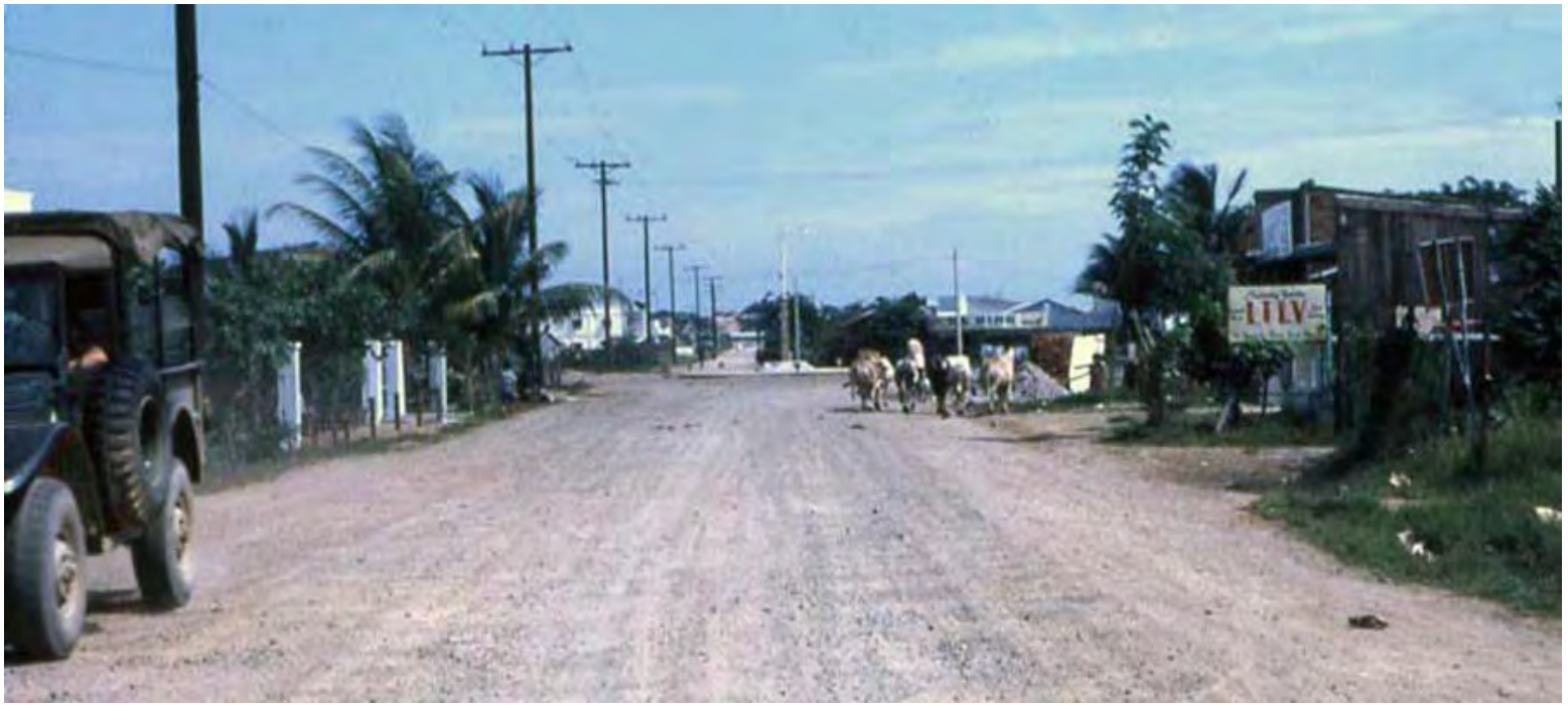
Dai Tan village road, with jeep and farm animals. MSgt Summerfield: 05