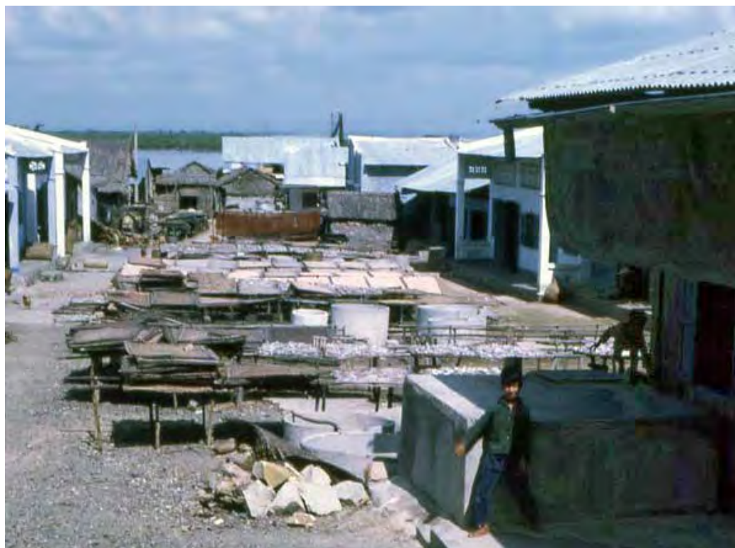
Dai Tan, and kids playing. MSgt Summerfield: 04