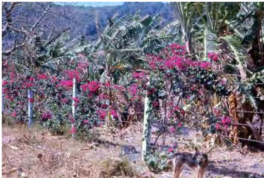
Dai Tan, village stray dog scronging for food. MSgt Summerfield: 16