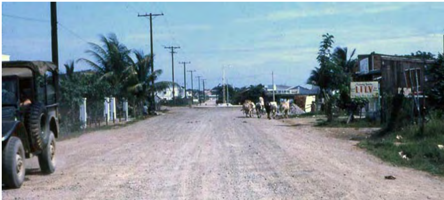
Dai Tan village road, with jeep and farm animals. MSgt Summerfield: 05