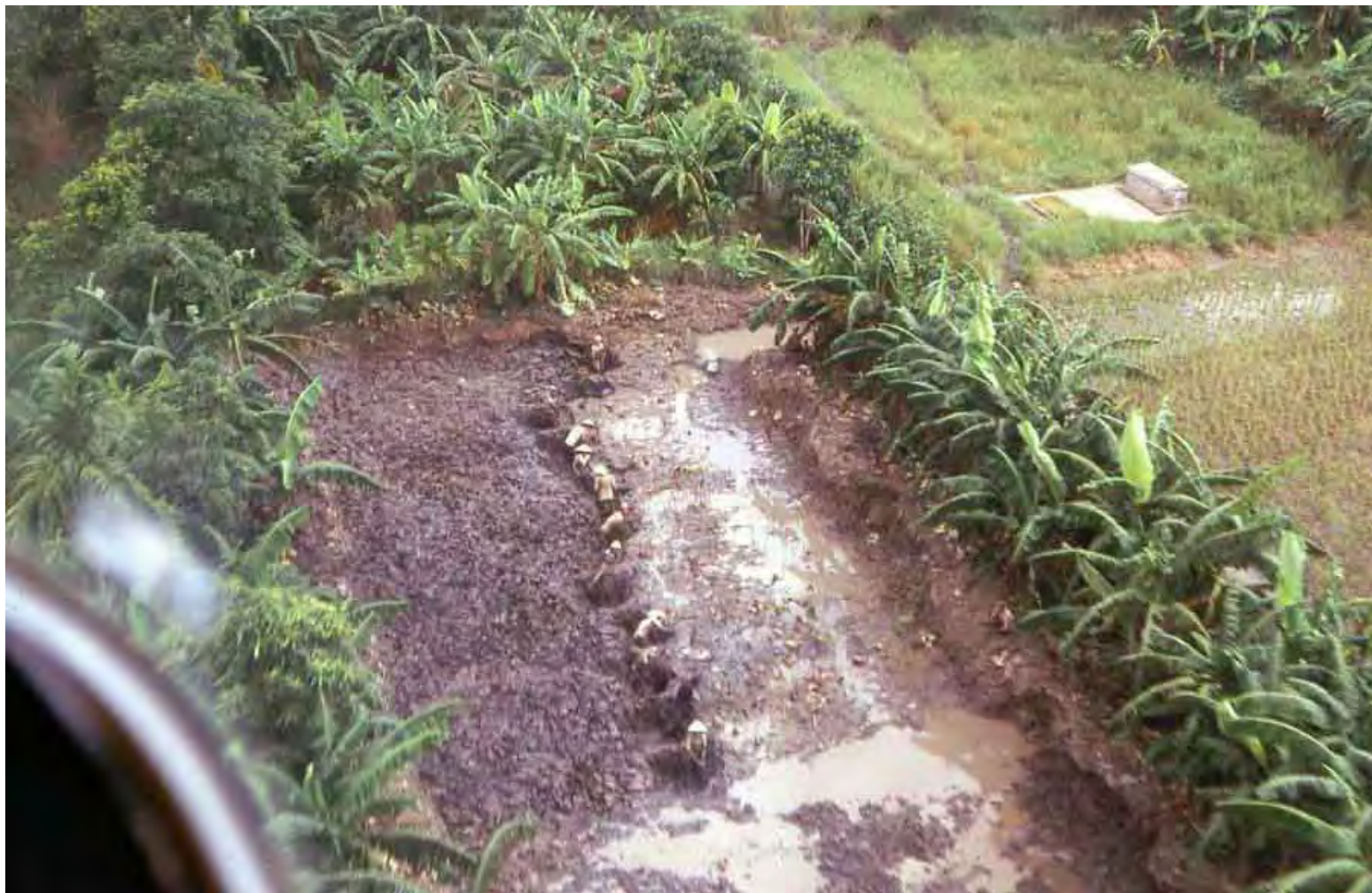
Dai Tan, near village, Cobra gunship flies over clearing surprising Viet Cong digging. MSgt Summerfield: 17