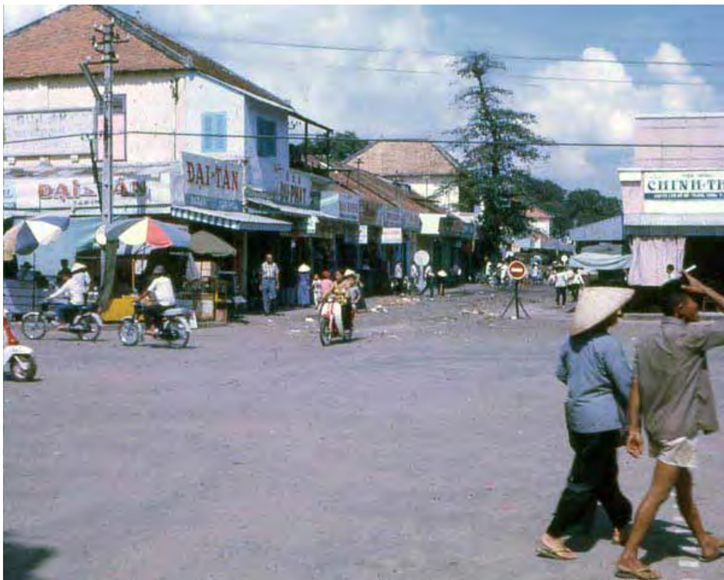
Dai Tan market. MSgt Summerfield, 1969: 01