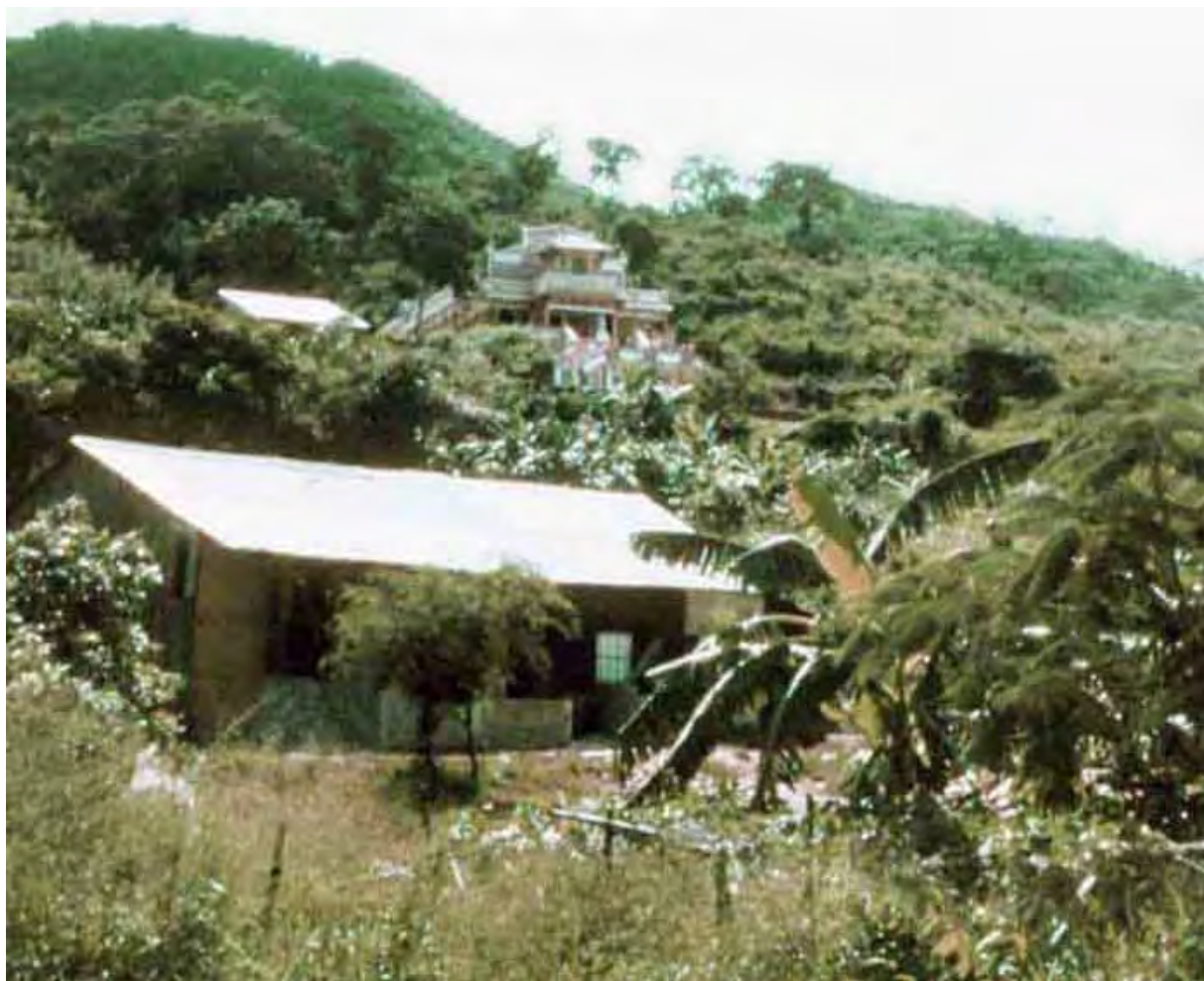
Dai Tan, Vietnamese homes.