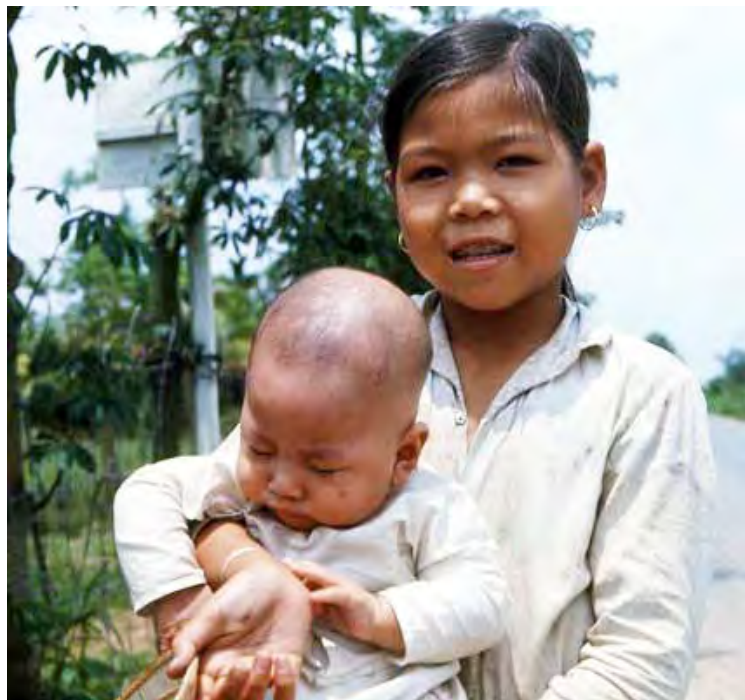
Dai Tan village girl carrying infant. MSgt Summerfield: 15