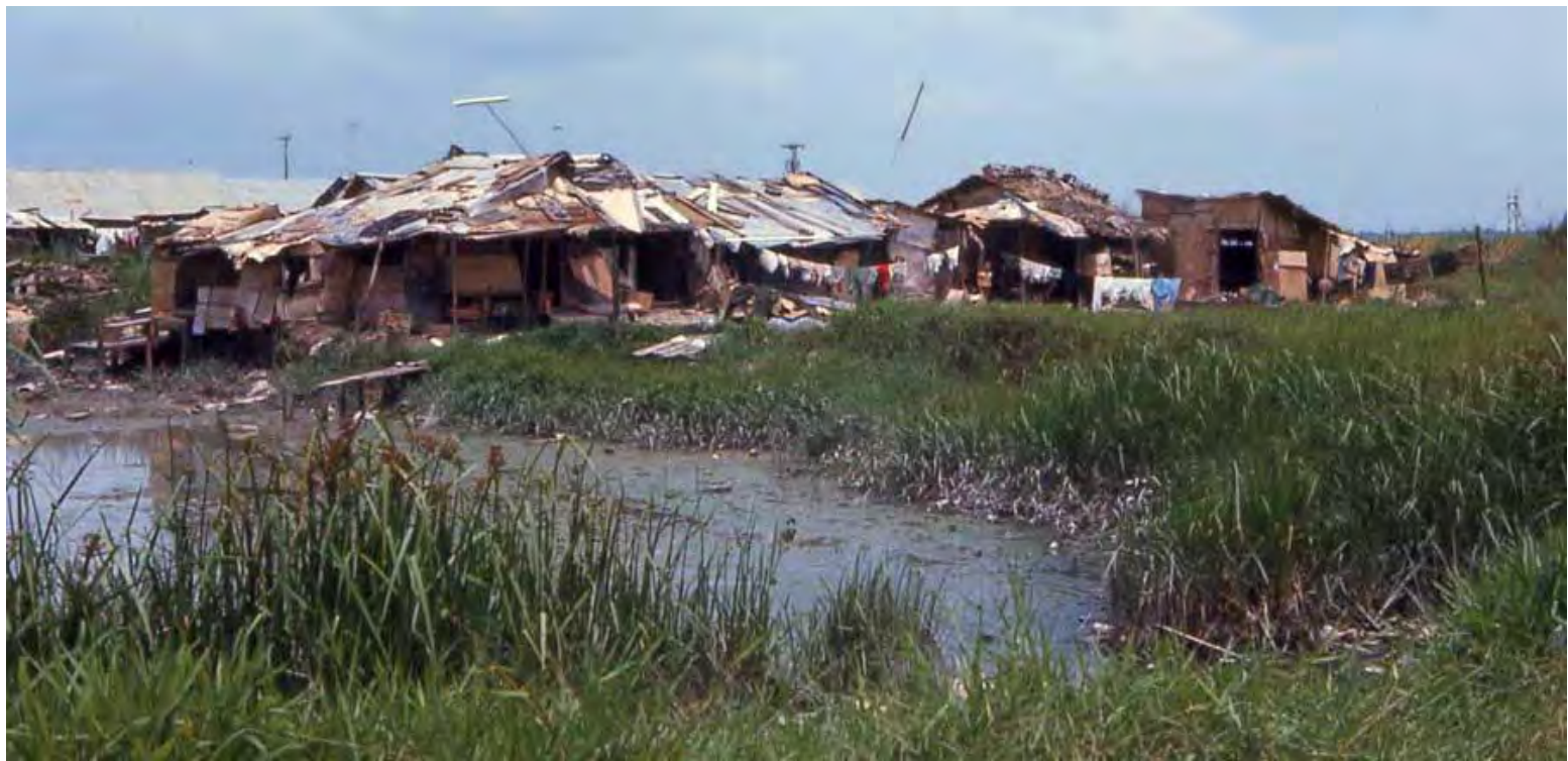
Dai Tan river-village. MSgt Summerfield: 09