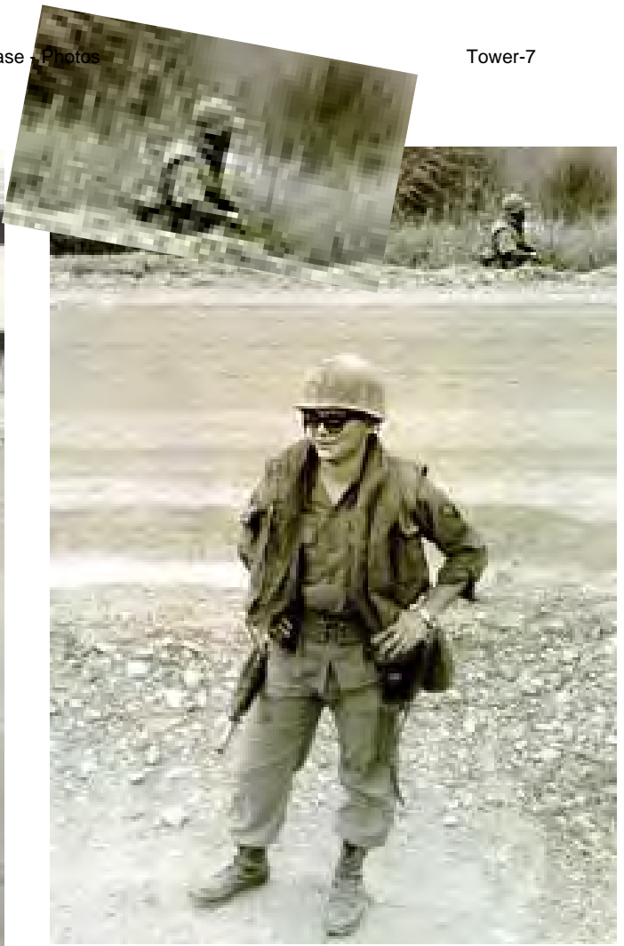
009 On perimeter Rd (name?). What's the SP doing in the ditch?