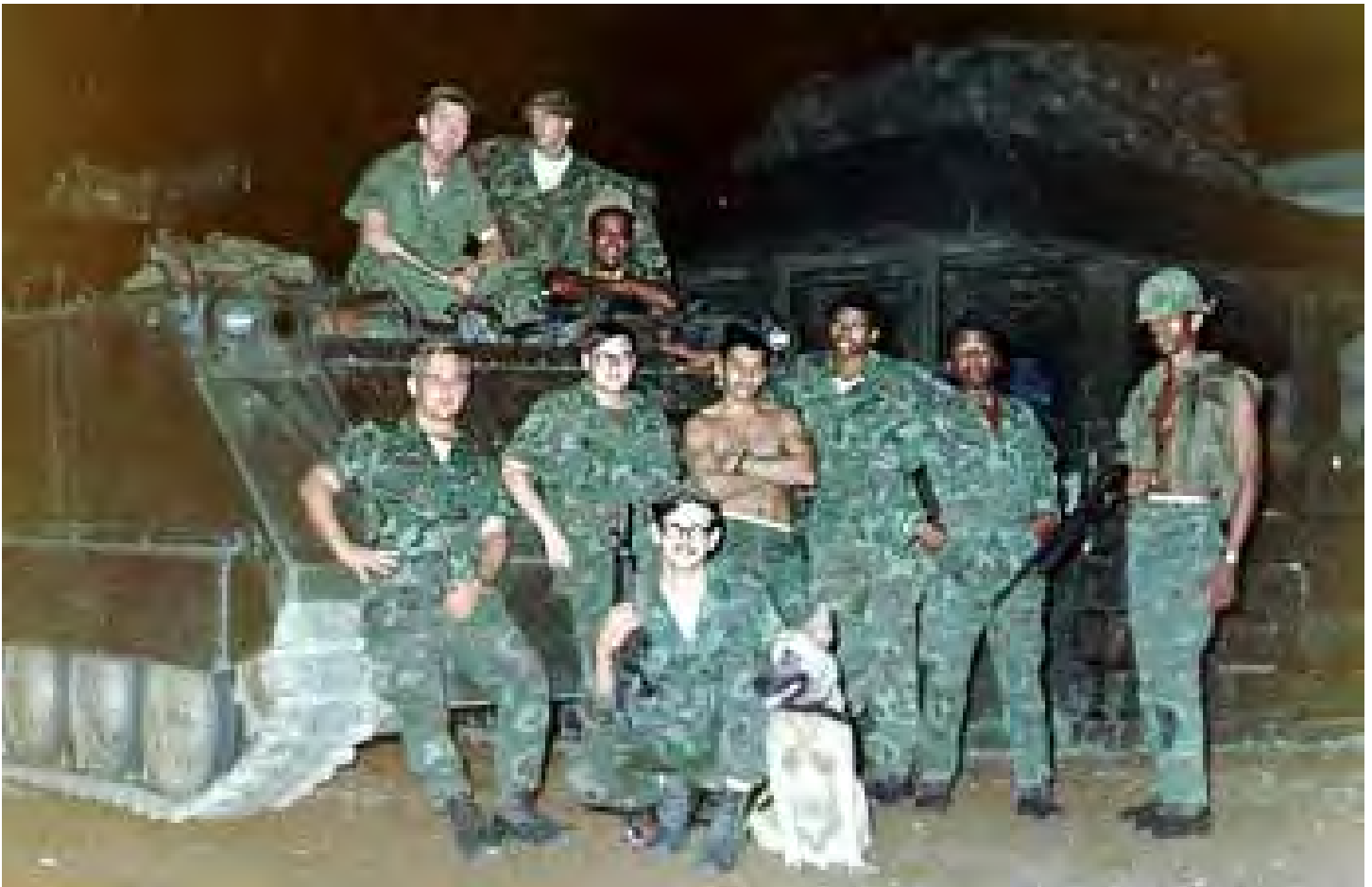
004 Luke: "Arf Arf... " (I warned you they were ugly!)