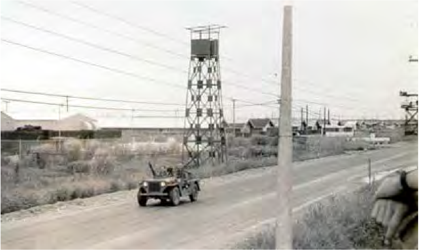
007 Perimeter Rd & tower 15A