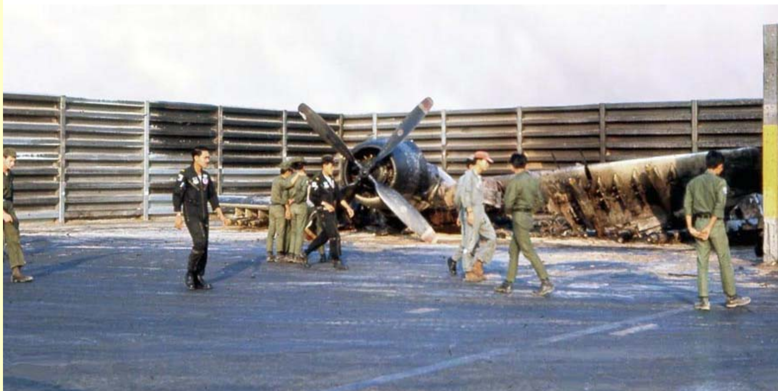
Binh Thuy Airbase, flightline damage inspected by VHAF pilots and crews. A1E revetments heavily damaged. MSgt Summerfield: 27