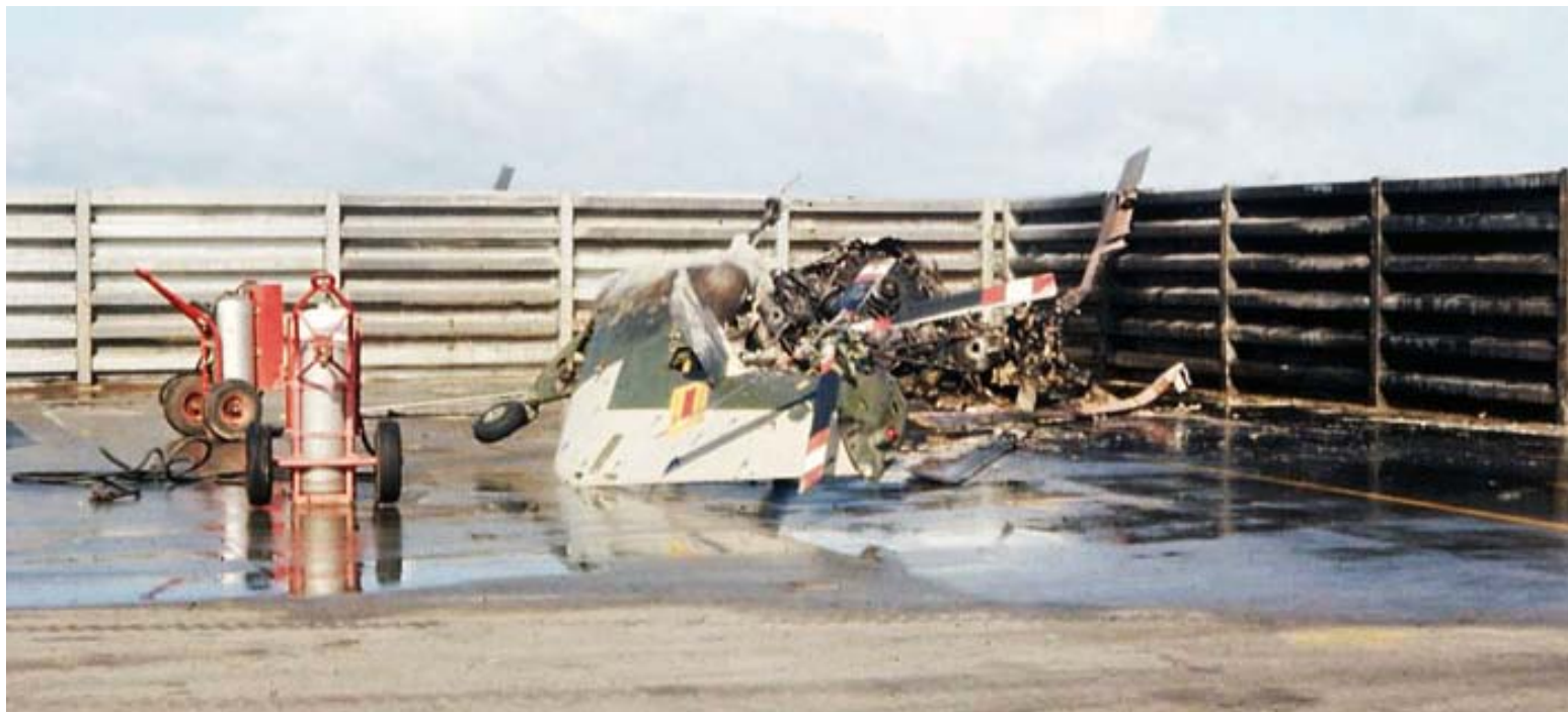
Binh Thuy Airbase flightline revetment. VNAF CH-34 Sikorsky destroyed. MSgt Summerfield: 30