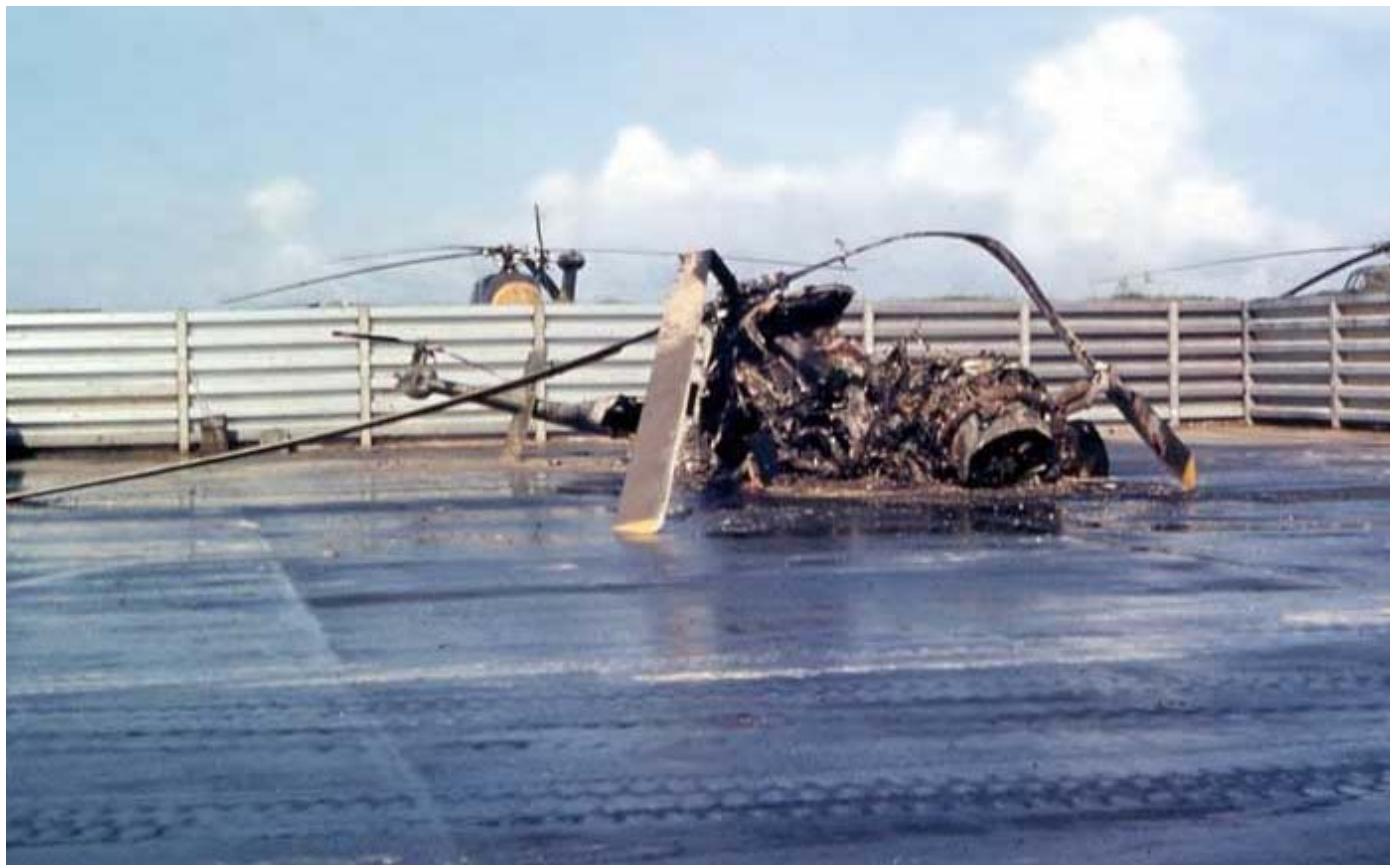
Binh Thuy Airbase, flightline damaged and destroyed VNAF choppers. Revetments contained the destruction. MSgt Summerfield: 28