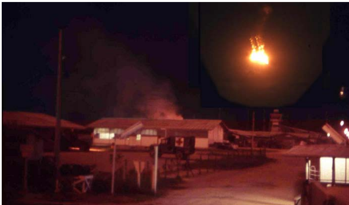
Binh Thuy Airbase, mortar attack. Flares light the base. Ambulance races to call. MSgt Summerfield, 1968: 21