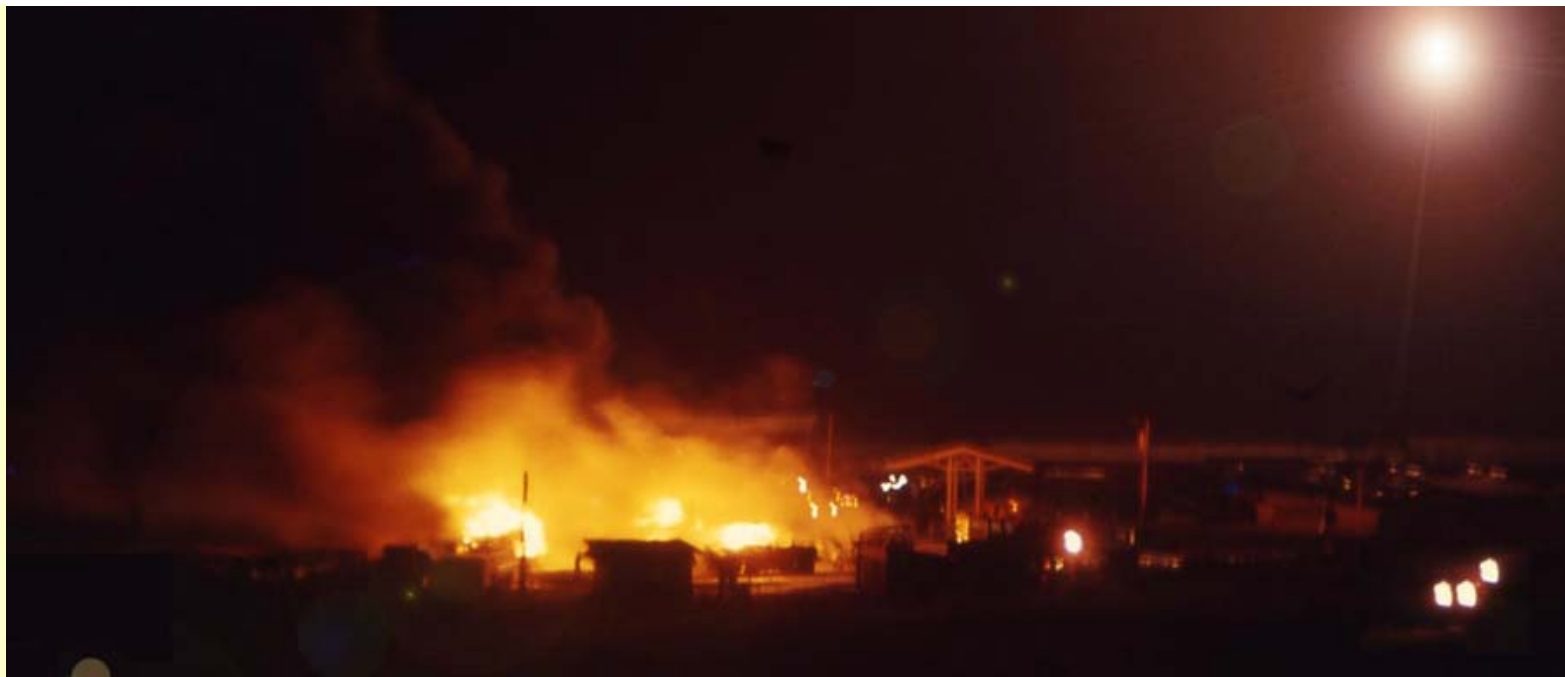
Binh Thuy Airbase mortar-attack strikes POL tanks, pump canopy, and barracks area. QRT continues search for intruders or casualties. MSgt Summerfield, 1968: 26