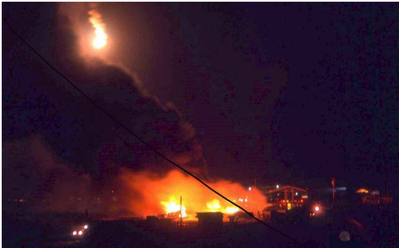
Binh Thuy Airbase mortar-attack strikes POL tanks, pump canopy, and barracks area. QRT searches for intruders or casualties. MSgt Summerfield, 1968: 24