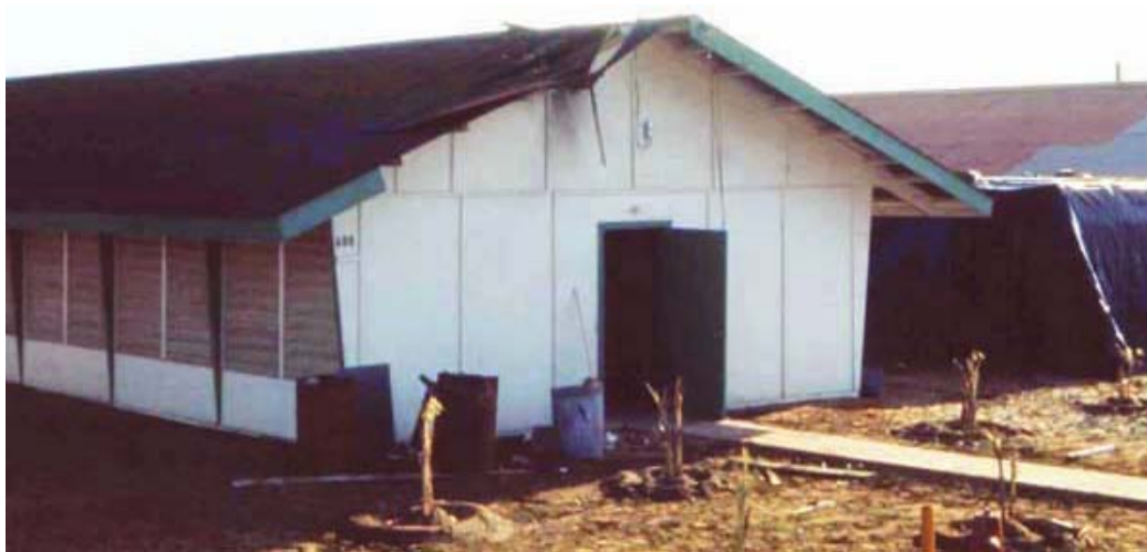
Binh Thuy Airbase, rocket damage. MSgt Summerfield, 1968: 38