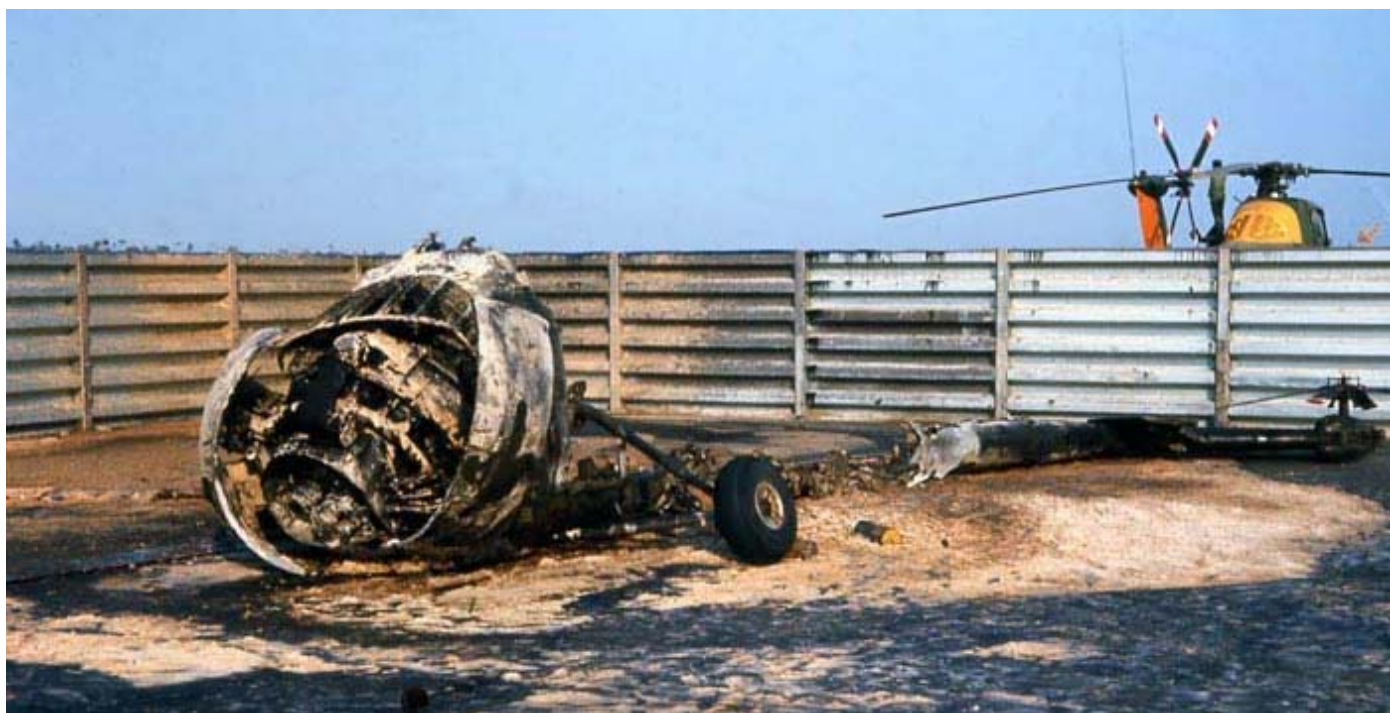
Binh Thuy Airbase, 26-flightline-ch34-sikorsky-revetment-destroyed-1. MSgt Summerfield: 29