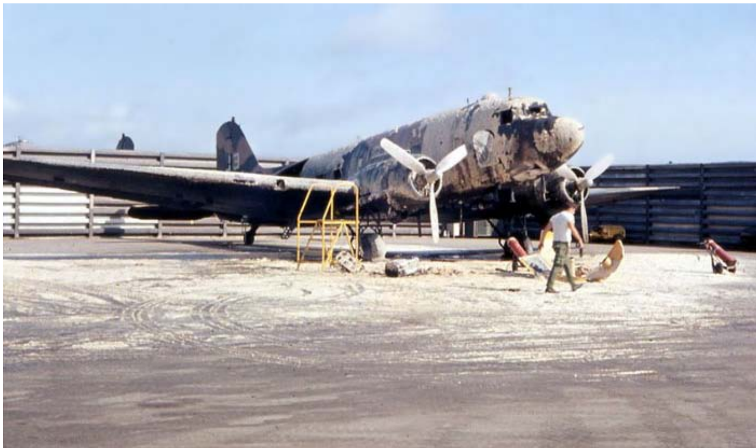
Binh Thuy Airbase flightline revetment. C47 fire extinguished and bird saved. MSgt Summerfield: 31