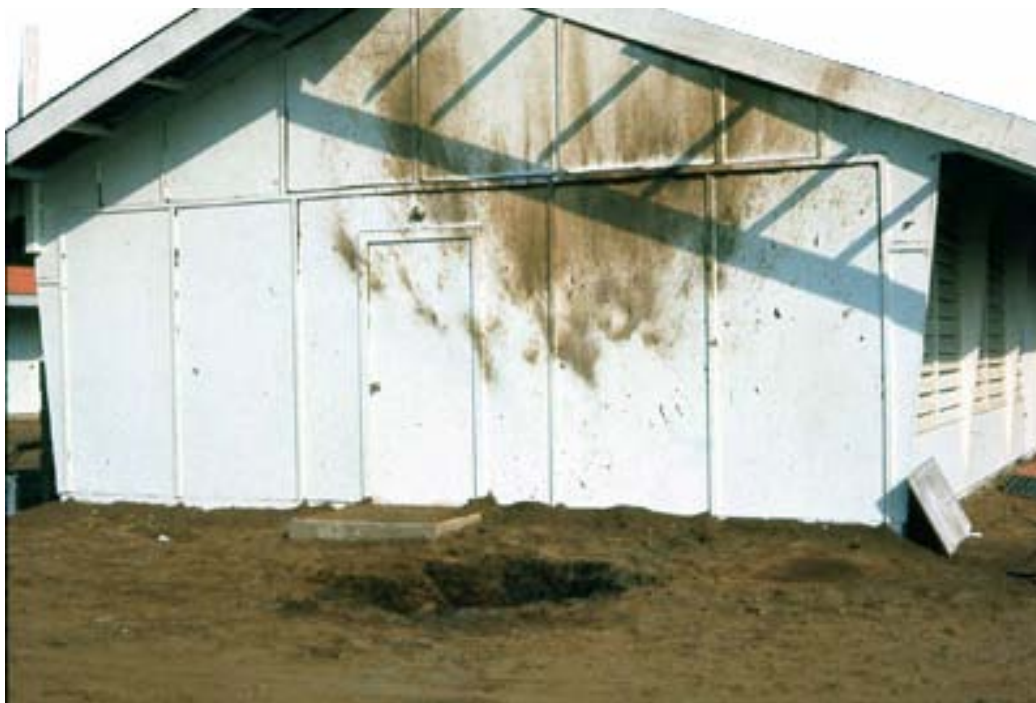
Binh Thuy Airbase, rocket damage. MSgt Summerfield, 1968: 37