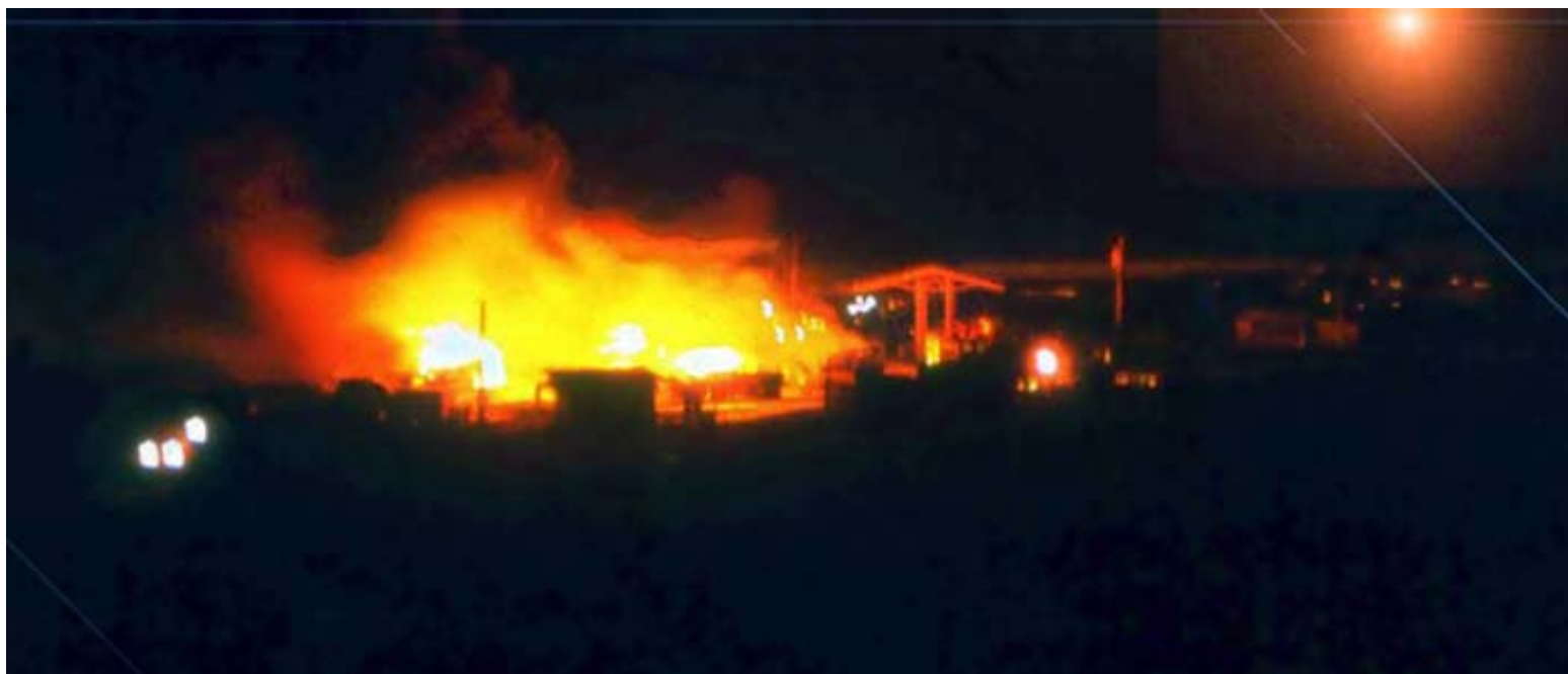
Binh Thuy Airbase mortar-attack strikes POL tanks, pump canopy, and barracks area. QRT searches for intruders or casualties. MSgt Summerfield, 1968: 25