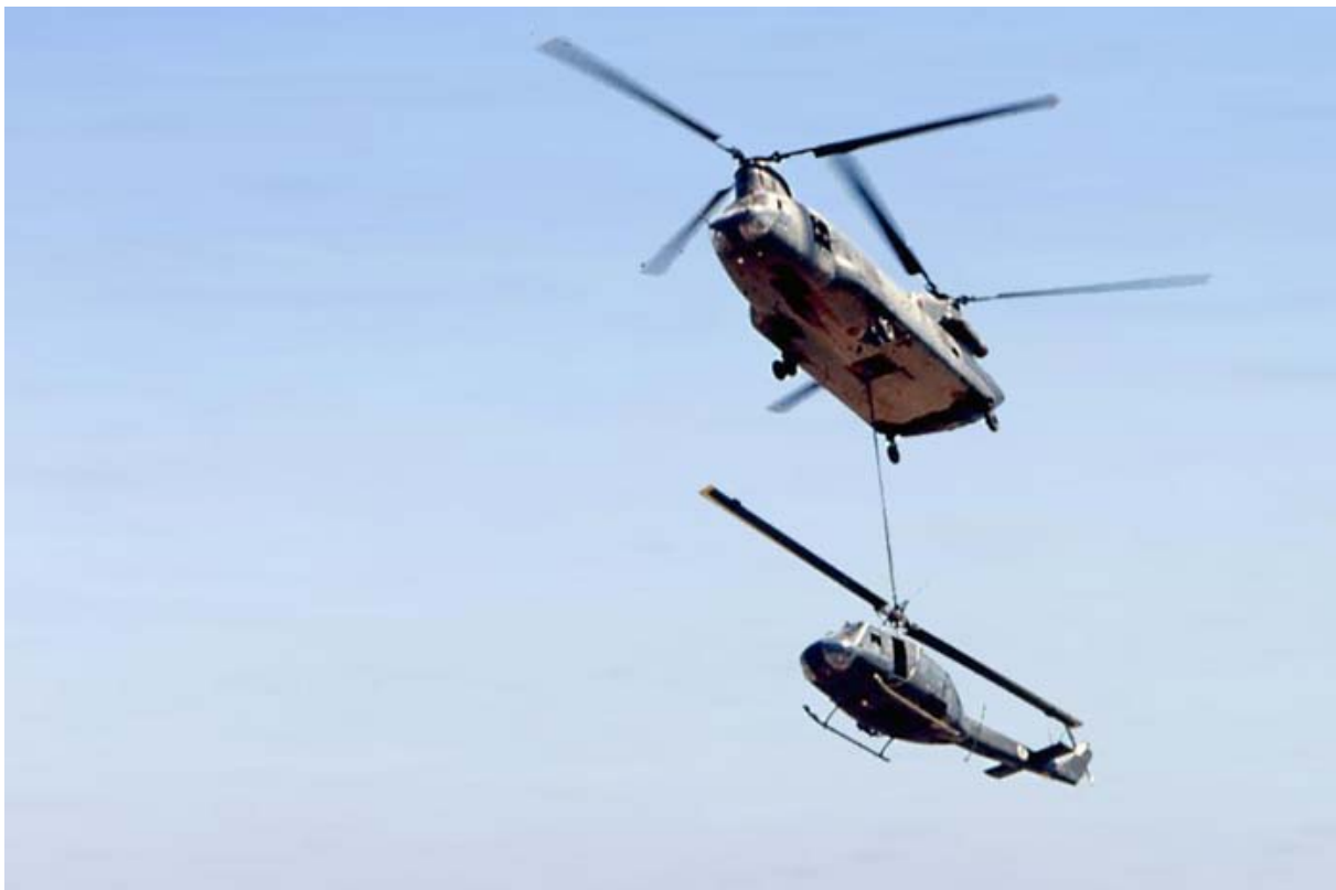
Binh Thuy Airbase, CH-47 rescuing Navy Huey. MSgt Summerfield: 36