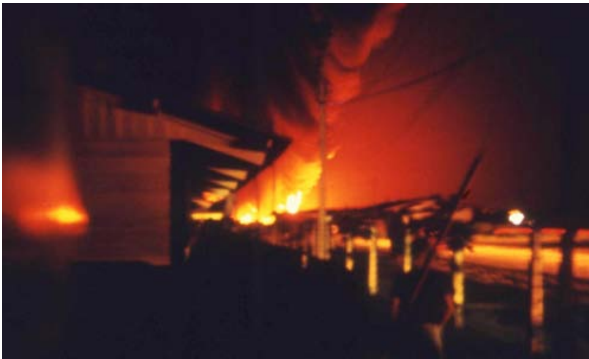
Binh Thuy Airbase mortar-attack strikes flightline, POL and barracks areas. MSgt Summerfield, 1968: 22