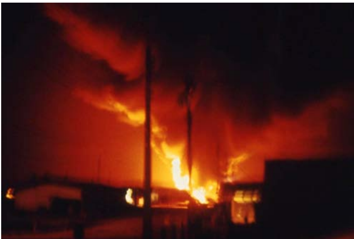
Binh Thuy Airbase mortar-attack strikes POL and barracks area. MSgt Summerfield, 1968: 23