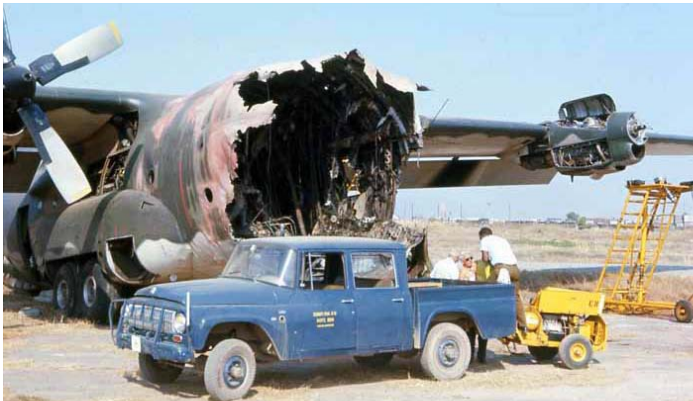
Binh Thuy Airbase. Aircraft mechanics and crews inspect destroyed C-130. Parts-is-parts. Damaged pickup tows generator. MSgt Summerfield: 32