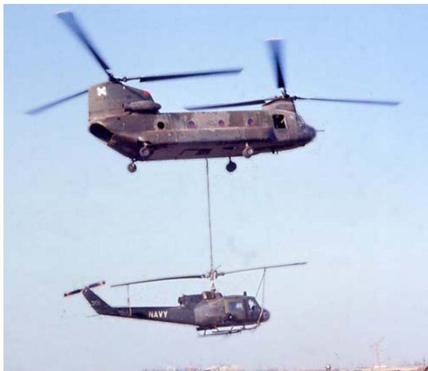
Binh Thuy Airbase, CH-47 rescuing Navy Huey. MSgt Summerfield: 35