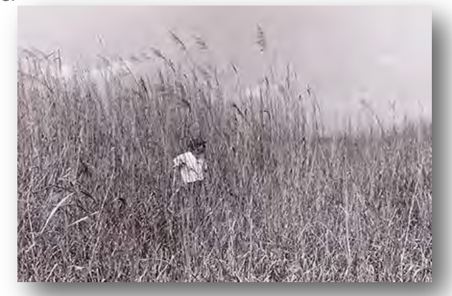
Photo-6 Title: Sgt Hall Tall Grass. This illustrates how tall the elephant grass was in some areas within the perimeter fences. Twenty yards behind me, the grass grew so thick that you would not have been able to see me.

"Charlie" area encompassed the west side and part of the south end of the base. Except for the Paddy Control compound there was not much in the Charlie Area but overgrown rice paddies. This side of the base was the preferred approach by sappers. Inside the fence lines, twelve to fifteen foot tall elephant grass and deep drainage canals offered very good cover and concealment for infiltrators. The guard towers in the "Charlie" area went by the call signs, "Charlie 3", "Kilo 4-Alpha", "Kilo 7-Alpha" and "Kilo 11-Alpha." "Kilo 11-Alpha" was located at the far southeast corner of the base. Guards on