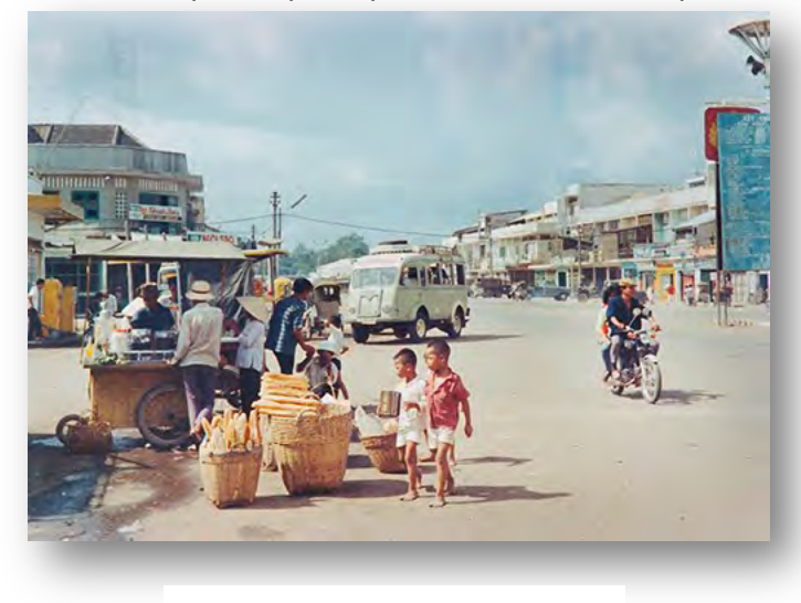
Photo-3 Title: Ben Xe Moi, Ben Xe Moi's main intersection, 1969. Down the street and to the left was the "bar district" where the "Cowboys" met you as you ventured into the alleys.

The bars were pretty much all the same, long narrow rooms furnished with low U-shaped booths or cheap sofas and coffee tables. Some actually had a bar with stools and everything! Vietnamese girls, who understood English better than they let on, would sit and talk with you if you bought them a Saigon Tea. Saigon Tea was a generic term. I got the general impression that it was usually warm Coca Cola, but it could have been dark tea or even coffee. It was served in an undersized shot glass. The price: one dollar. Payment wasn't made with the Greenback Dollar, it was made with MPC (Military Payment Certificate).