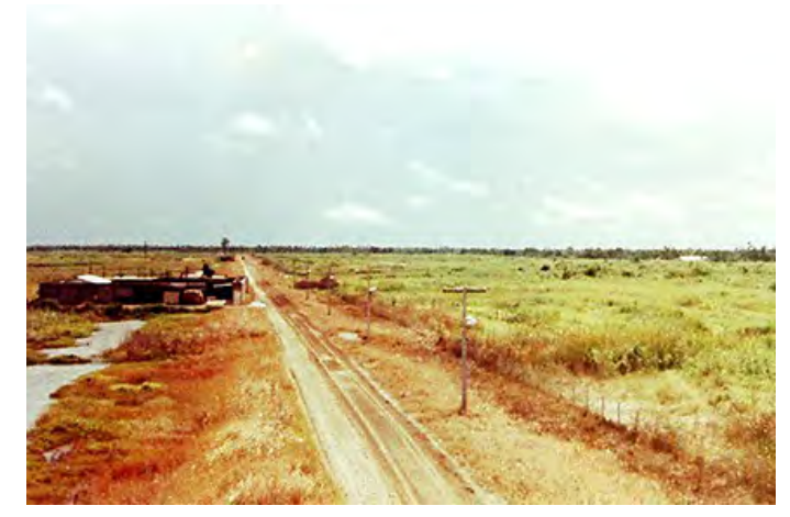
5: Binh Thuy AB: Effects of Agent Orange

The height and thickness of the grass made it easy for sappers to slither through the fence lines, so the ARVN set up night listening posts in strategic places a few hundred yards out from the road. The defoliant, Agent (or Agent Blue) was used extensively on the interior of the base to control the heavy vegetation. However, due to a lack of proper equipment it was difficult to spray the defoliant on the grass outside the base. Attempts by SP personnel were made, but the grass was very resistant.