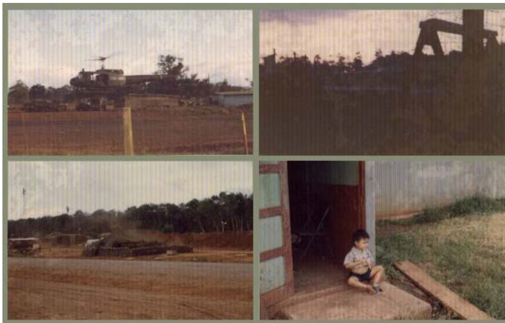
4) Camp Coryell. Red dust blowing everywhere!