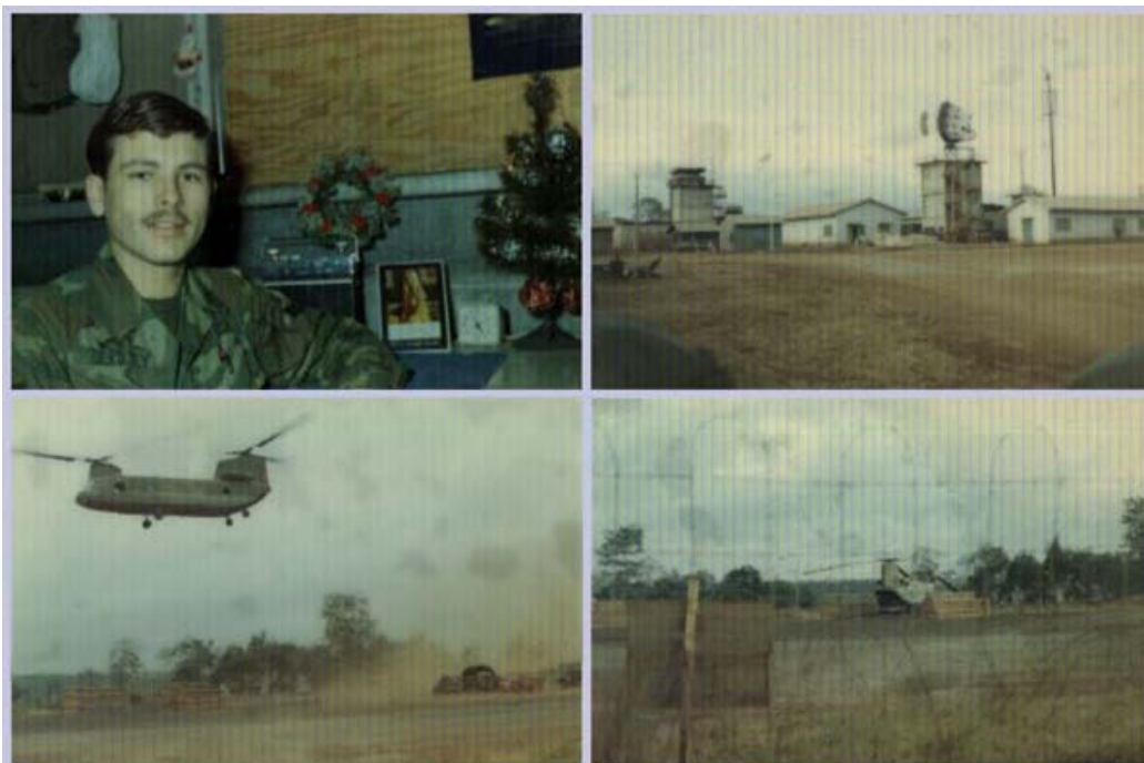
3) Camp Coryell, Detachment-9. Home of the 155 (AHC) Aviation Helicopter CO: gunships and slicks. Within that area was a detachment 9/619th Tactical Control Squadron, USAF (maintained separation in flying aircraft and artillery).

The sandbagged position contained a .50 caliber machine gun, a recoilless rifle, starlight scope, flares, radios and other sundry items. It was manned by an SP and if we were hit a second SP was added. There was someone else that served as a liason when we got hit and operated a radio on another non-SP net. The second photo in the image with the fuel truck driving by is looking almost due north and the 155 area is visible on the left.