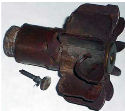
5) Chi Com mortar fins and detonator, dug out of the ground.