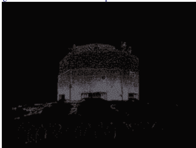
Photo: Bunker Hill-10, Biên Hòa Air Base.