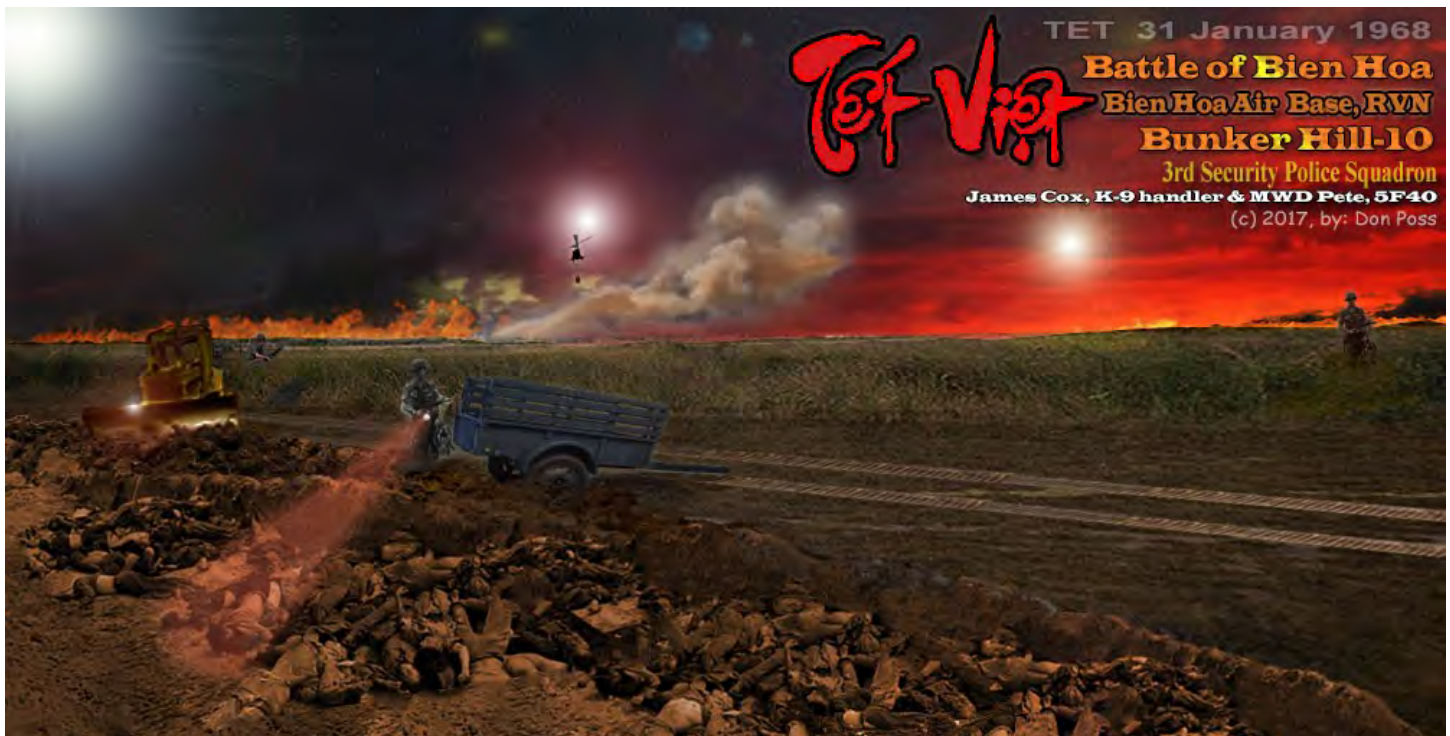
Battle of Biên Hòa, Bunker Hill-10: First of two mass-graves. K-9 handler James Cox stood guard over the oven pit Tết 31 Jan 1968.

I believe they were burned before the trench was finally covered. The thing that is still with me is the smell of the dead bodies, all night long on that K-9 post.