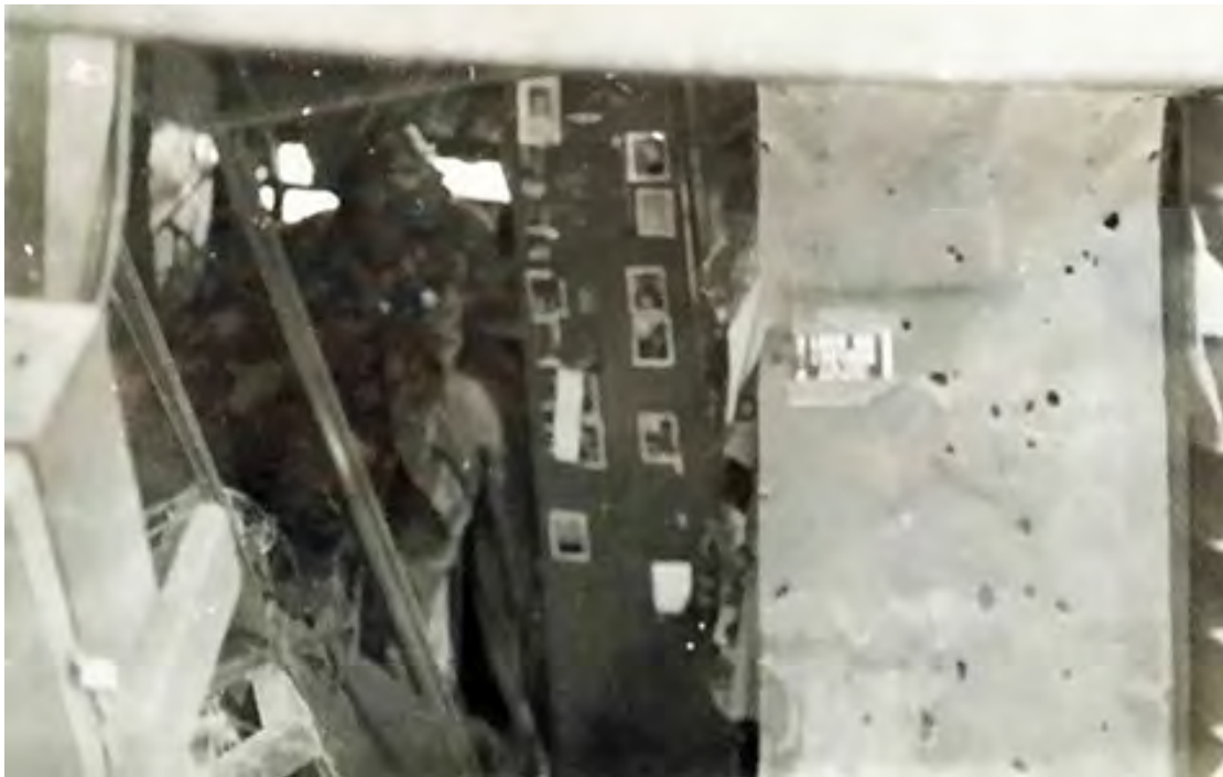
Biên Hòa Air Base, K-9 and 3rd SPS Law Enforcement Police hut. Tết 31 Jan 1968.

It was a very long night, and there was plenty of time to think about the rocket attack a couple of nights before, when the K-9 and 3rd SPS Law Enforcement Police hut was hit by a rocket.