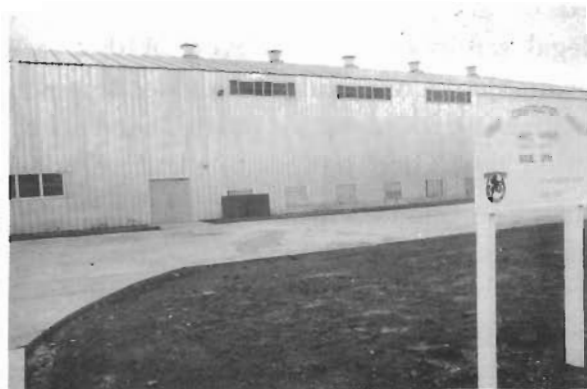
New Base Gym

Besides the varsity competition, there is a growing participation in intramural activities. These include softball, basketball, volleyball, bowling and touch football.