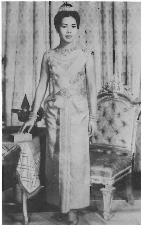
KING AND QUEEN OF THAILAND

Thailand is a country about the size of France and nearly as large as Texas, with a population of more than 30 million. The Royal Kingdom of Thailand is located on the Southeast Asian peninsula, bordered on the east by Cambodia, and Laos, on the west by Burma, on the north by Burma and Laos, and on the south by Malaysia and the Gulf of Thailand.