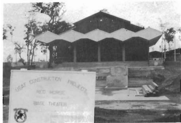
New Base Theater