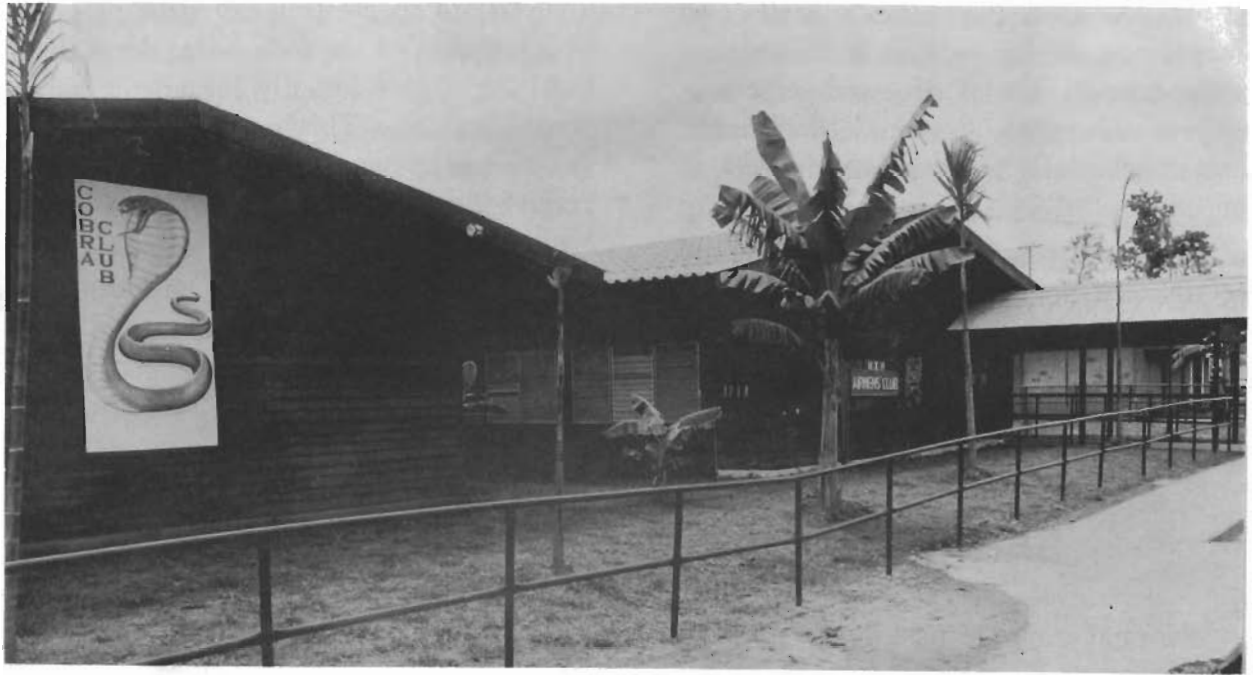
AIRMEN'S OPEN MESS