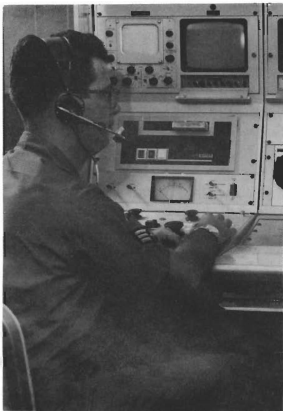
AFTN - CHANNEL 74

The local AFRTS television station went on the air for the first time on