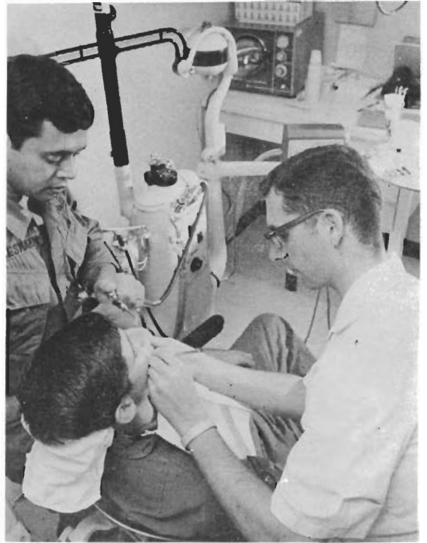
NEW MEDICAL FACILITY

Personnel requiring appliances and accessories such as hearing aid batteries, dental partials and glasses should insure that they have the required number of such items before departing the continental U.S. The time involved in getting the items in this remote area could cause you a loss in job proficiency and personal discomfort.