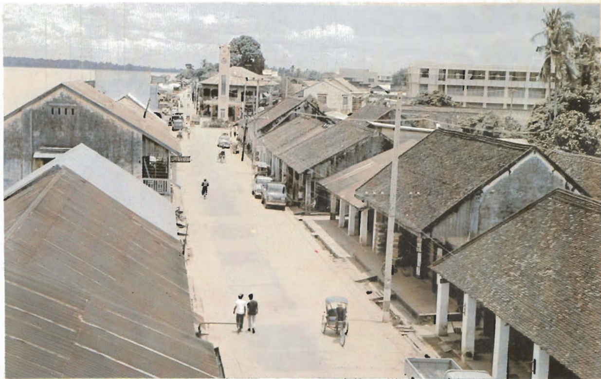
NAKHON PHANOM MAIN STREET

Thailand has been an independent country for hundreds of years, far longer than the U.S. It hasn't been the colony of any country, developing its own culture and heritage. The Thais are justly proud of this freedom.