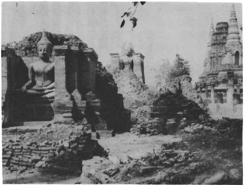
SUKO THAI RUINS

hospitable and very much interested in the western world. Many of the people speak English, and this is, for the most part, the "foreign" language taught in public schools.