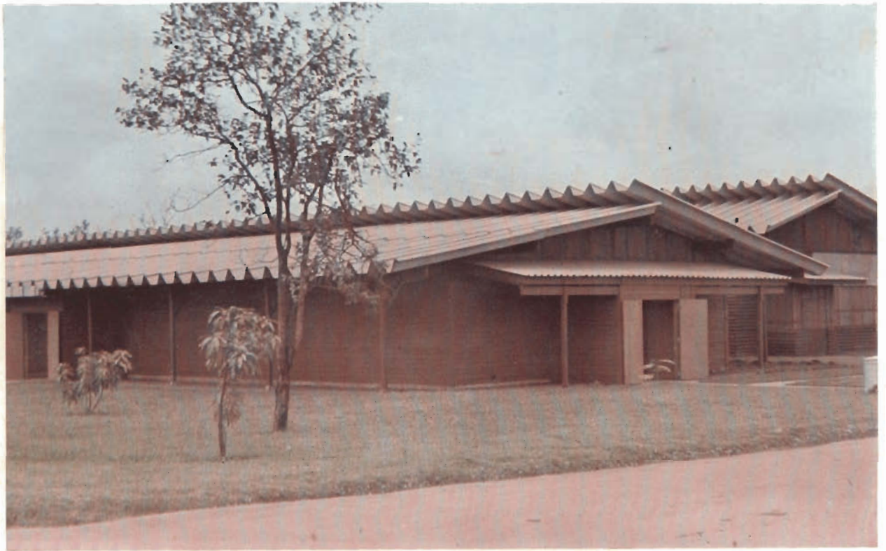
SOON-TO-OPEN USO CLUB