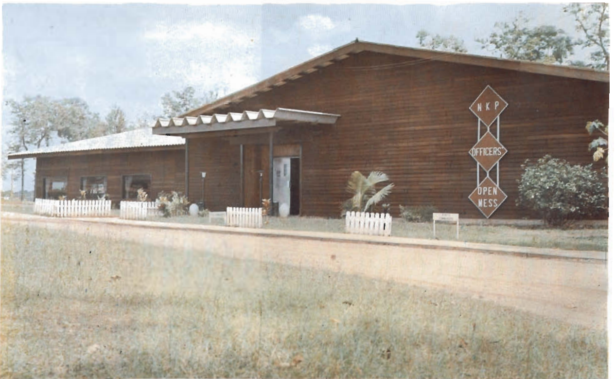
OFFICERS' OPEN MESS