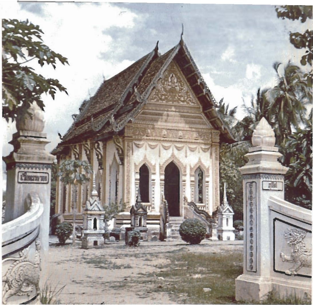
TEMPLE IN NAKHON PHANOM CITY