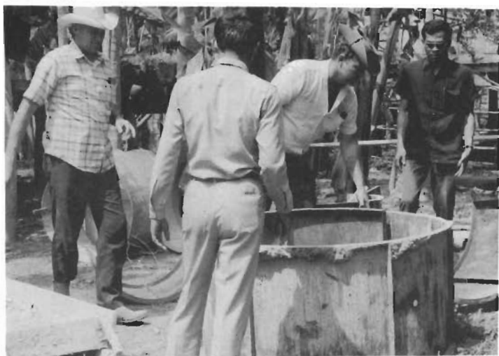
INSTALLING A WELL

but no train service is available. The roads leading to the city, both from Sakon Nakhon to the southwest and Ubon to the south, are mostly unpaved. Poor road conditions during some parts of the year often limit automobile driving to the city itself.