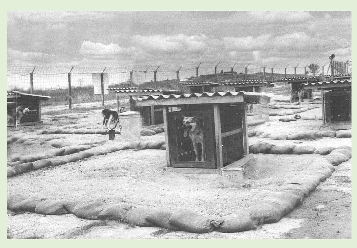
Photo Above: Dusty in the original kennels at Bien Hoa

In the summer of 1964 I had the incredible good fortune to go to the Dog Handler School at Lackland AFB in San Antonio Texas from the 832nd Air Police Squadron at Cannon AFB, New Mexico. I was only 18 but had been chosen to train to do the best job an Air Policeman could have—that of a dog handler.