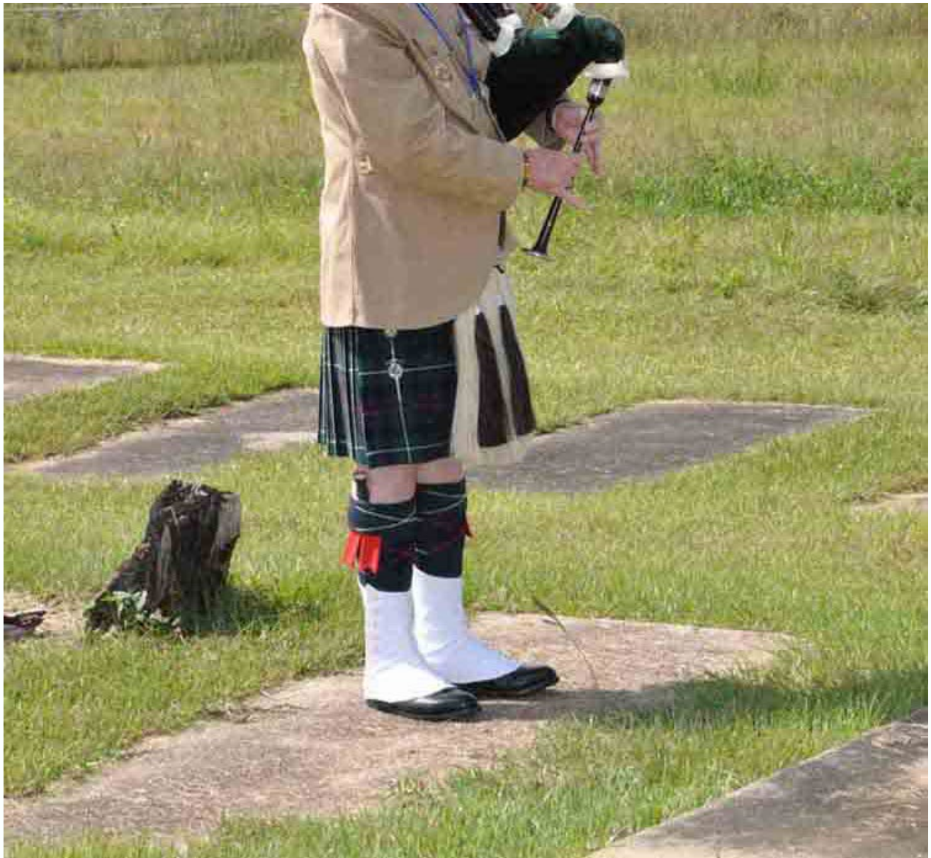
(108) ... We've no less days to sing God's praise... than when we've first begun....