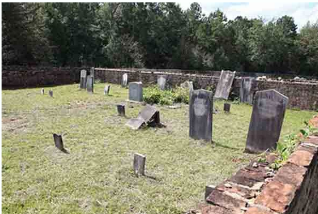
(117) Rabb Family plots, bricked-in location, at Rabb Cemetery, Evergreen Alabama.