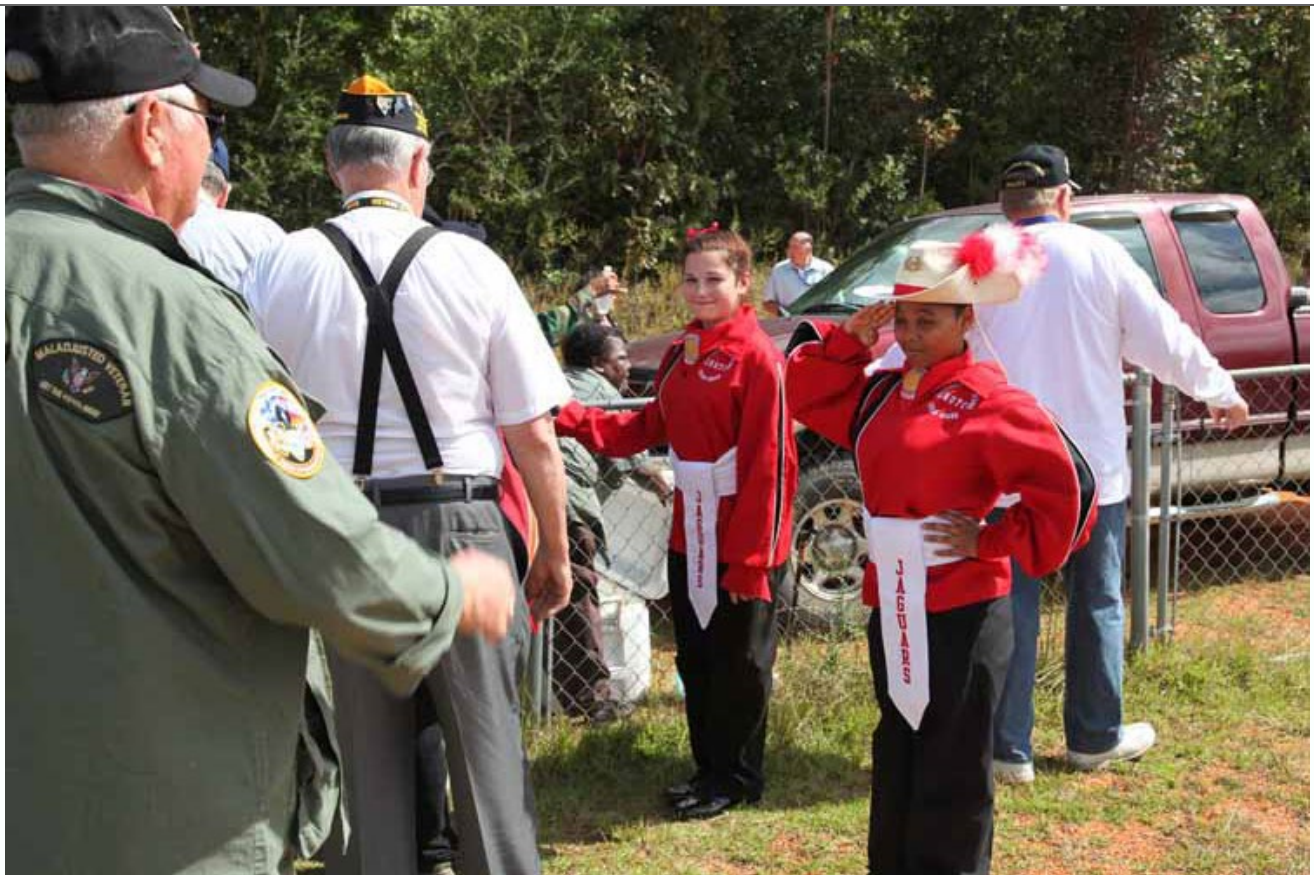
(109) VSPA Members exit Rabb Cemetery's gate. JROTC "Jaguars" salute members. :)