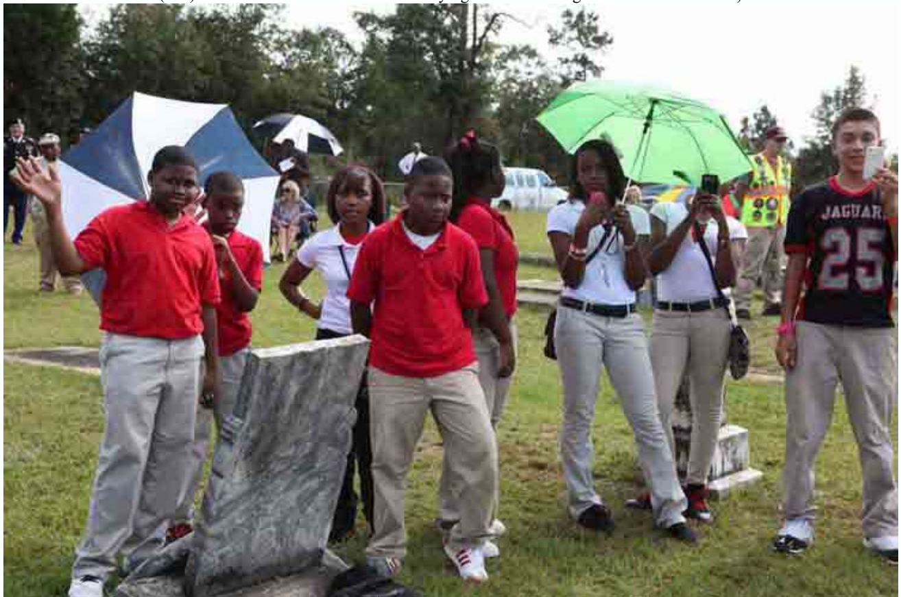
(110) Middle School "Jaguars" wave and take iPhone photos. Very polite young kids!