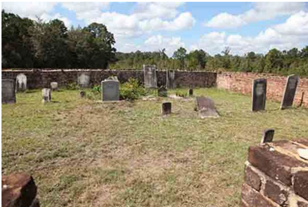
(116) Rabb Family plots, bricked-in location, at Rabb Cemetery, Evergreen Alabama.