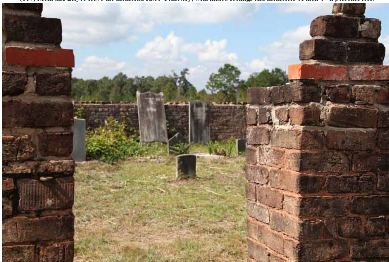
(115) As VSAP members enter/exit Rabb Cemetery, they see a Rabb Family bricked-in location, which was part of the original cemetery built in the early 1800s. One of the tombstones lists a deceased as having been age ten when our country celebrated its first 4th of July holiday.