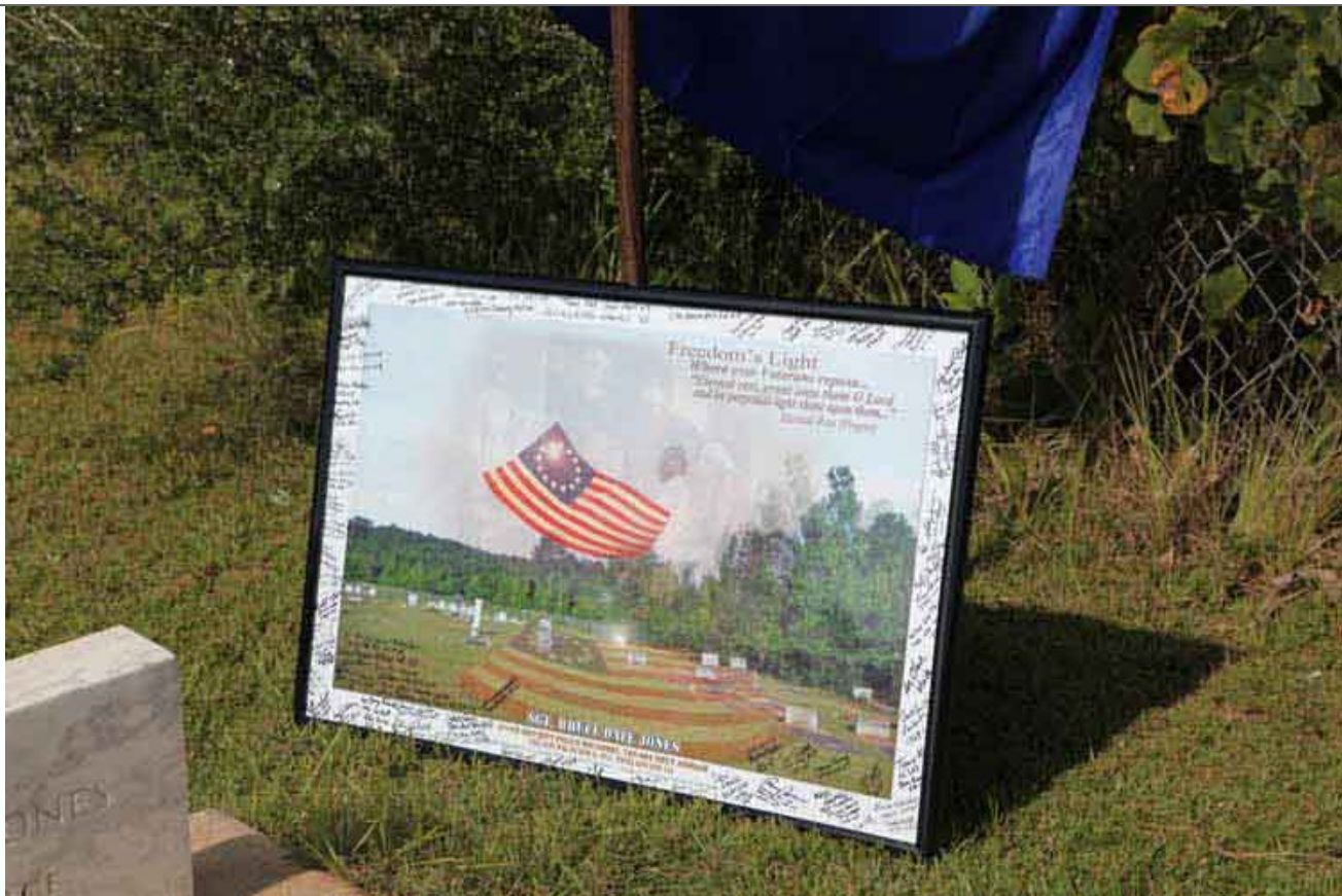
(112) USAF Flag was posted near Sgt Jones' tombstone with the framed Poster and signatures.