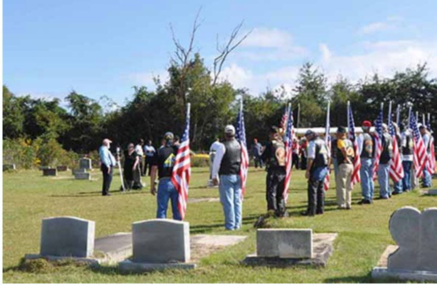
(8) The Patriot Guard Riders, awaiting VSPA members. High School bus is parked at entrance.