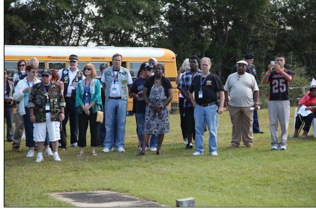
(13) Other locals stand with gathering VSPA members.