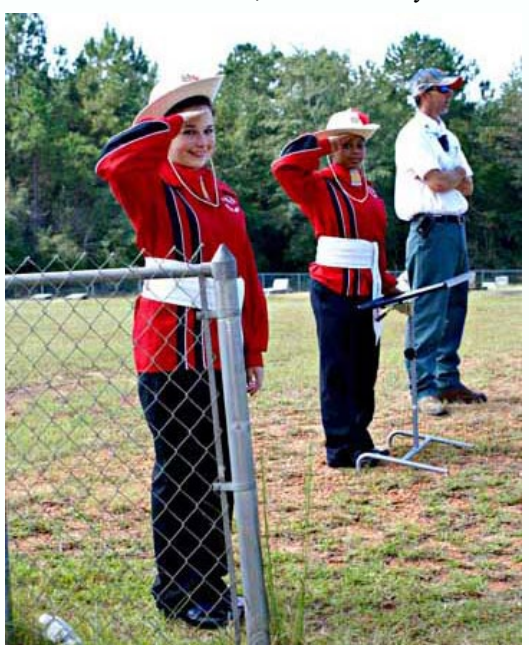
(6b) Evergreen's Hillcrest High School JROTC Color/Honor Guard, salute smartly!