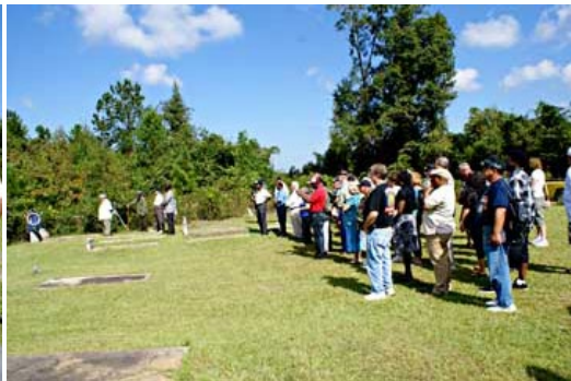
9.a/b/c: VSPA members and local folk await memorial ceremony's start.