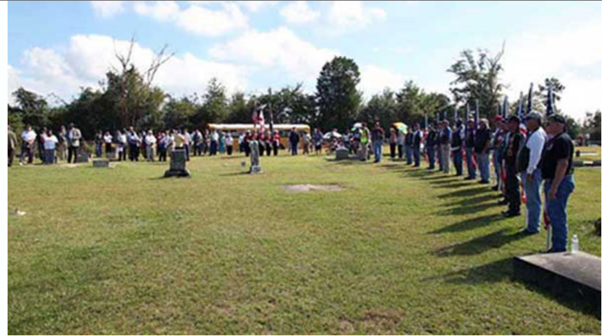
(10) Evergreen's Hillcrest High School JROTC Color/Honor Guard form up at entrance (center, near school bus).