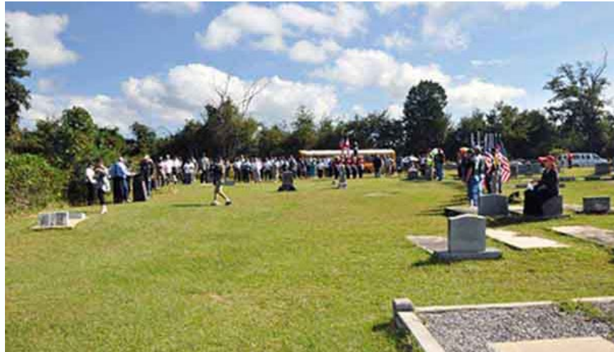
(9) VSPA members gather after walking a hundred yards through parked cars to Rabb Cemetery entrance.