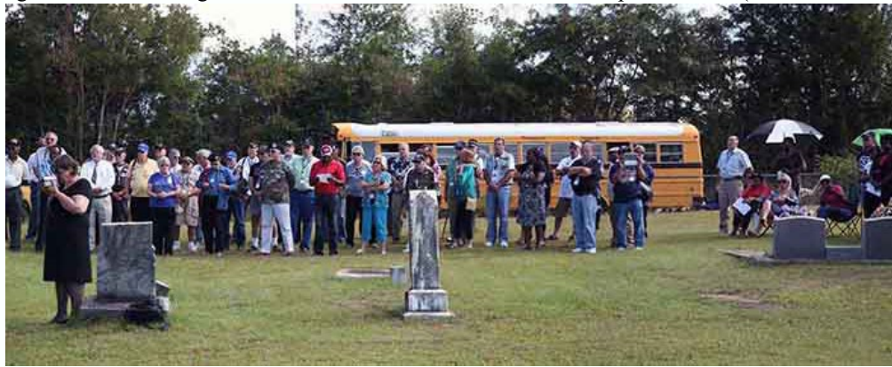
(11) VSPA members and local folk awaiting start of memorial ceremony.