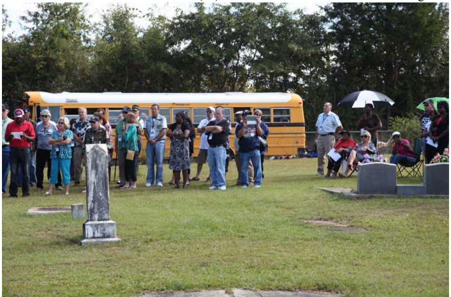
(12) Morning sun is growing hotter and locals wait under umbrellas in comfort and folding chairs.