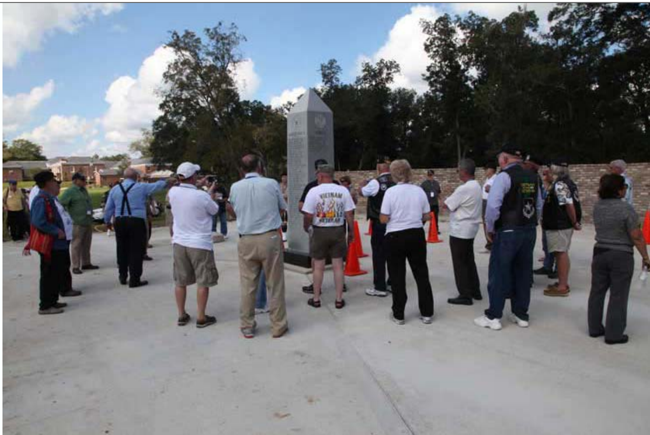
(11) World War I: A staggering war that failed to end all wars, and reaped its bounty in blood.