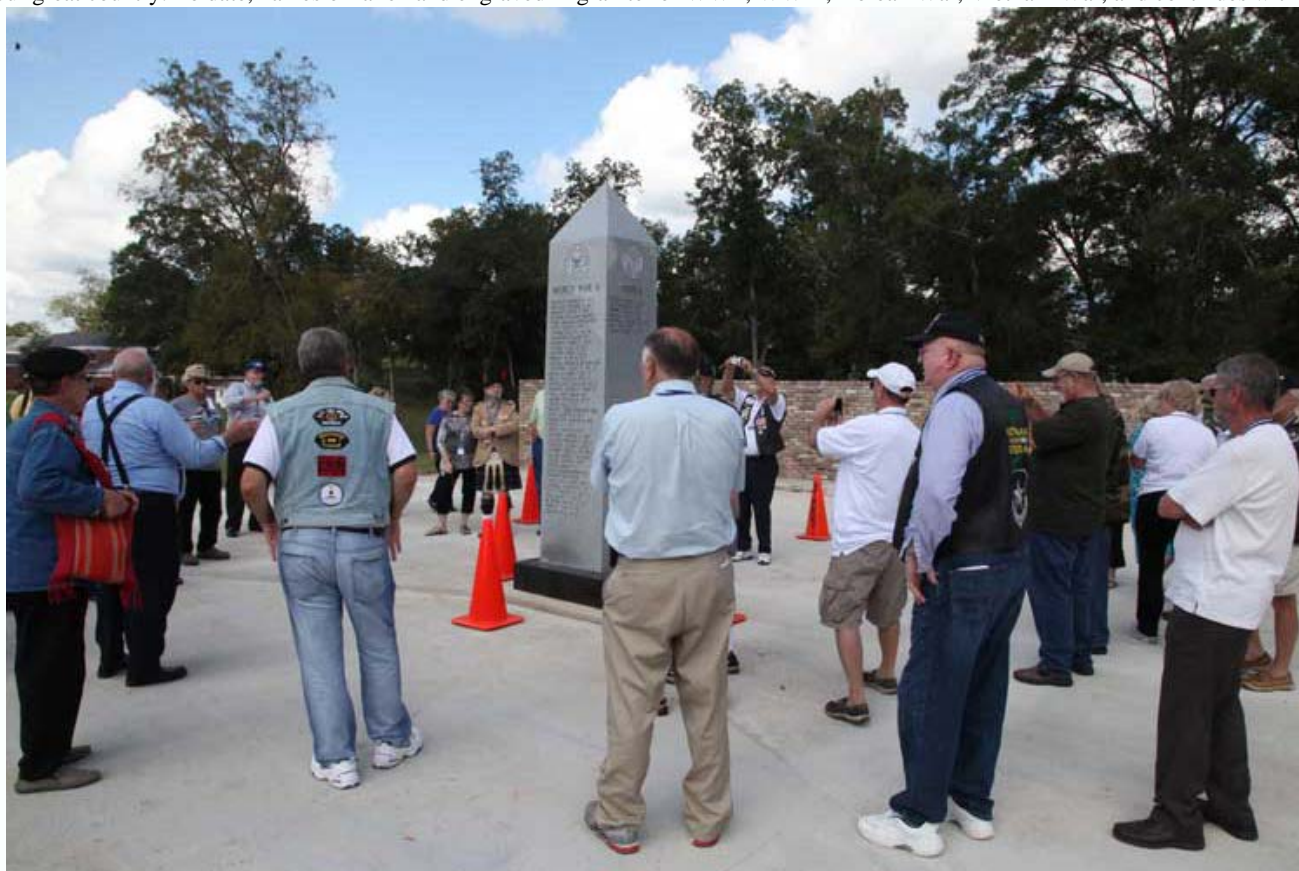
(10) Viewing each side of the monument, names of wars carry the pain of foreign wars, the local community and passing veterans.