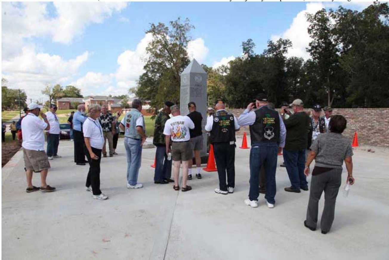
(6) The monument is a beautiful work of art itself. But it has a way of giving-back that beauty in that its surface reflects cobalt blue skies and drifting marsh mellow clouds on the one side... and forest green ancient trees nearby and across the street. Most precious to me are the reflected faces of friends who one-and-all know the true cost of war is written before them.