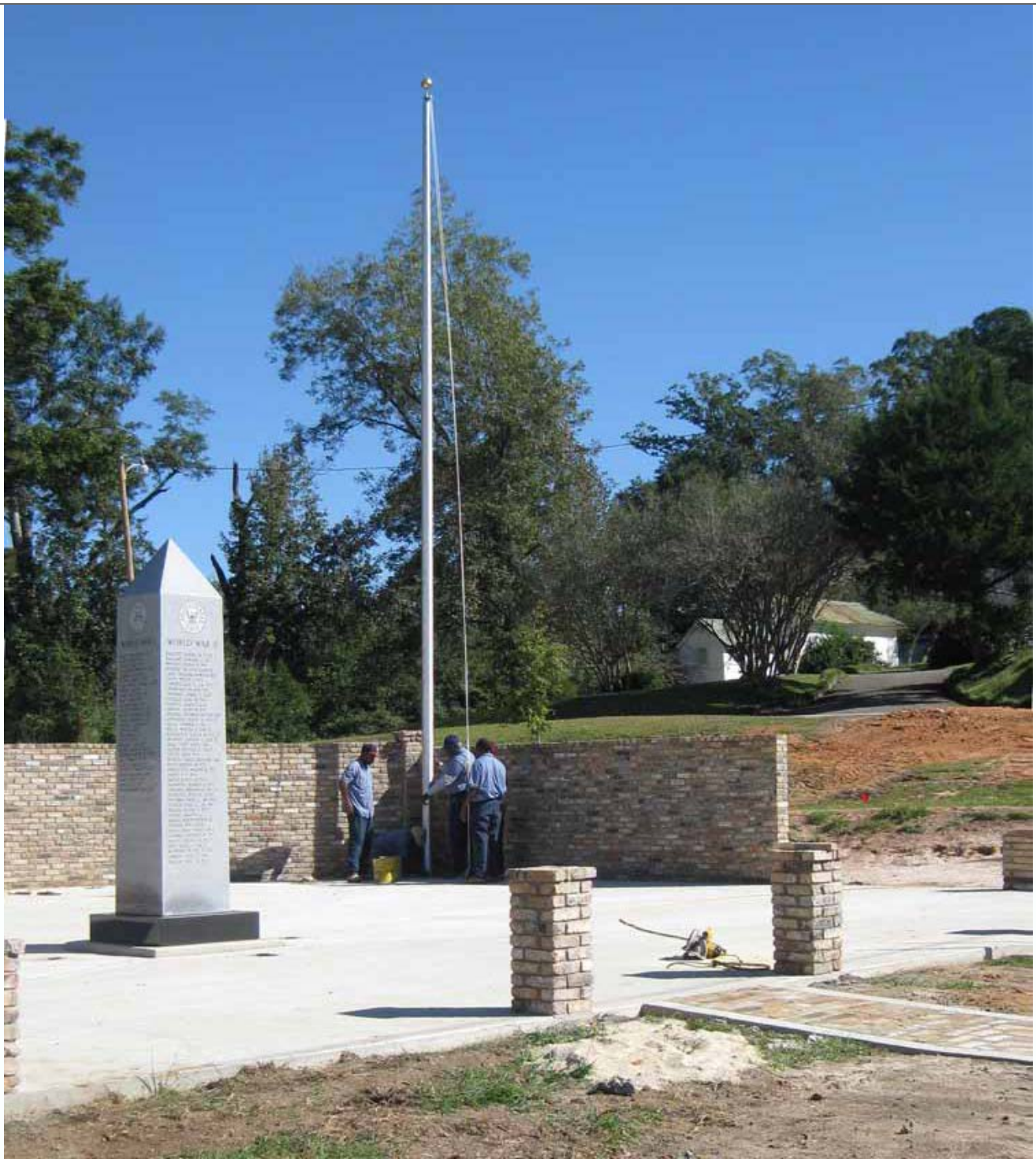
Two Weeks after VSPA's visit to the Evergreen Veterans Monument, construction advances (Click photos to see full view). James Windham