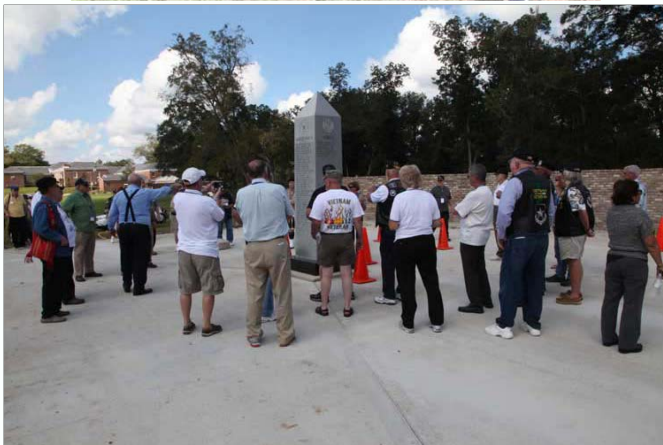
(13) VSPA Members stand quietly, lost in thought... glad to be a part of this day...