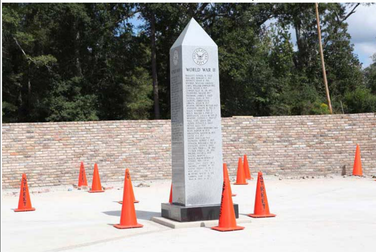
(17) Oblique view: World War II (Front/South side); Korean War; Vietnam War (East side).