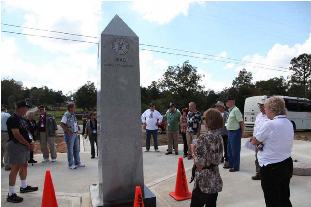
(18) Iraq (North side), lists first KIA/LOD.