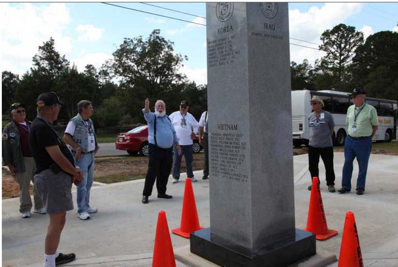
(15) Korean War, Vietnam War (East side); Iraq (Terrorist Wars; North side).