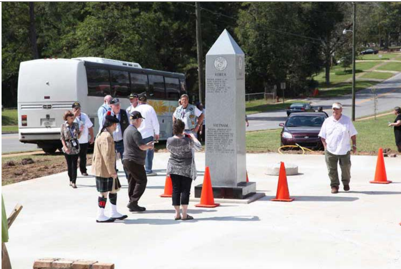
(5) 57 VSPA members climb off the bus, tired but elated. Cameras break out and everyone jockeys for position, and everyone gets their perfect shot.