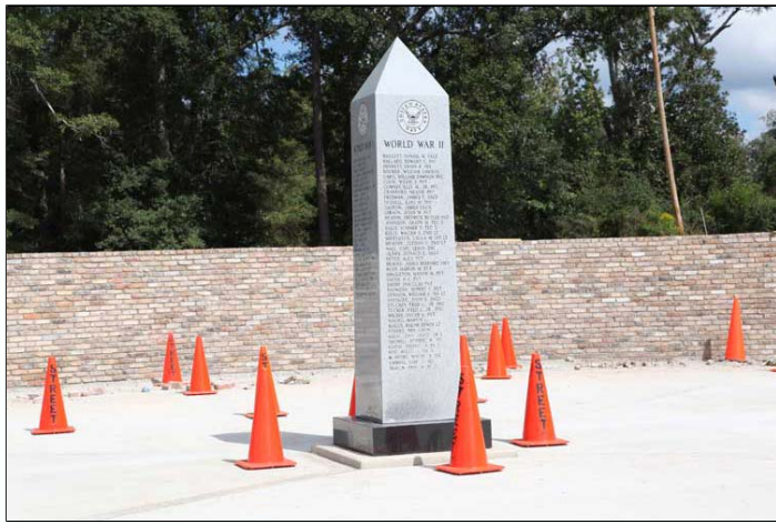
(16) World War II (Front/South side).