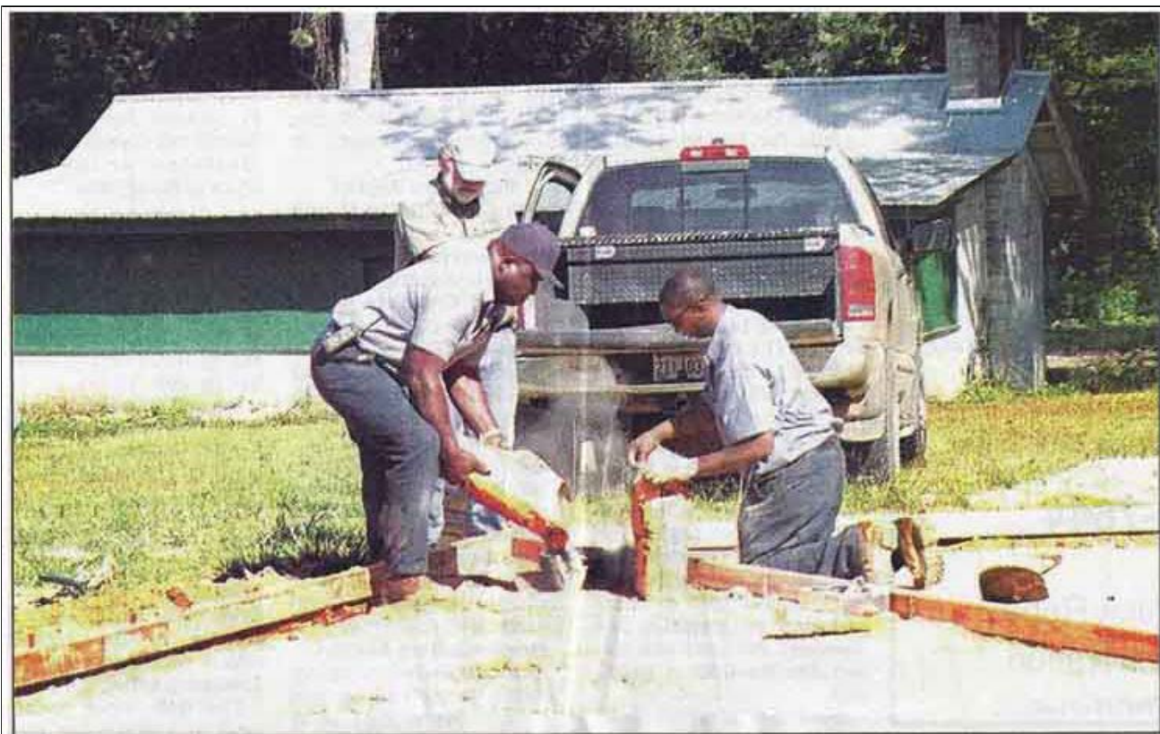
Workers with Evergreen Concrete, pictured above, began pouring the concrete base around the new county war memorial Wednesday of last week and it's hoped that the monument will be finished in time for a special ceremony on Veterans Day. The monument, which honors the county's war dead and other service members, is located on the corner of Perryman Street and North Shipp Street in Evergreen.

(3)