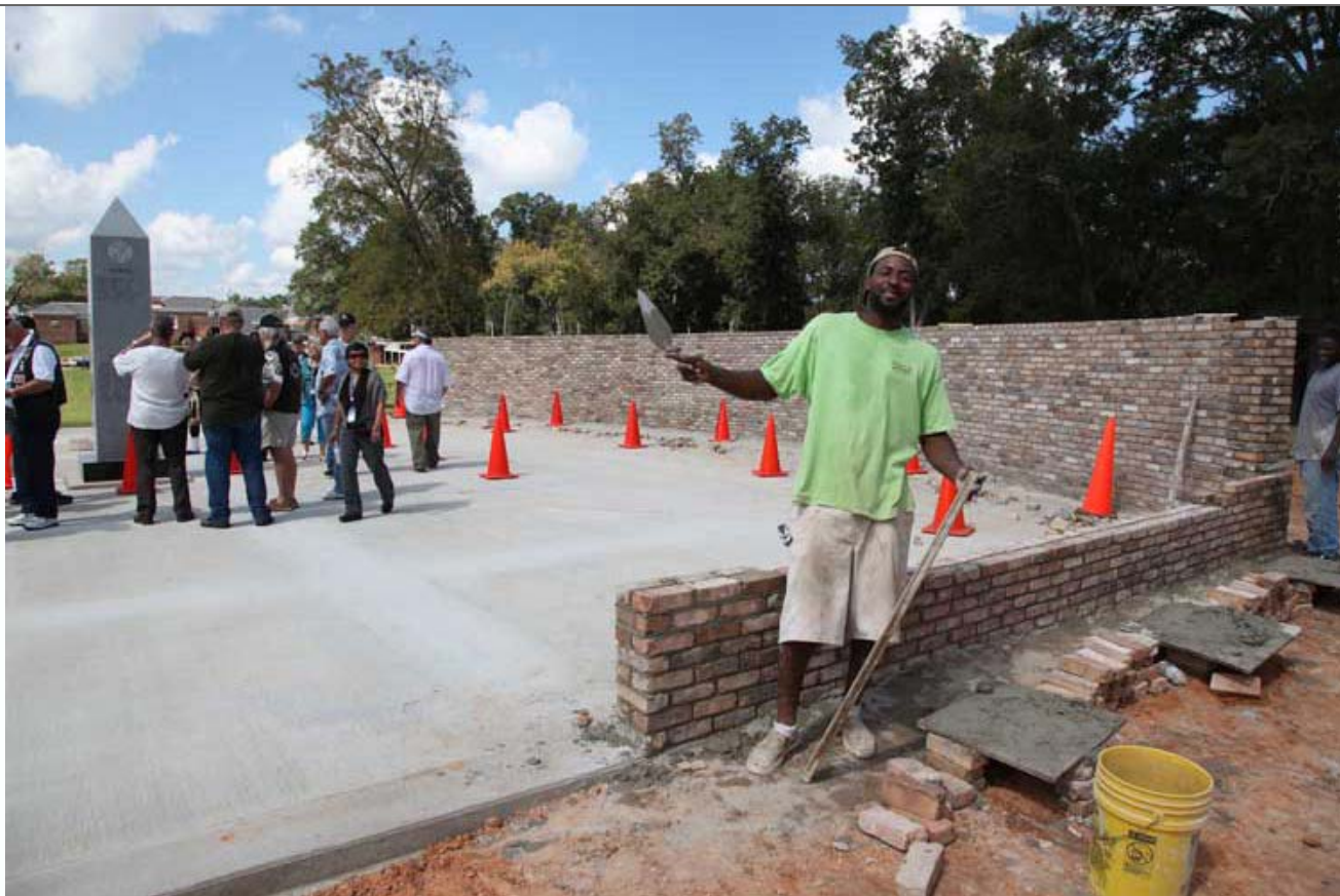
(7) Construction with a Smile, Alabama Style! The mason offers a friendly southern-greeting without missing a brick-laying-beat . You can't help but smile at his enthusiasm.