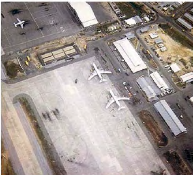
3) Da Nang AB, Terminal area.