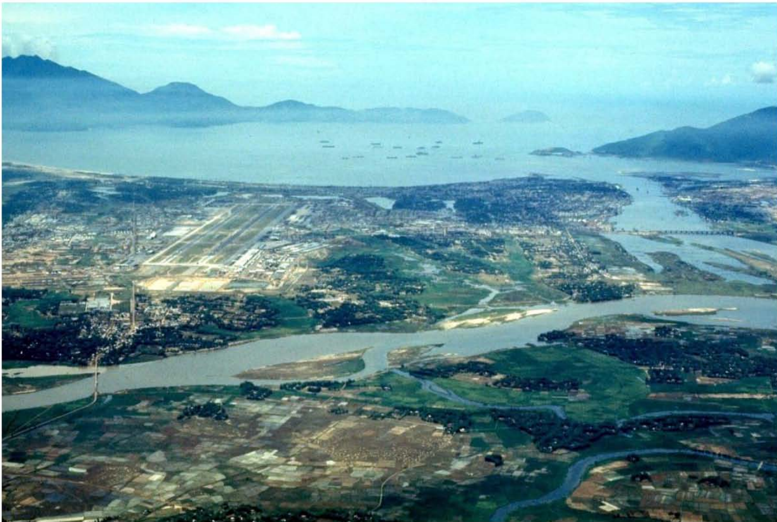
1) Da Nang Airbase. A fleet of ships anchors off shore to the North. To the East, the bridge to China Beach is visible.