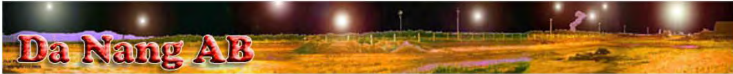
Da Nang Air Base, Aerial Photos