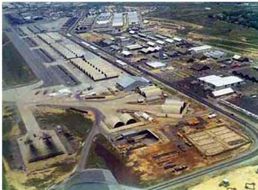
4) S/E end of the runway, Revetment A/C parking in 1966, and hanged by 1970.