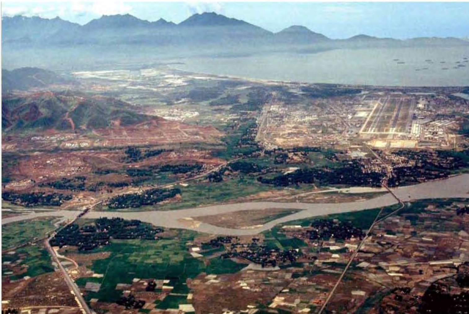
6) Da Nang Airbase. Freedom Hill 357, to the West..