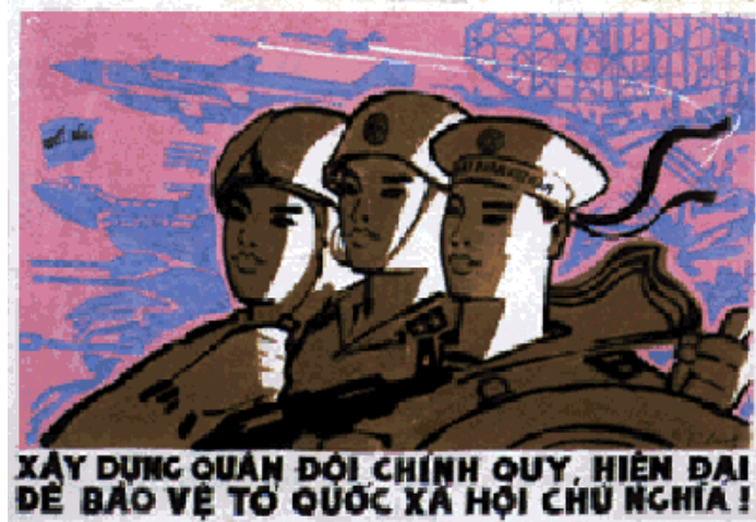
NVA- Build a Regular Modern Army to Protect the Socialist State.