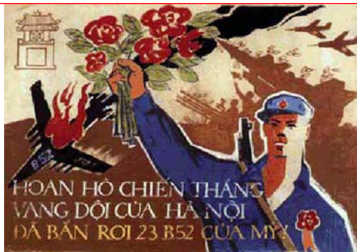
NVA- Bravo for Hanoi's Tremendous Victory When 23 B-52s Were Shot Down.