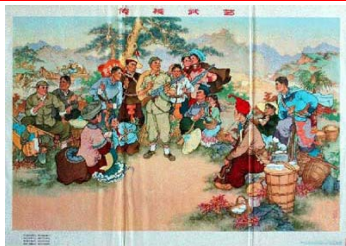
1965 China Instruct others in military skills.