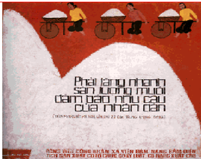
NVA- We Must Increase the Production of Salt to Satisfy the People's Needs.