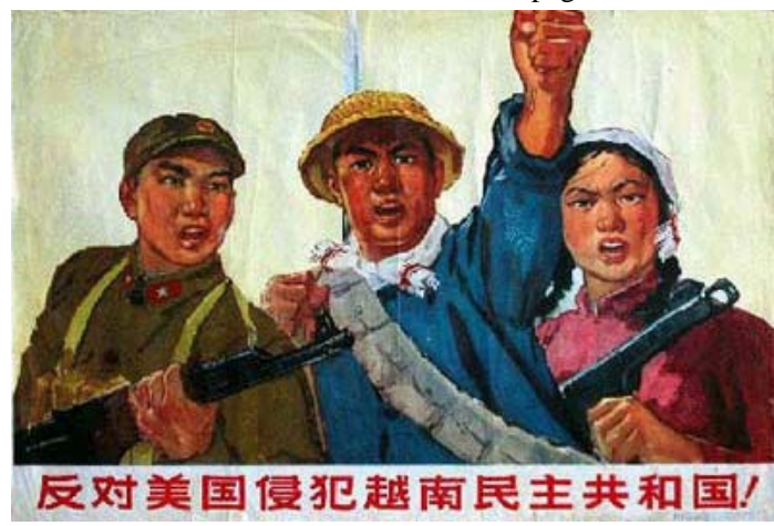
1965 China- Oppose the invasion of the Democratic Republic of Vietnam by the Reactionary Americans.