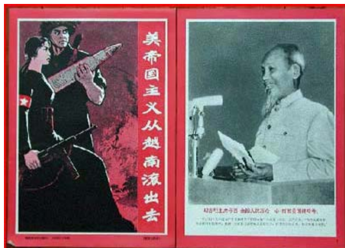
1965 China- Anti-American Vietnam Propaganda Posters-1.

Page-1 • Page-2 • Page-3 • Page-4 • Page-5 • Page-6 • VSPA • War-Stories