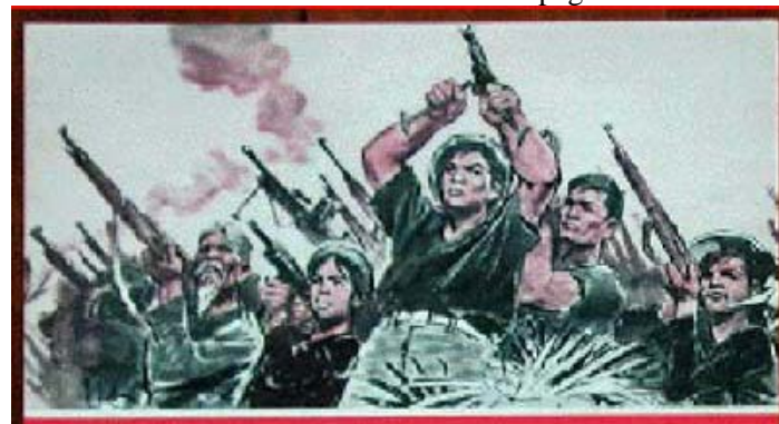
1965 China- Anti-American Vietnam Propaganda Posters-4.