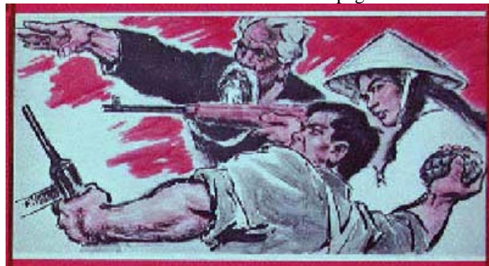
1965 China- Anti-American Vietnam Propaganda Posters-3.