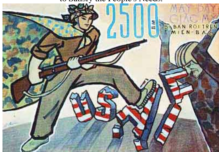
SVN- USA onder de laars van Vietnam.