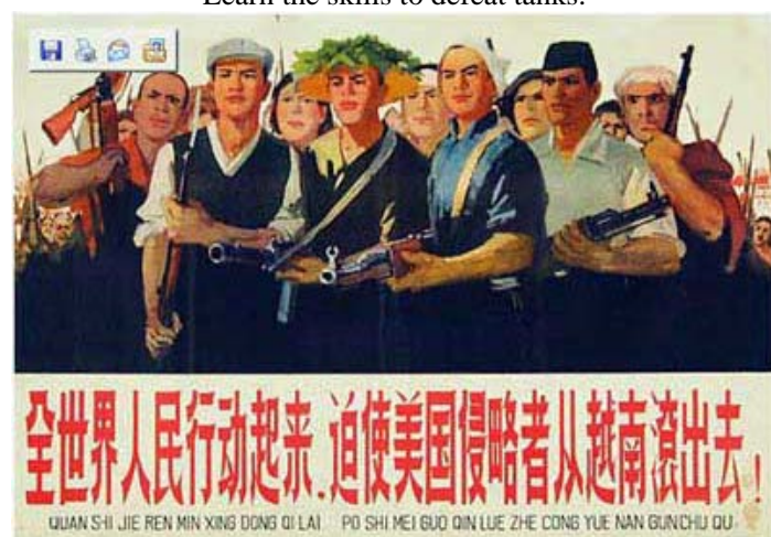
China Kom overal ter wereld in actie - dwing de Amerikanen uit Vietnam.