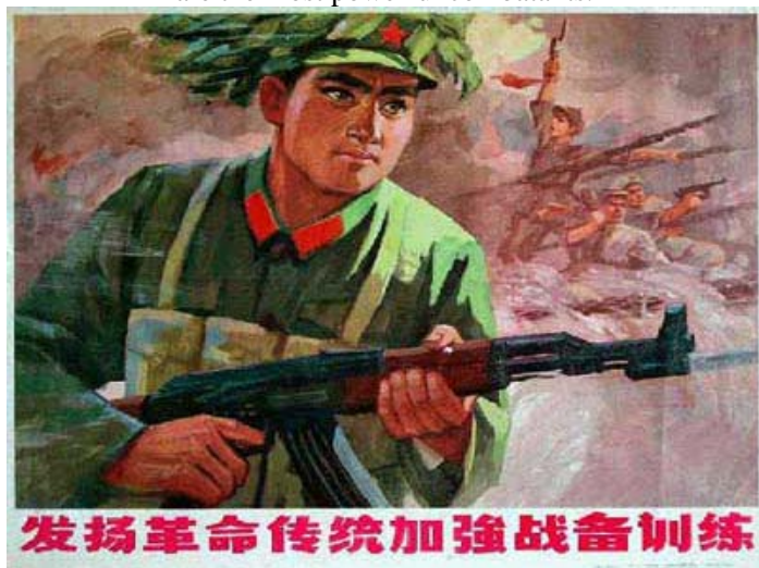
1975 China- Promote Revolutionary traditions and strengthen war preparation and training.