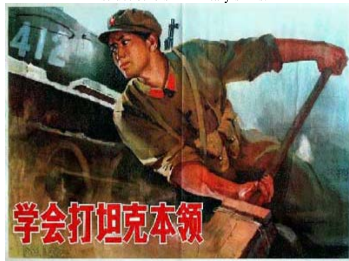
1974 China Learn the skills to defeat tanks.