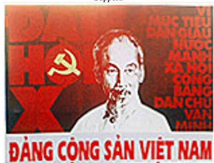
NVA- Political Communist Vietnam.