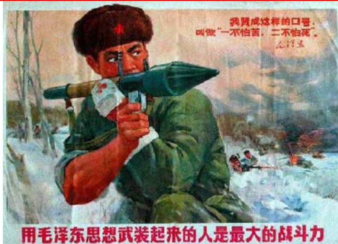
1971 China- Those who are armed with Mao Zedong Thought are the most powerful combatants.