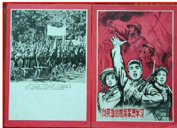
1965 China- Anti-American Vietnam Propaganda Posters-2.