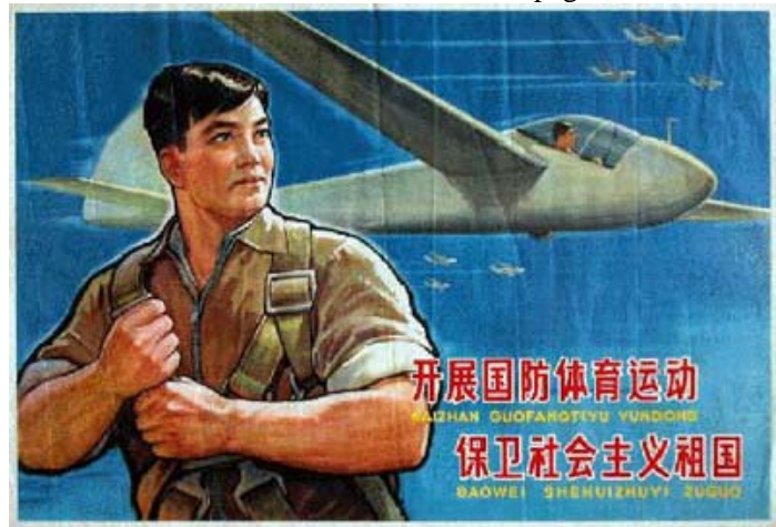
1965 China- Carry out national defense sports activities to protect our Socialist Motherland.