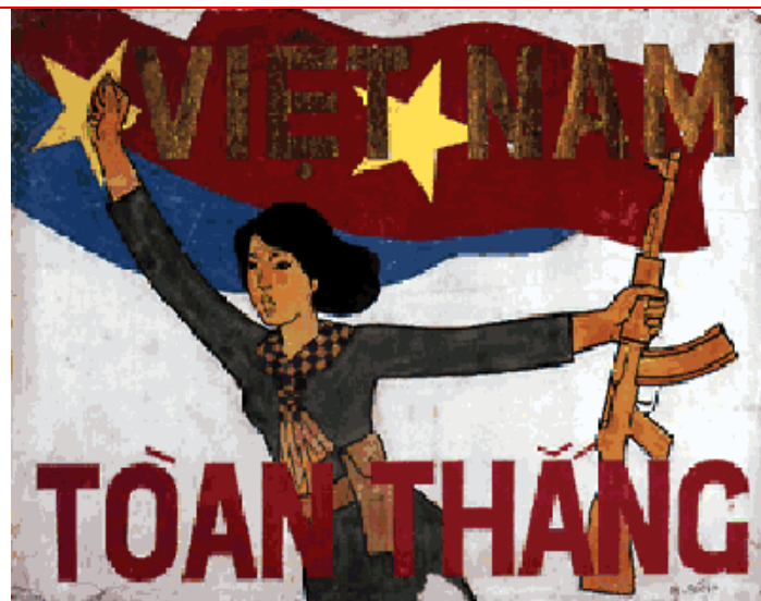
NVA- Vietnam's Ultimate Triumph.