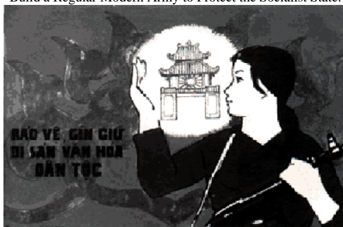
NVA- Protect and Save the Country's Cultural Heritage.