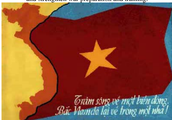
NVA- All Our Rivers Flow Into the Eastern Sea. The North and South United Under One Roof.