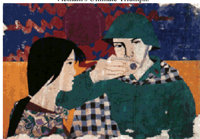
NVA- Woman Giving Soldier Cup of Tea, Demonstrating Civilian Support to the Army.

Page-1 • Page-2 • Page-3 • Page-4 • Page-5 • Page-6 • VSPA • War-Stories