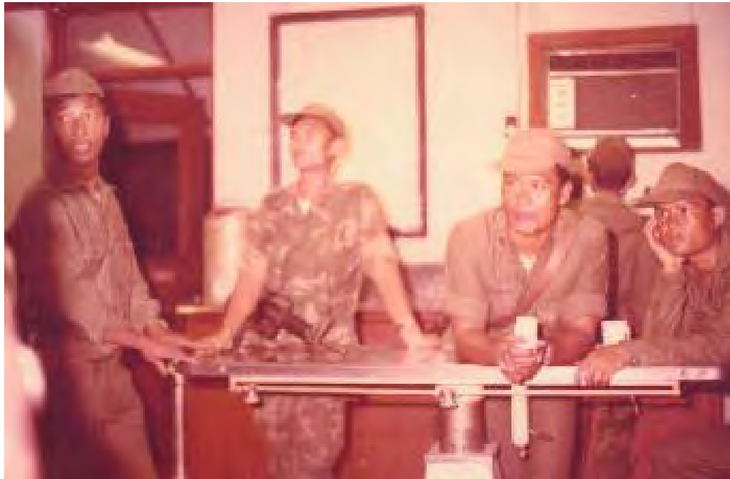
11) Thai K-9 inside Kennel building.