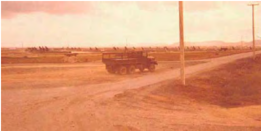
2) K-9 truck leaving kennels... B-52 tails from their revetments off runway.