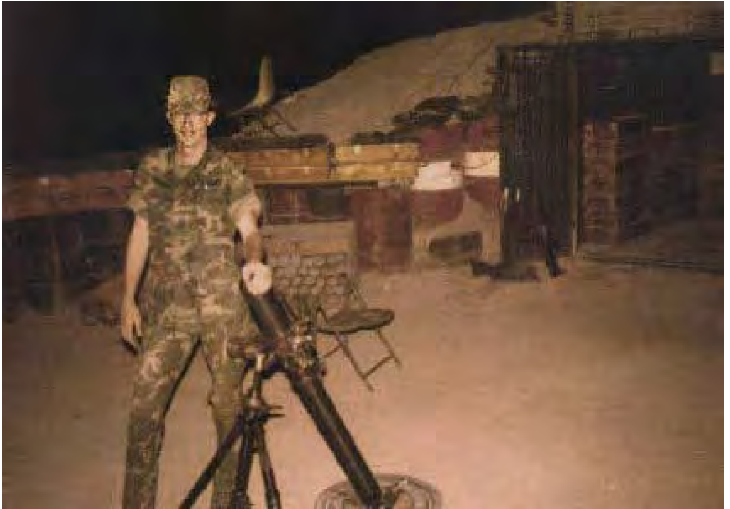
17) Wagner, mortar pit.