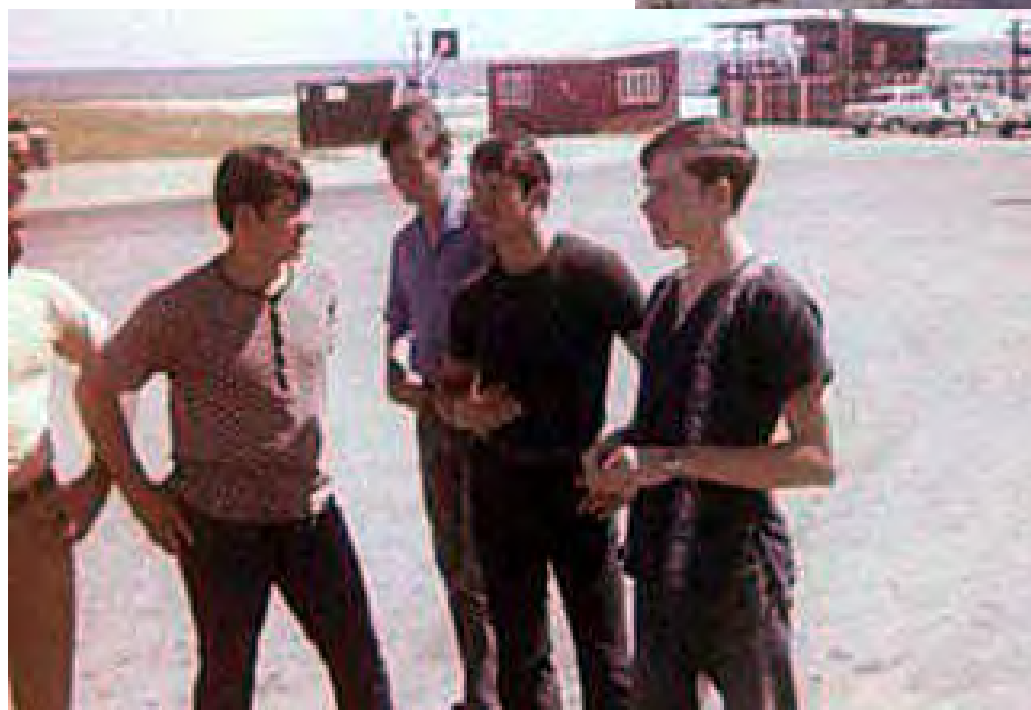
16) K-9 man R&R: A few of the other handlers I lived and worked with.