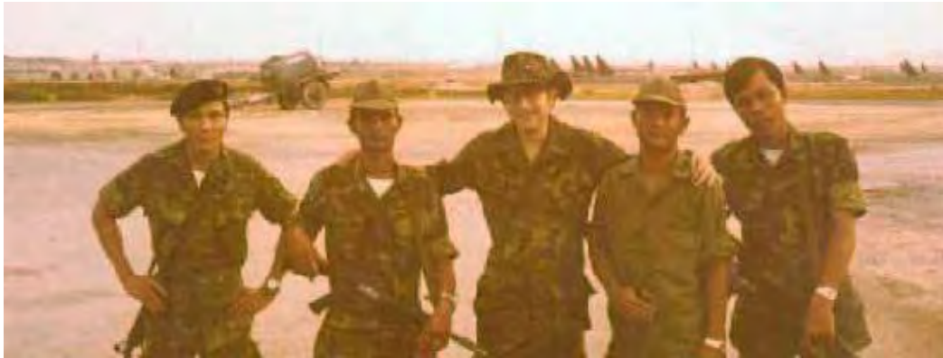
5) Burpee with Thai K-9: Thai on right pulled weapon on GI's at Kennels one night, had a strange confrontation with Thais/GI's defused situation and the Thai was booted out of K-9.