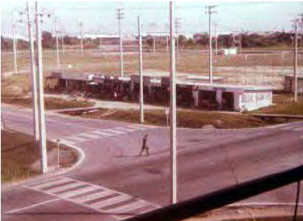
7) Most everyone will recall the little Thai shops on base. Photo was taken from my room.