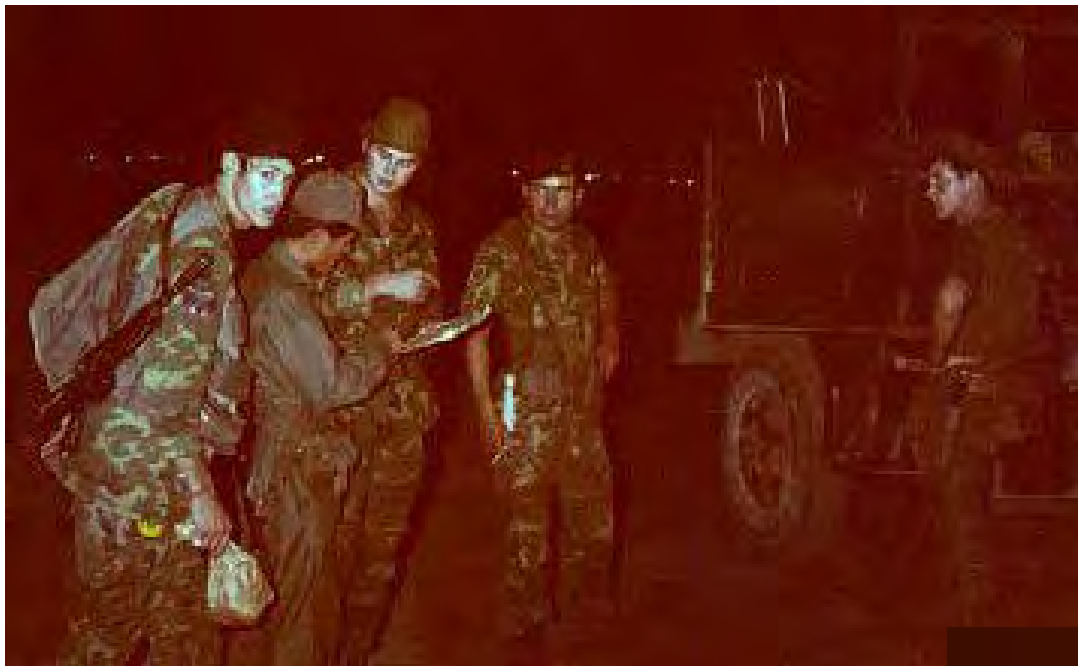
11. Quick Response Team, assembling.