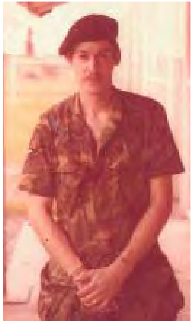
13) Close Up.