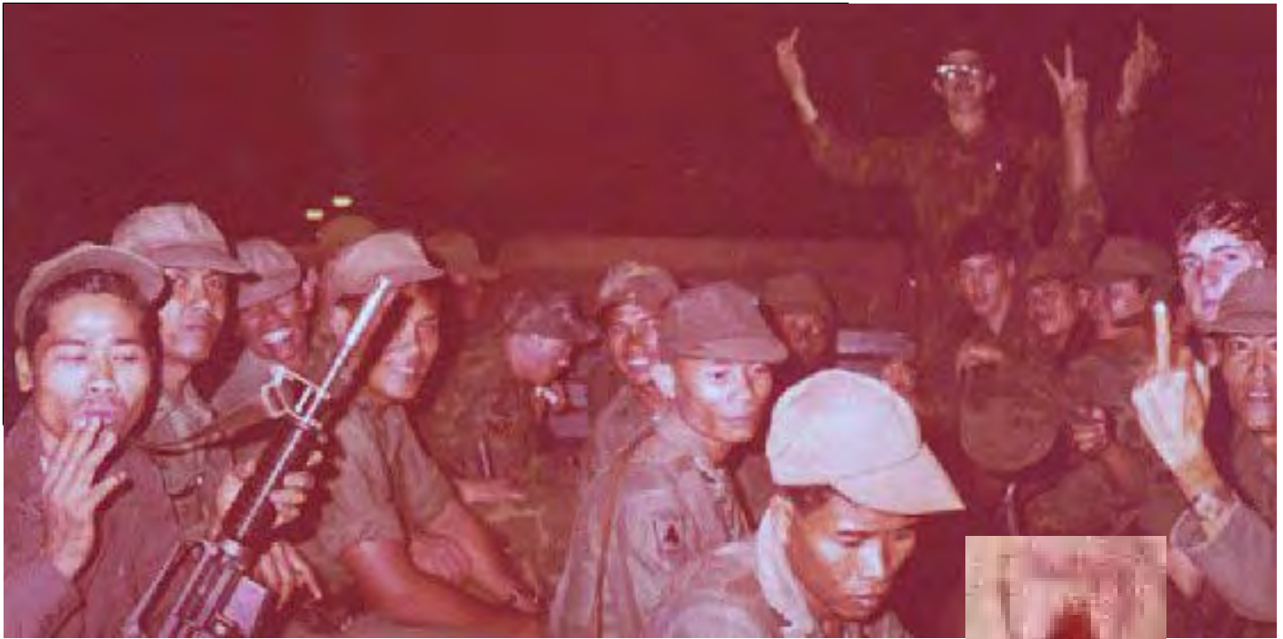
5) K-9 Handlers ready to post. Note the K-9 Patch on the Thai's shoulder.