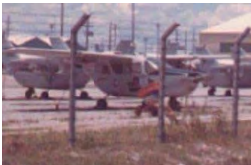
16) Light Aircraft... C-??