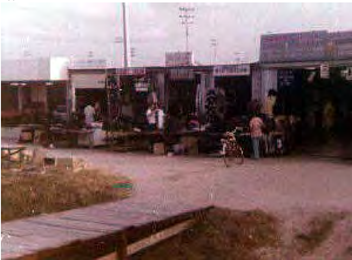
8) Down the street from shops. Note the baseball field in behind the shops, many good games where played there.