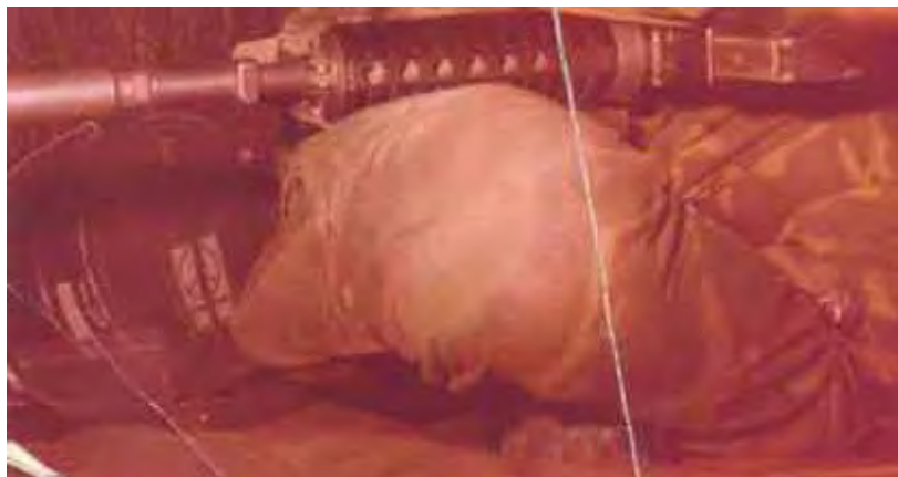
3) K-9 dog food bucket, gau. Note the Peace-Sign inside!