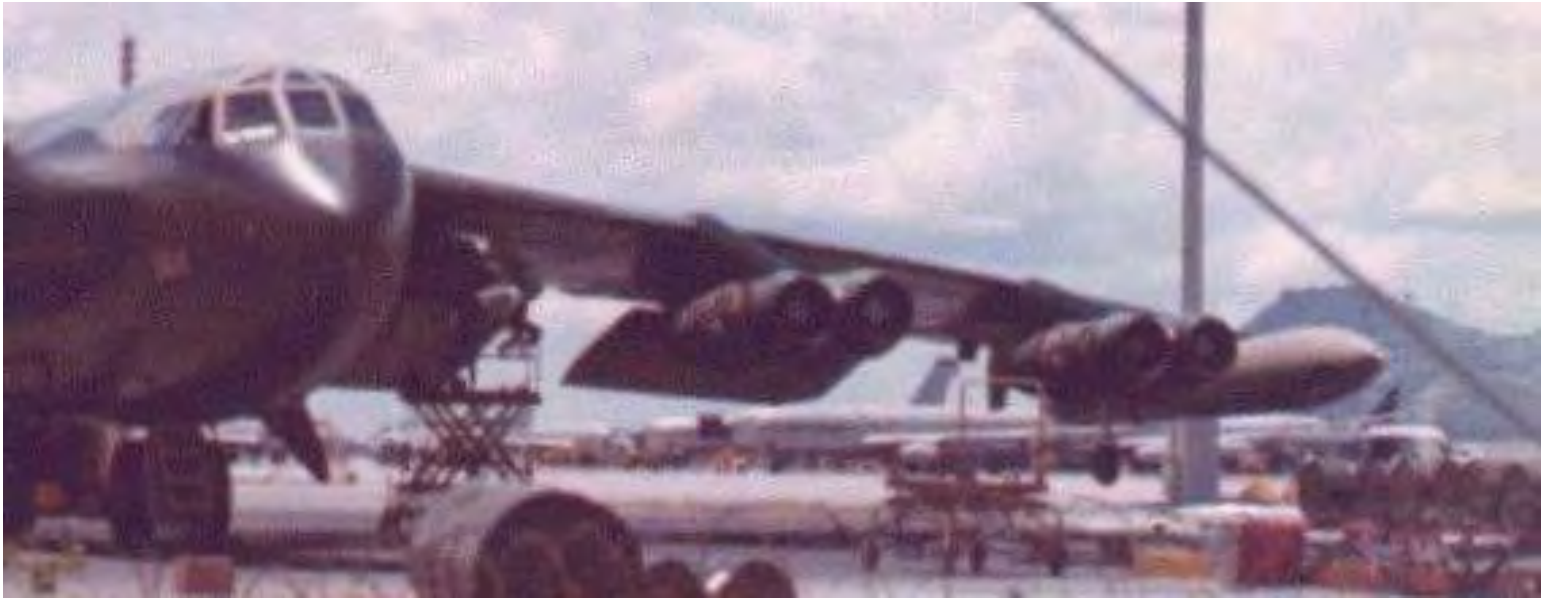
1) U-Tapao B-52... (Tail is six stories tall!). Look Closer! KC-135's tankers tucked under wing.