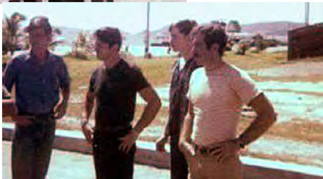
17) This was some free time we had together.