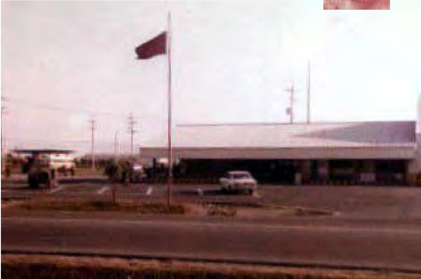
6) Mail Call is where we all went to collect our mail when the red flag was lifted.