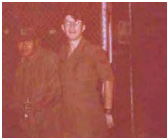
7) Burpee and Thai K-9. Note where Thai's weapon is pointed!