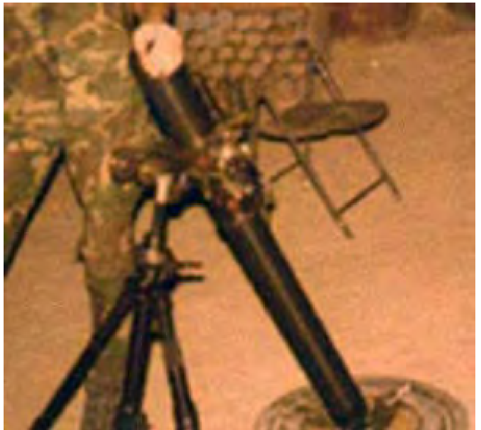
18) Wagner, mortar pit. 81mm.