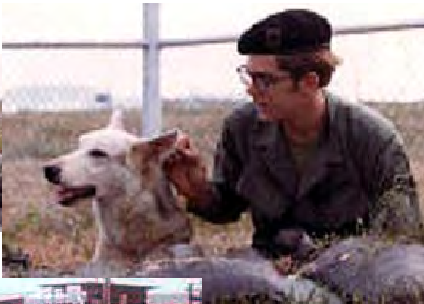
15)... but not their memory.