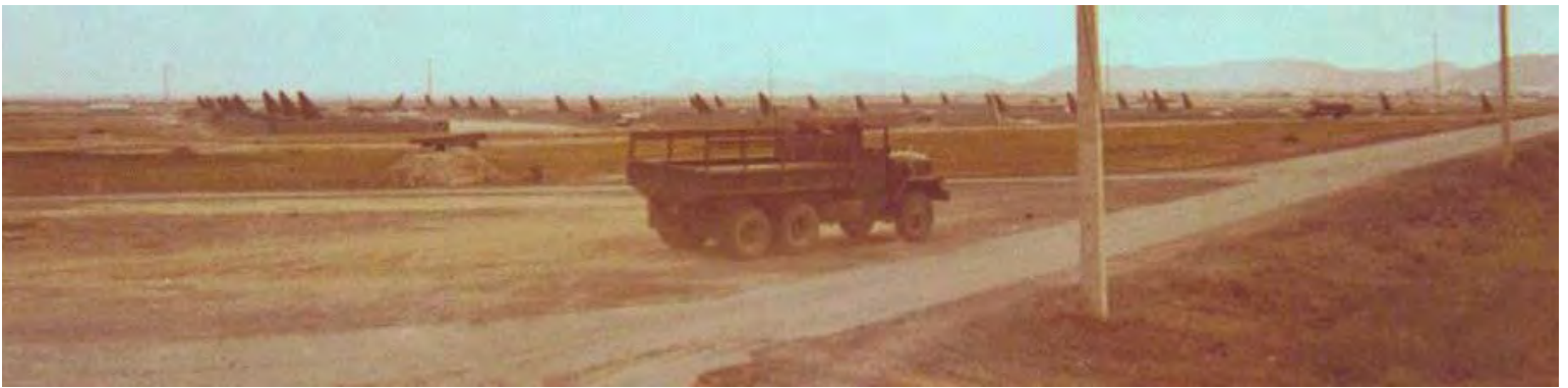
3) B-52 Revetments. 635th SPS truck heading back from posting troops. Day time Panorama photo.