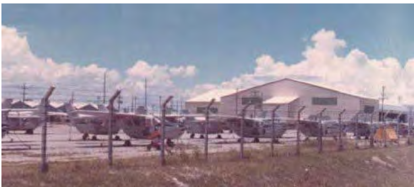
15) Light Aircraft parking ramp... C-?? [These are Cessna O-2 Skymasters, flown by various FAC Squadrons. My guess is that they were at U-Tapao being stored until they could be shipped to the U.S.. Ed Mann