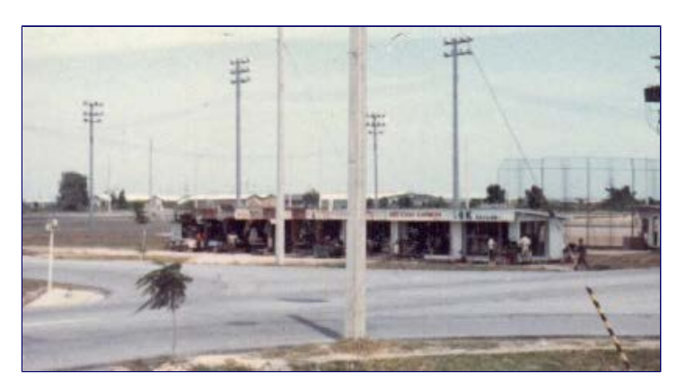
7) Picture of the baseball field across from the barracks, it also had a few concessions there where you get jackets and caps made to order.