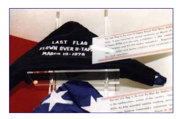
Go To Page-3

8) From the AF museum. These are the last U.S. flags to fly over U-Tapao RTAFB.