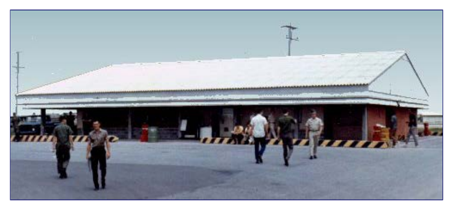
6) U-Tapao Mail Room!