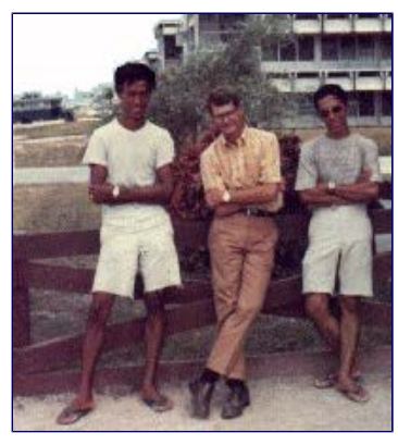
5) An SP standing with our two houseboys at the SP barracks. I can't remember any names... except the barracks number was 2051.