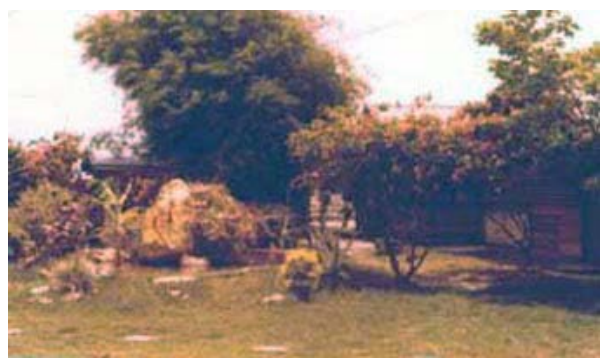
23) Hootch garden area.