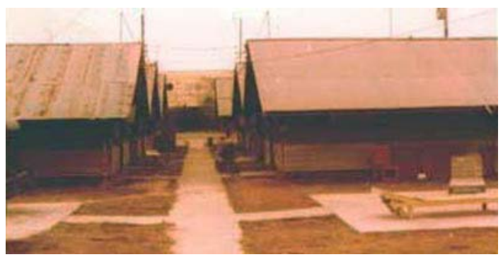
21) SPS Hootch area.