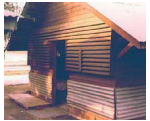
24) Entrance door to My Hootch.