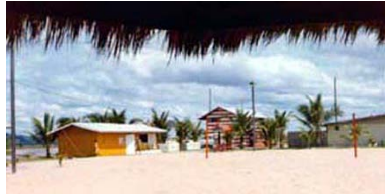
28) U-Tapao Beach House.