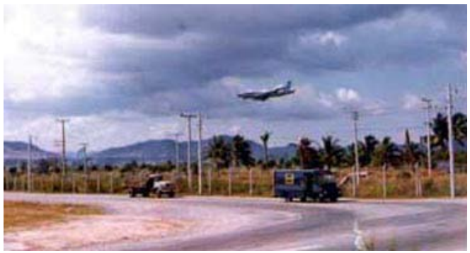
19) Close up off C141 Transport.