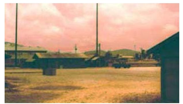
20) Believe this is the SPS Armory.