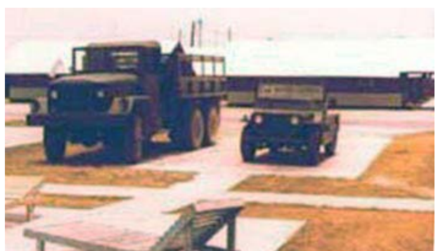
26) My jeep and the 1 ½ ton posting truck at hootches (in for lunch from kennels).