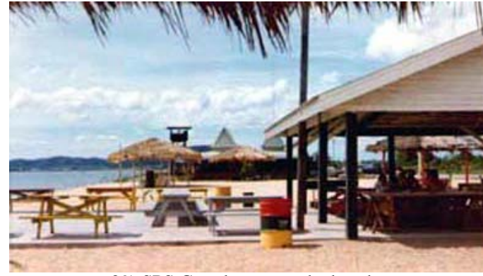
29) SPS Guard tower at the beach.