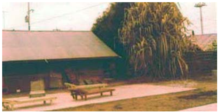
22) My Hootch.