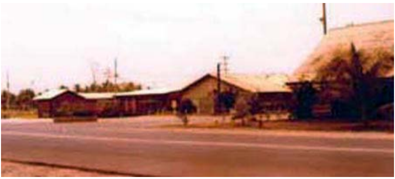
27) Base Beer Bar.