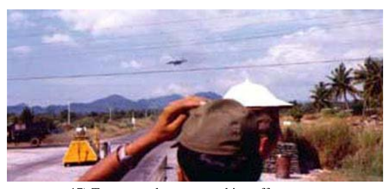
17) Transport plane approaching off east gate (Off to the right behind palm trees is the area that the B-52 crashed we all wrote about)