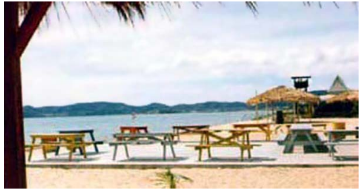
30). Different photo with tower in background.