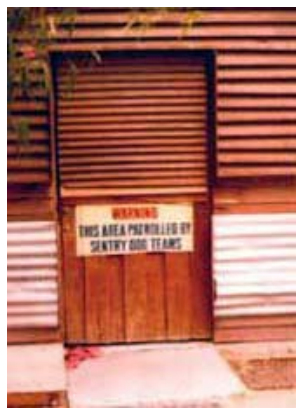
25) Sentry Sign I kept posted on My Door.