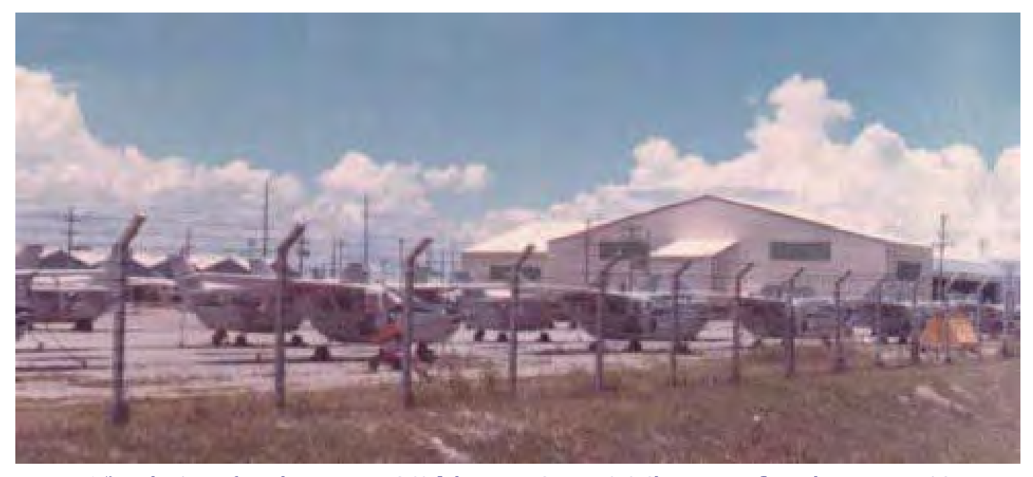
15) Light Aircraft parking ramp... C-?? [These are Cessna O-2 Skymasters, flown by various FAC Squadrons. My guess is that they were at U-Tapao being stored until they could be shipped to the U.S.. Ed Mann