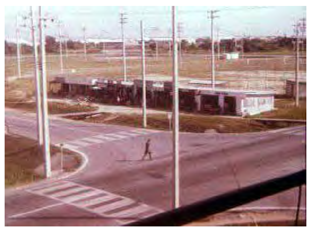
7) Most everyone will recall the little Thai shops on base. Photo was taken from my room.