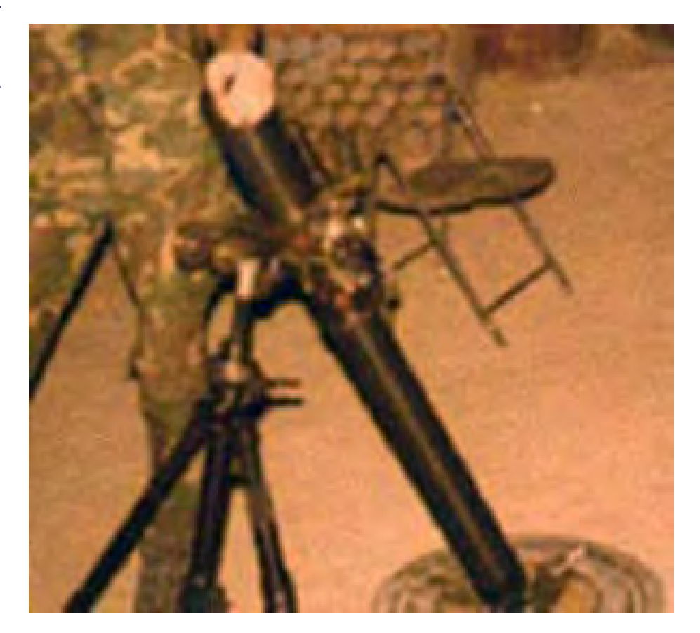
Page 6 of 11