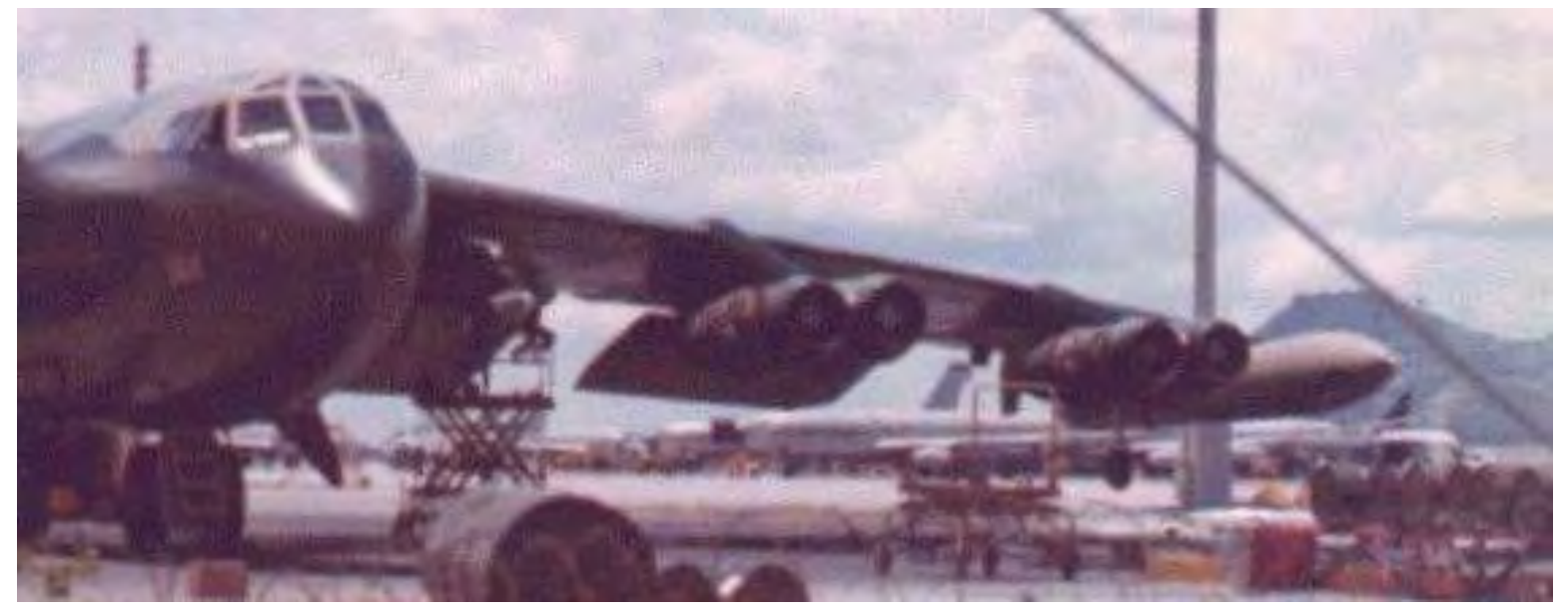
1) U-Tapao B-52... (Tail is six stories tall!). Look Closer! KC-135's tankers tucked under wing.