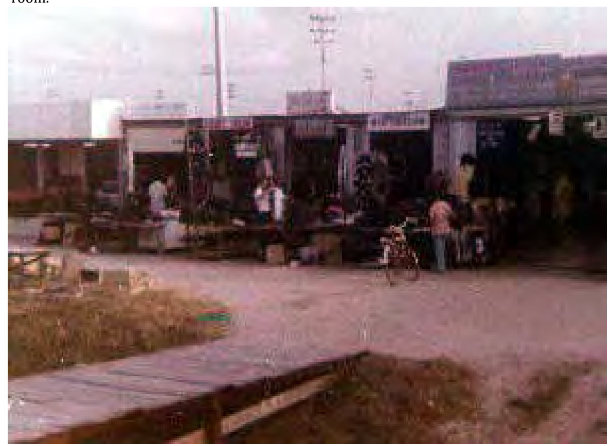
8) Down the street from shops. Note the baseball field in behind the shops, many good games where played there.