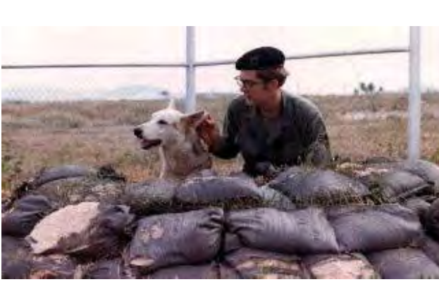
15)... but not their memory.