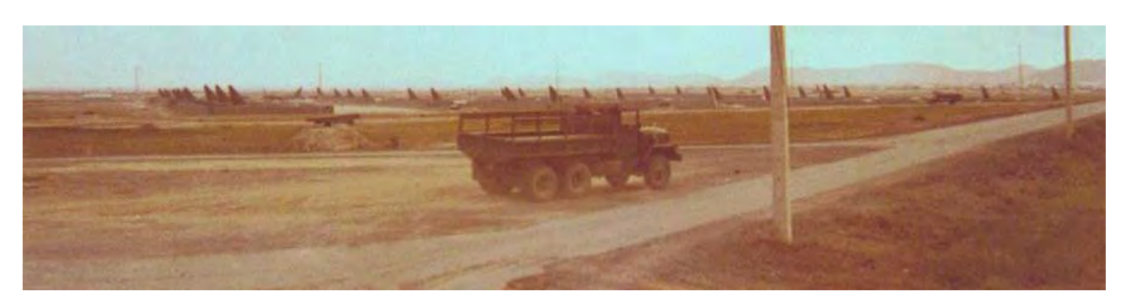
3) B-52 Revetments. 635th SPS truck heading back from posting troops. Day time Panorama photo.