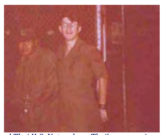
7) Burpee and Thai K-9. Note where Thai's weapon is pointed!