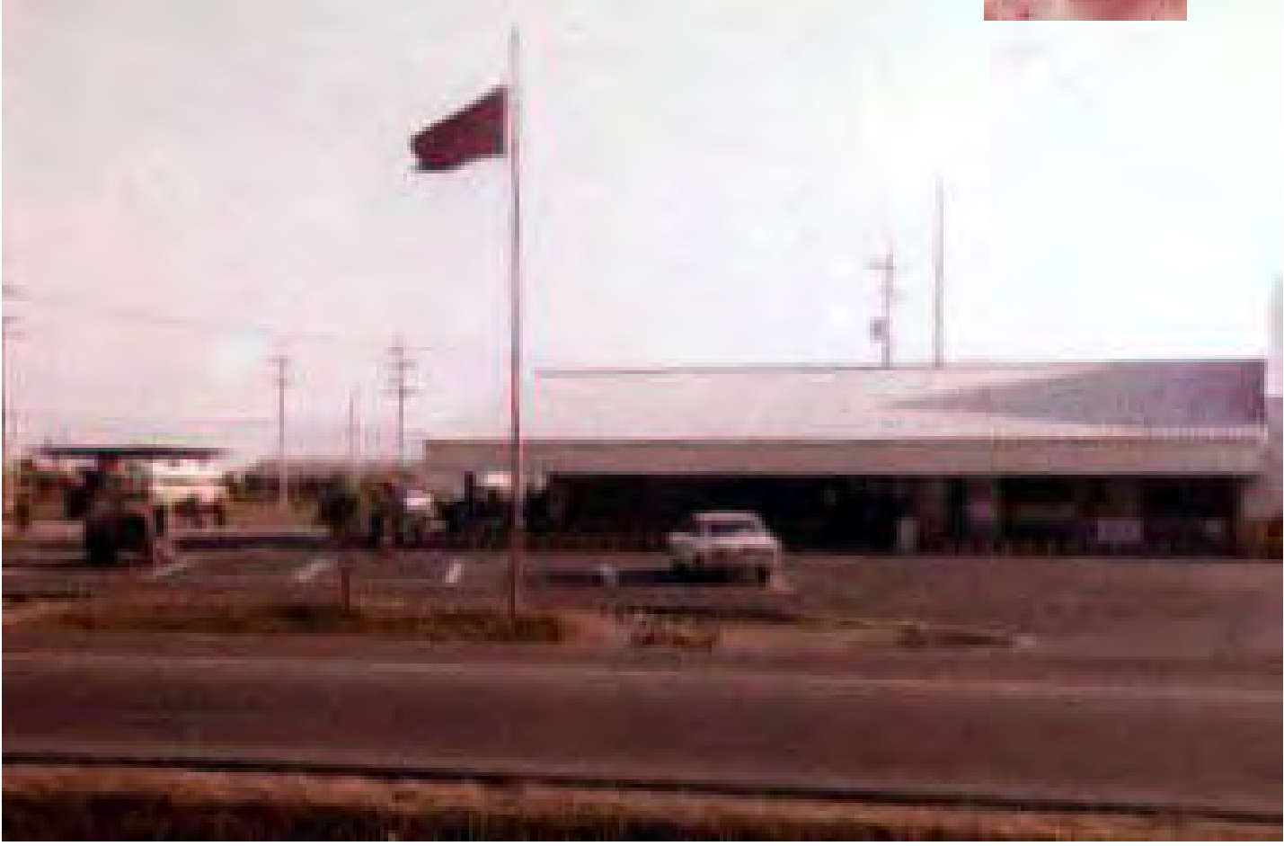
\, 6) Mail Call is where we all went to collect our mail when the red flag was lifted.