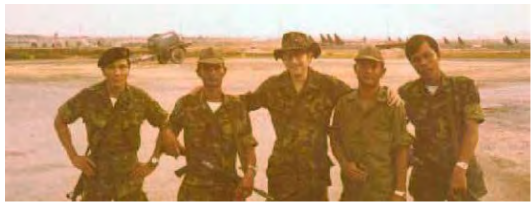
5) Burpee with Thai K-9: Thai on right pulled weapon on GI's at Kennels one night, had a strange confrontation with Thais/GI's defused situation and the Thai was booted out of K-9.