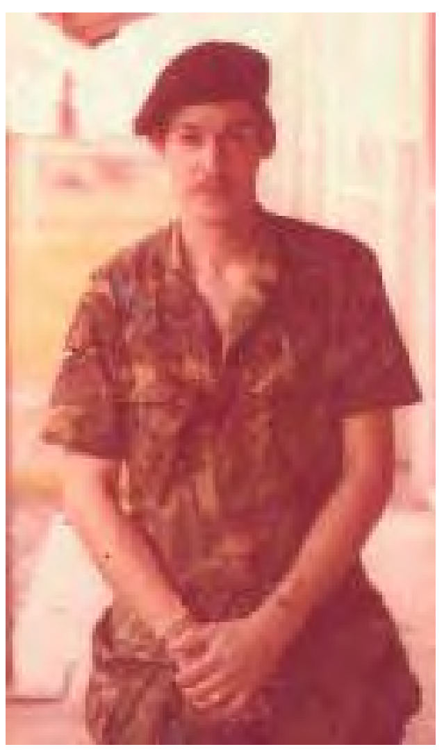
13) Close Up.