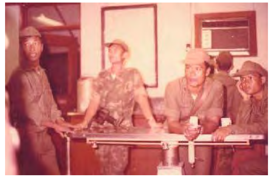
11) Thai K-9 inside Kennel building.