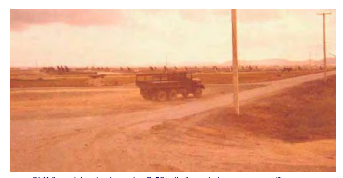
2) K-9 truck leaving kennels... B-52 tails from their revetments off runway.