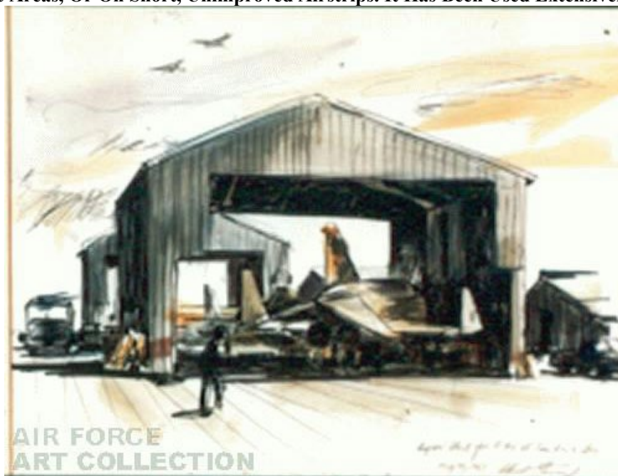
Repair Shed for F-4s at Phu Cat, 1967

Wrote The Artists: This Was Painted From Sketches. Since This Was In Late August 1967, It Was The Beginning Of The Monsoon Season Which Det-s For The Dramatic Sky Effect. The Repair Gear Gathered At The Field Made Such An Interesting Subject. The Twin-Engine Caribou Is An All-Weather Utility Transport. Its Short Takeoff And Landing (Stol) Characteristics Make It Suitable For Airlift In Forward Battle Areas, Or On Short, Unimproved Airstrips. It Has Been Used Extensively In Southeast Asia.