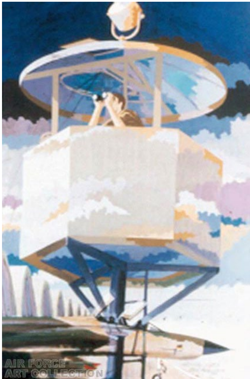
Missile Watch at Biên Hòa, 1969 Artist: Leo Monahan