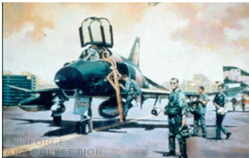
RF-4C at Udorn RTAFB, 1969