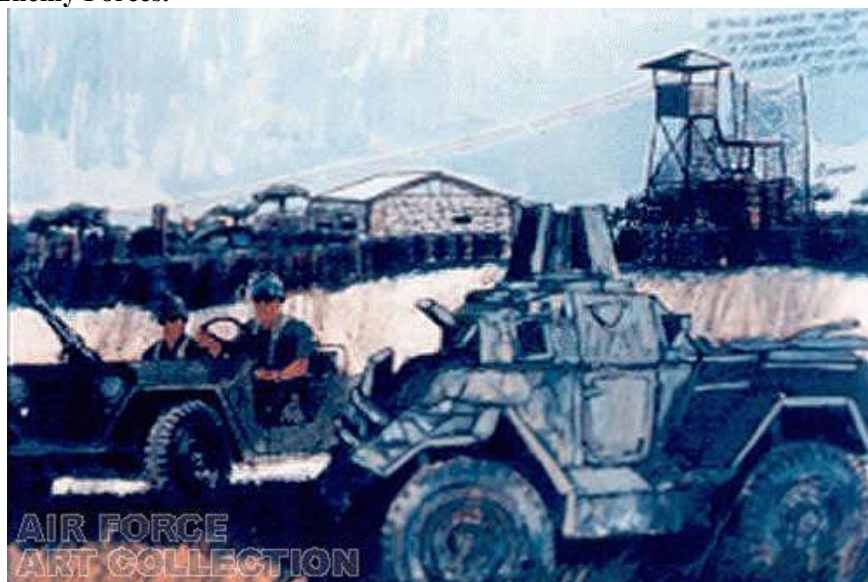
Air Police at Biên Hòa