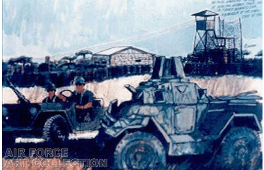
Air Police at Biên Hòa