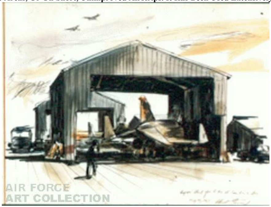
Repair Shed for F-4s at Phu Cat, 1967

Wrote The Artists: This Was Painted From Sketches. Since This Was In Late August 1967, It Was The Beginning Of The Monsoon Season Which Det-s For The Dramatic Sky Effect. The Repair Gear Gathered At The Field Made Such An Interesting Subject. The Twin-Engine Caribou Is An All-Weather Utility Transport. Its Short Takeoff And Landing (Stol) Characteristics Make It Suitable For Airlift In Forward Battle Areas, Or On Short, Unimproved Airstrips. It Has Been Used Extensively In Southeast Asia.