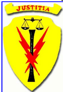
366th Security Police Sq

EMBLEM. 20 May 1985 through 19 June 1988