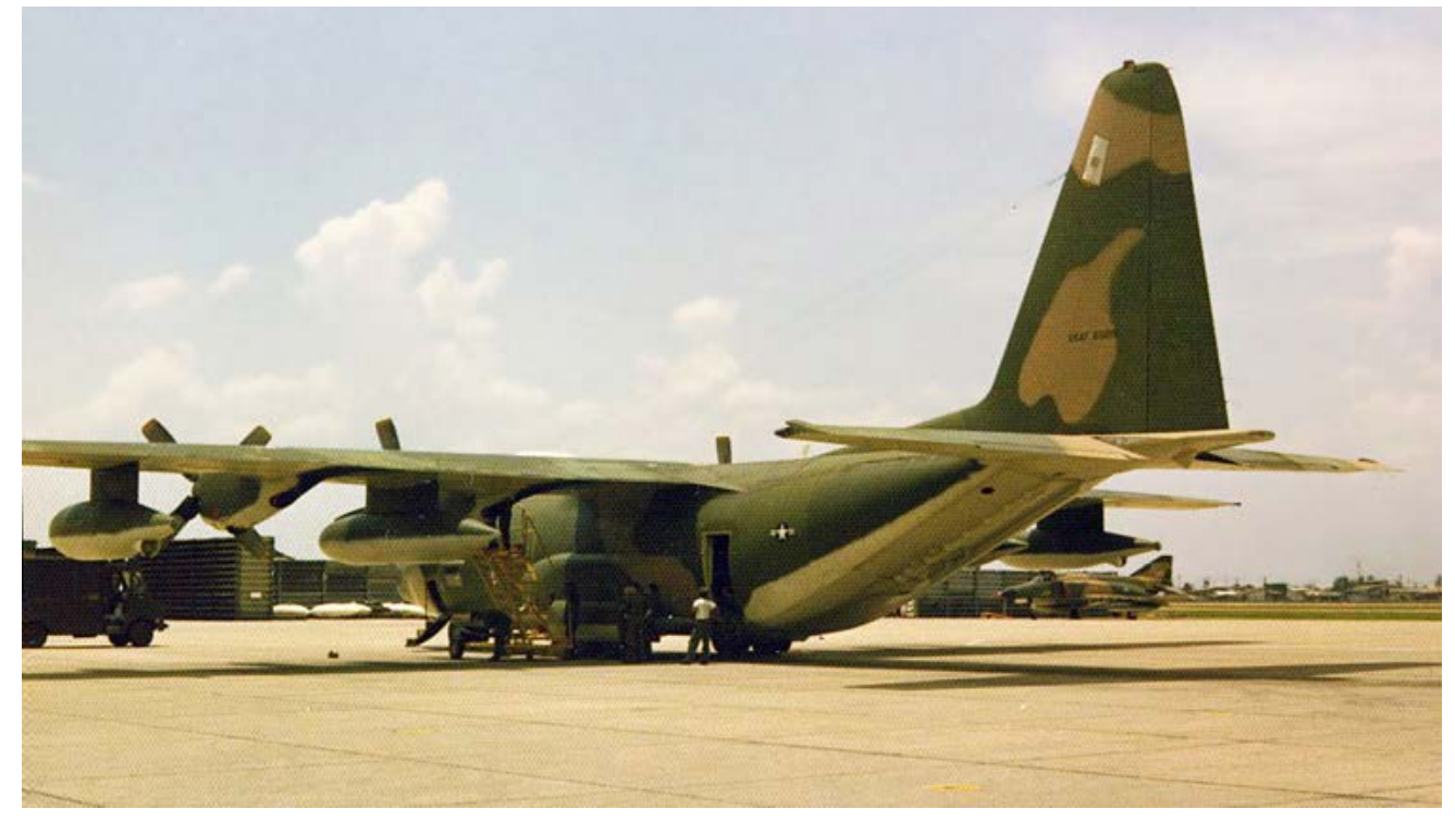
13. C-130 Hercules Spectre Gunship, Home Base NKP.