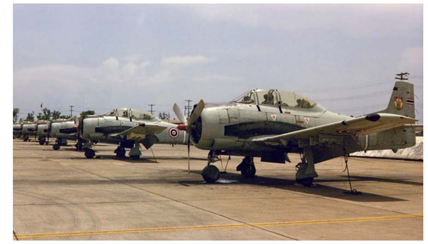
18. T-28's, Thai Air Force.