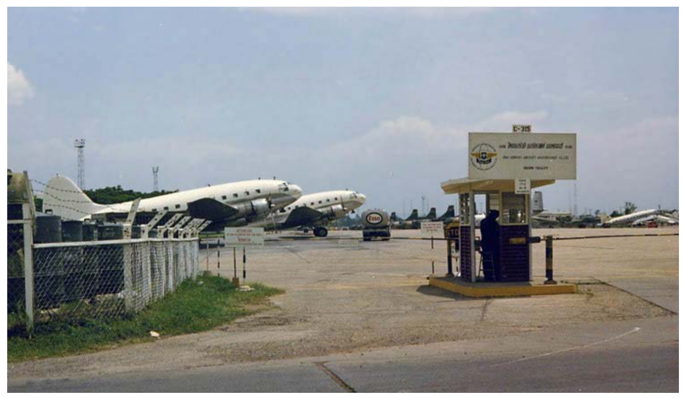
19. "Air America" C-46's and C-123'S Providers.