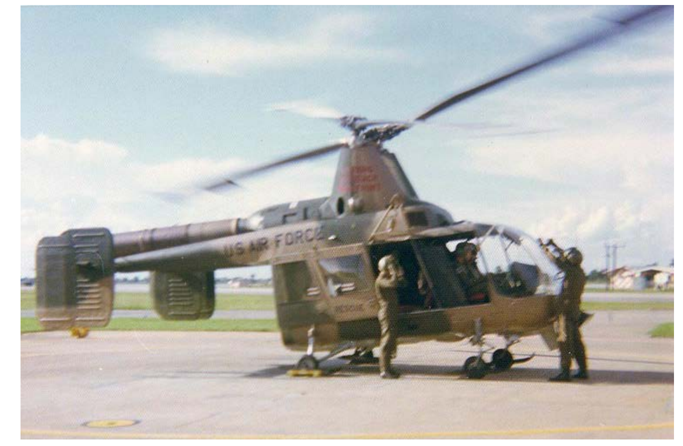
8. HH-43F Huskie Pedro 33, landing. Day Recon Flight.