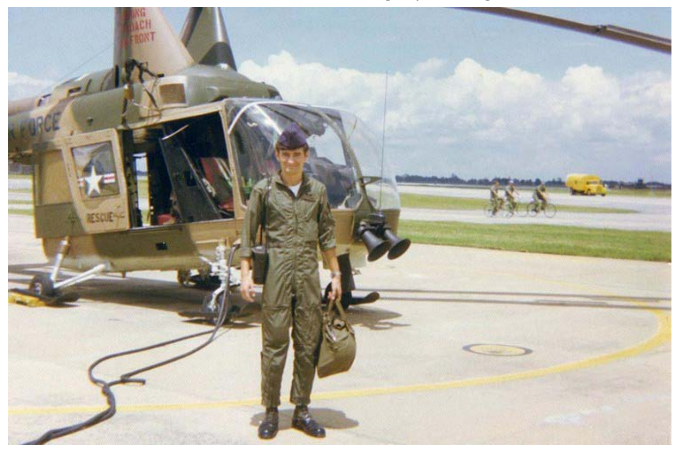
9. Departing Air Reconnaissance Flight, Pedro 34.