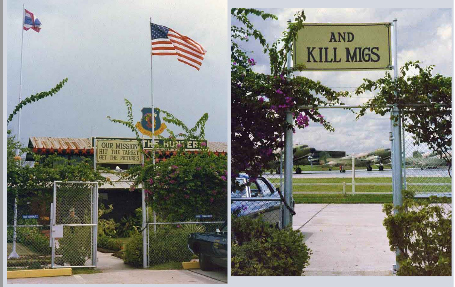
2. Primary Missions: "Hit The Target and Get The Pictures"