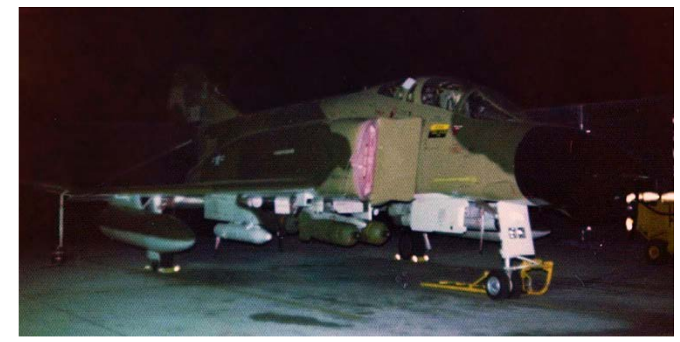
12. F-4D Uploaded and Ready to Hit The Target!