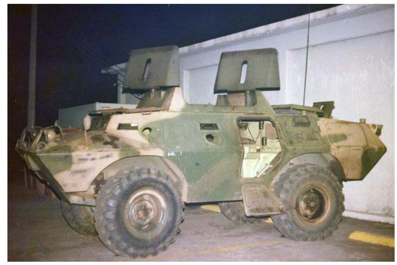
16. M-706 Commando-QRT-Tiger Flight-Quebec 40, at CSC.