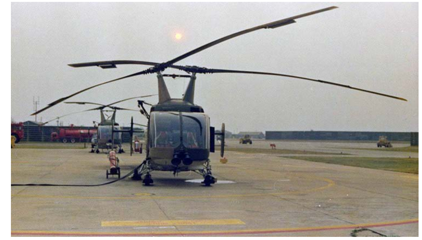
4. HH-43F Huskie, 40th ARRS DET-5, Pedro 33 and Pedro 34.