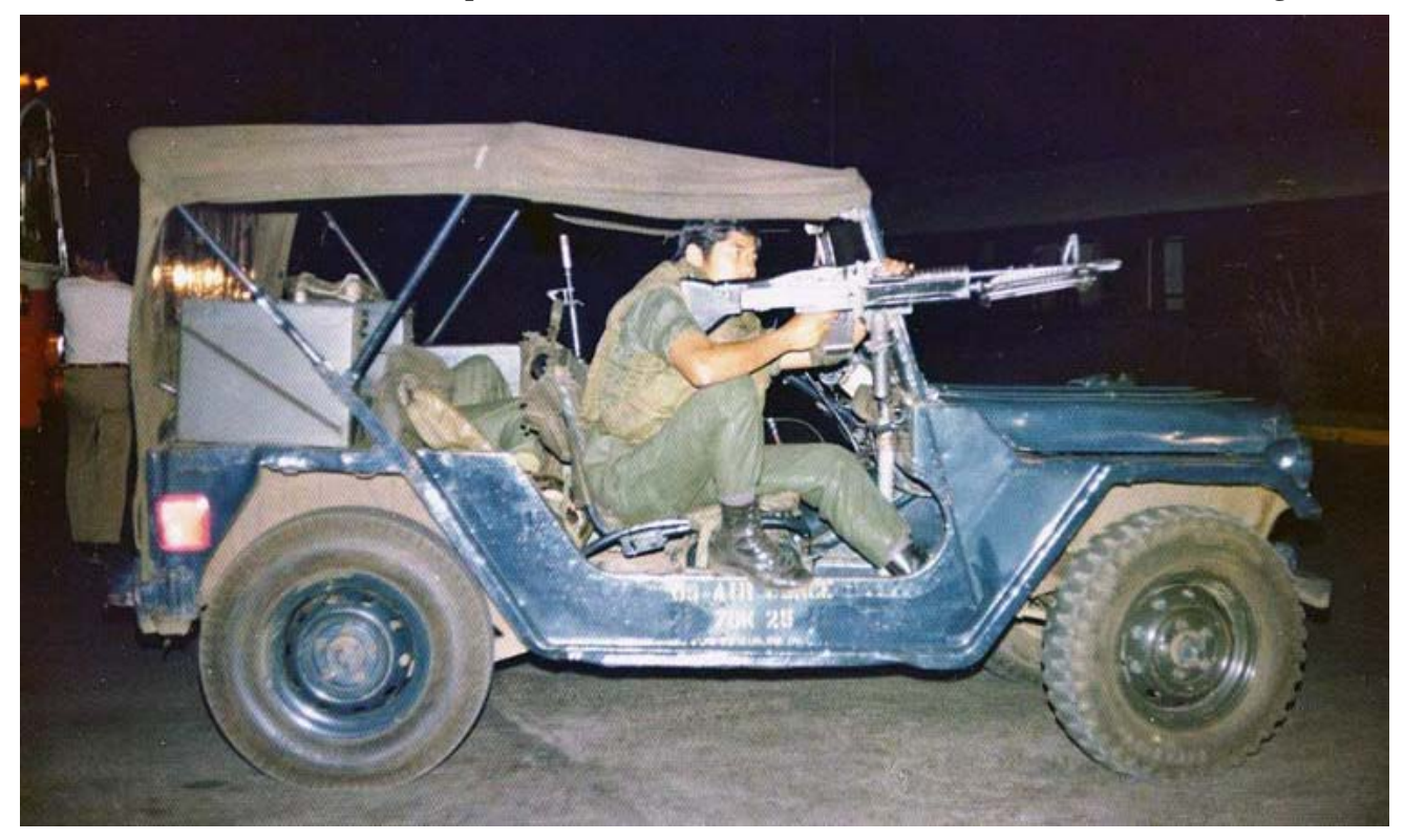
15. M-151 Jeep equipped with M60 Machinegun, Sierra 41.