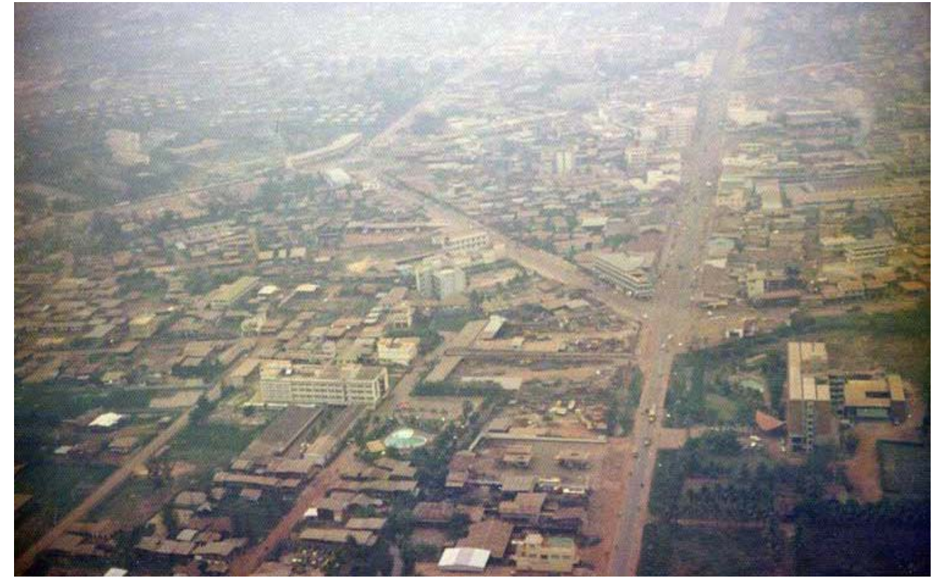
6. Flight over Paradise Hotel, Udorn, Thailand.