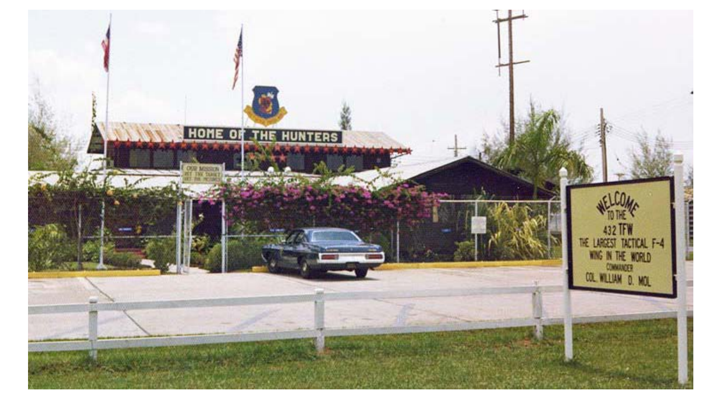
1. 432nd TFW: Largest Tactical Fighter Wing in The World!