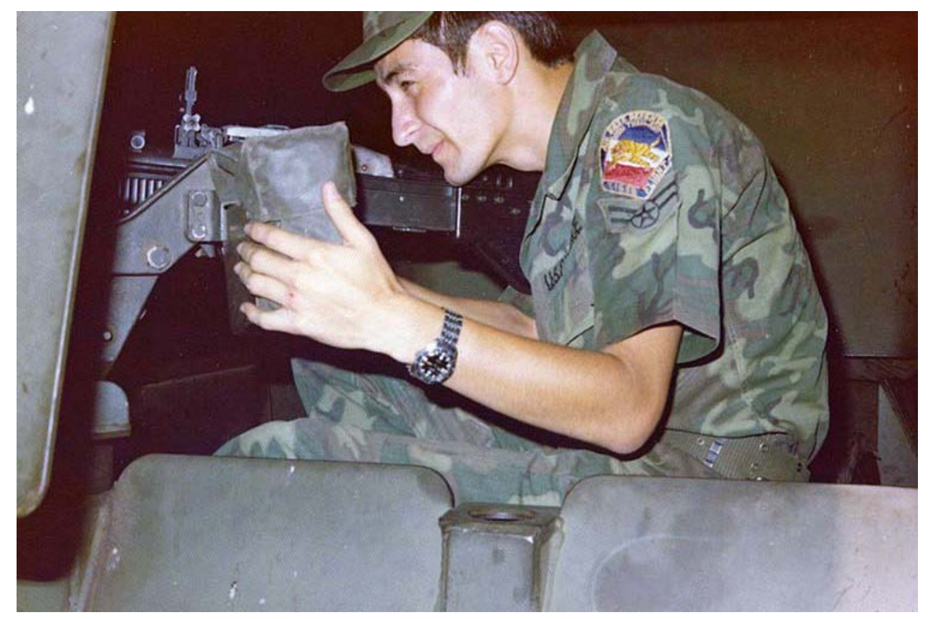
22. M60 Mount on M-706 APC Quebec 40, QRT-Bravo Sector.