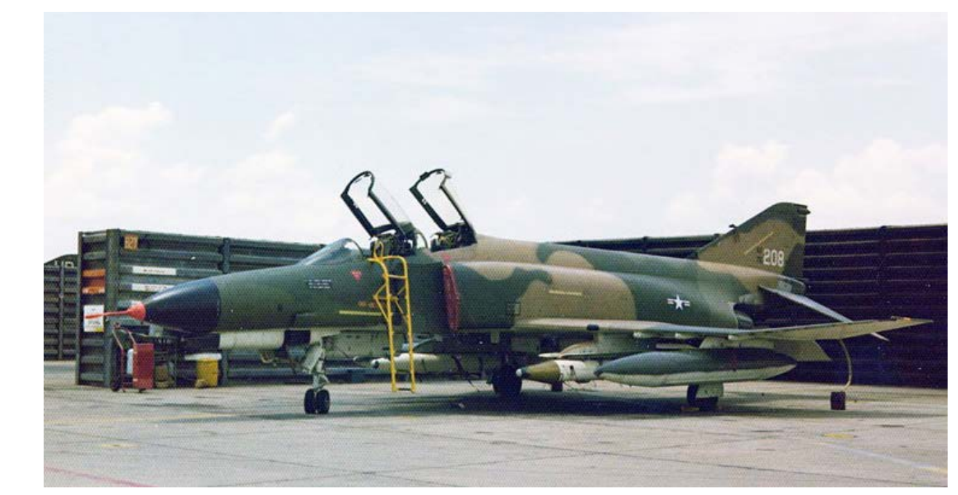
10. F-4E Phantom, Tail Number 72-208.