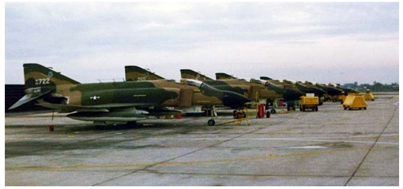
11. F-4D's, Loran Equipped, Bravo Sector, Echo 45.