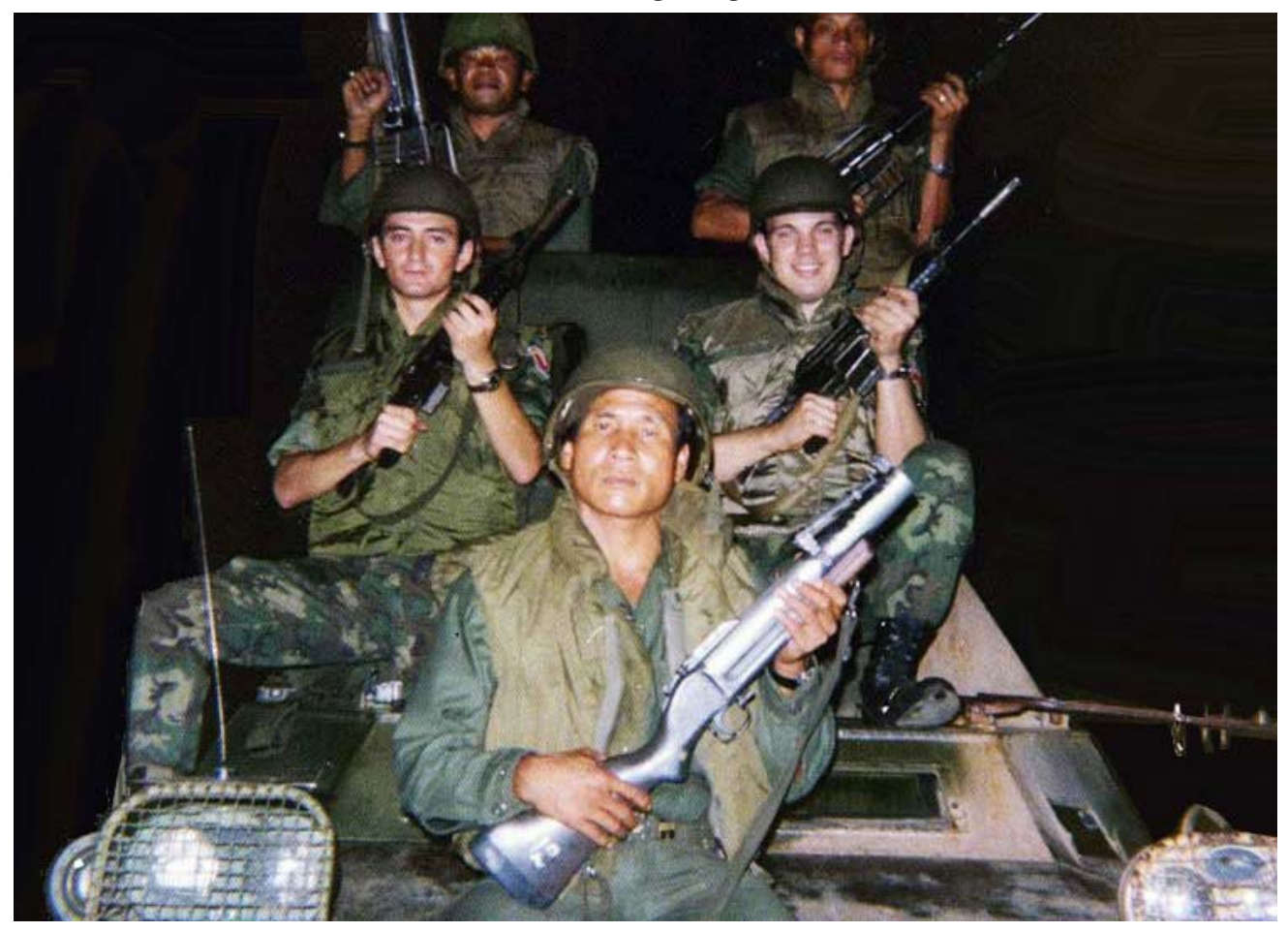
17. M-706 Commando-Tiger Flight-Quebec 40-Bravo Sector.