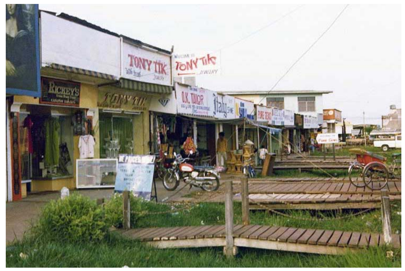
23. Strip Malls outside the Main Gate, Udorn RTAFB, 1975.

NOTE: Aerospace Rescue and Recovery Squadron (ARRS),