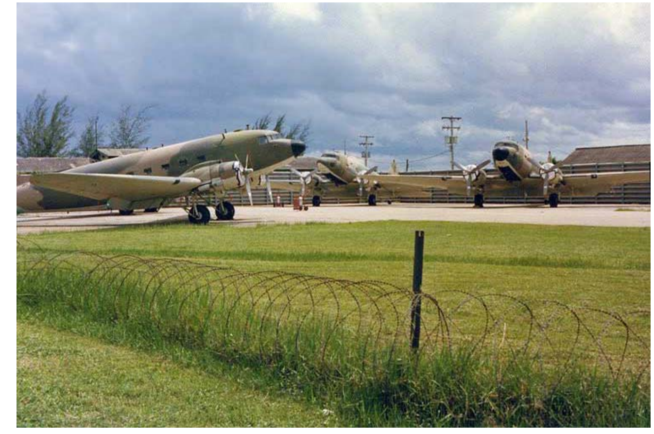
20. EC-47's Bravo Sector.