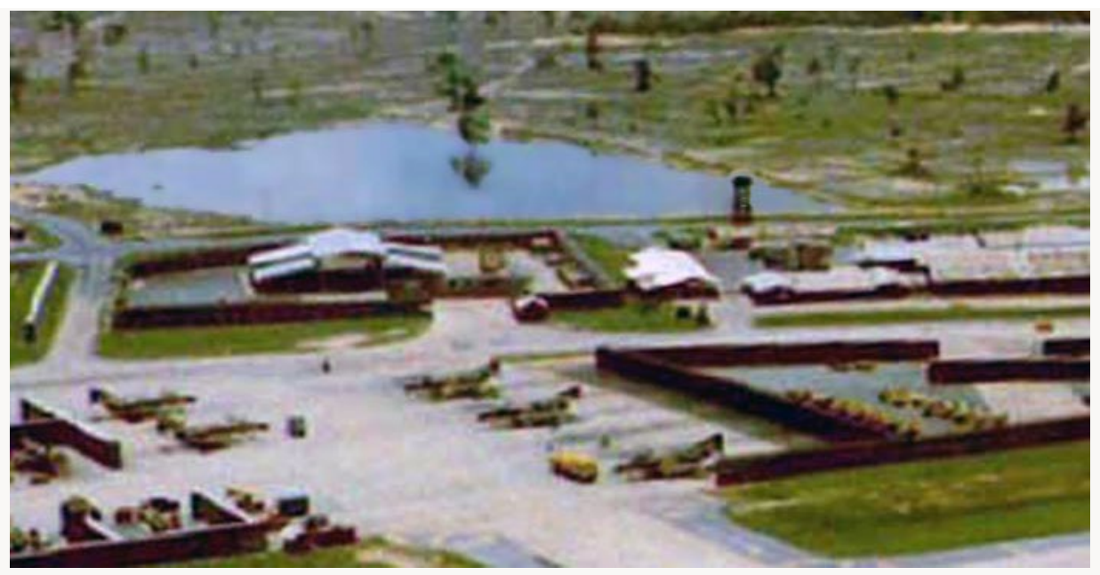
2b. Udorn RTAFB, Close Up, Perimeter Tower.