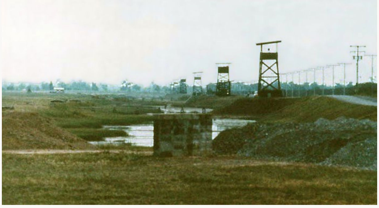
1. Udorn RTAFB, Perimeter Towers.