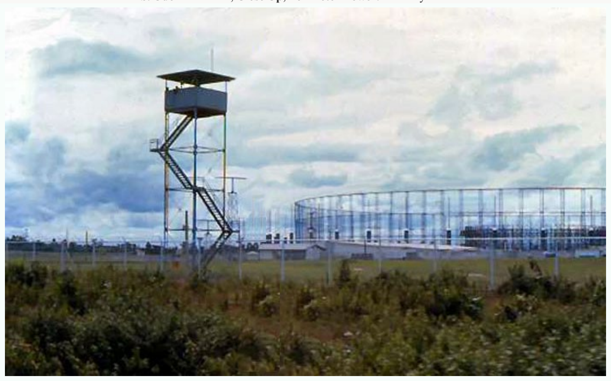
3. Perimeter Tower, with background of Ramasun Station, Thailand, located about 15 kilometers south of Udorn RTAFB. Ramasun Station was an Army Security Agency (ASA) station with about 1,000 men from the ASA, USAF Security Service, and USN Security Group. Antenna Array.