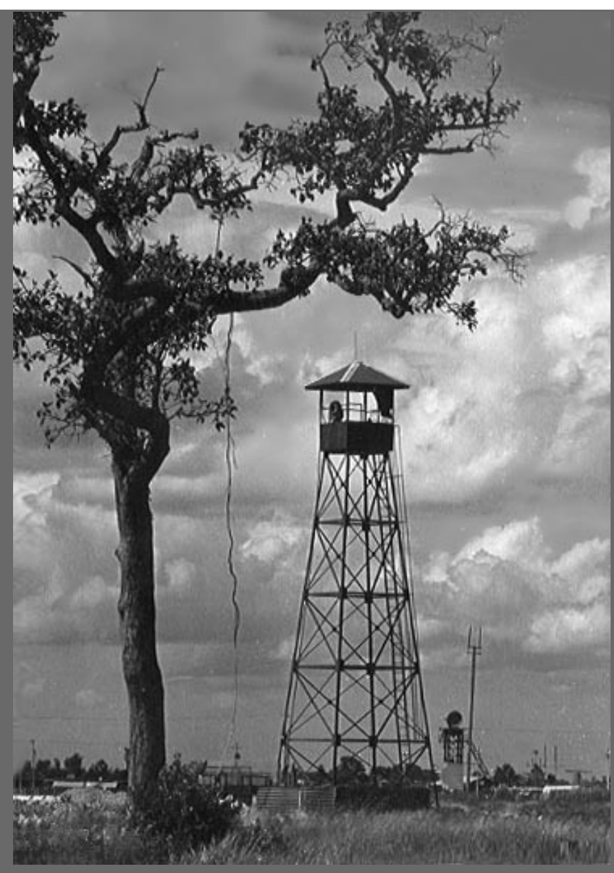
4. Udorn RTAFB, Perimeter Tower.