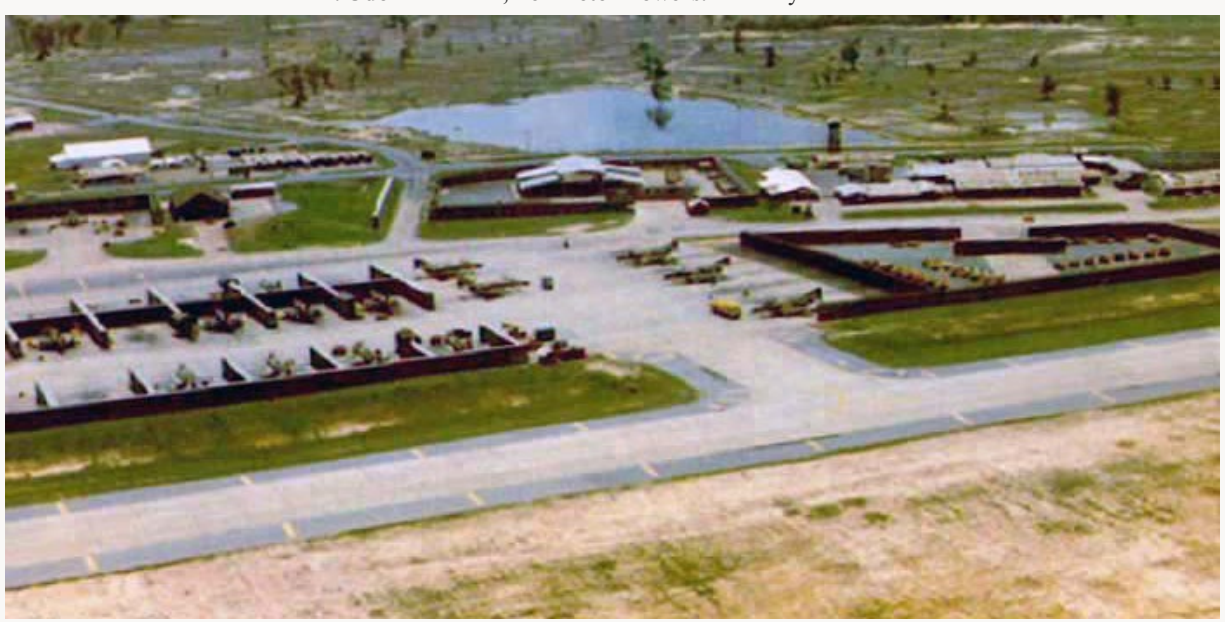
2a. Udorn RTAFB, Perimeter Tower.