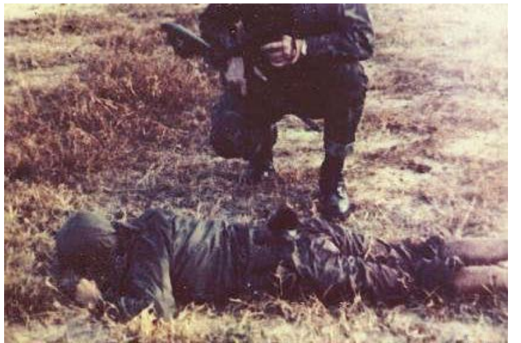
KIA Sapper 3: The pic I'm sending is an 8th Security policeman (I think, an Officer) squatting in a field beside a dead VC.