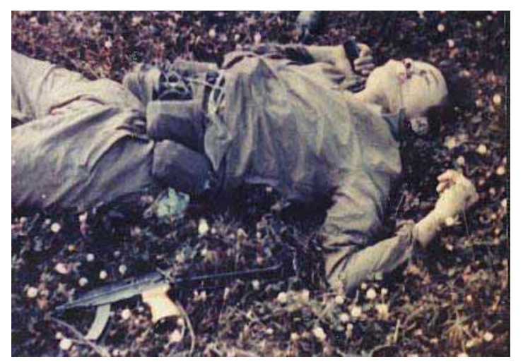
KIA Sapper 2. Near the Runway.