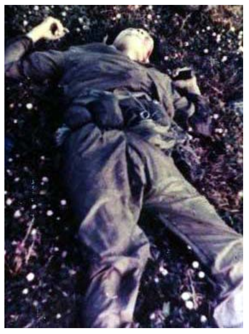
KIA Sapper 1. Near the Runway.