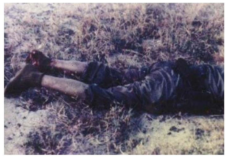
Sapper 7: Nasty heel wound.