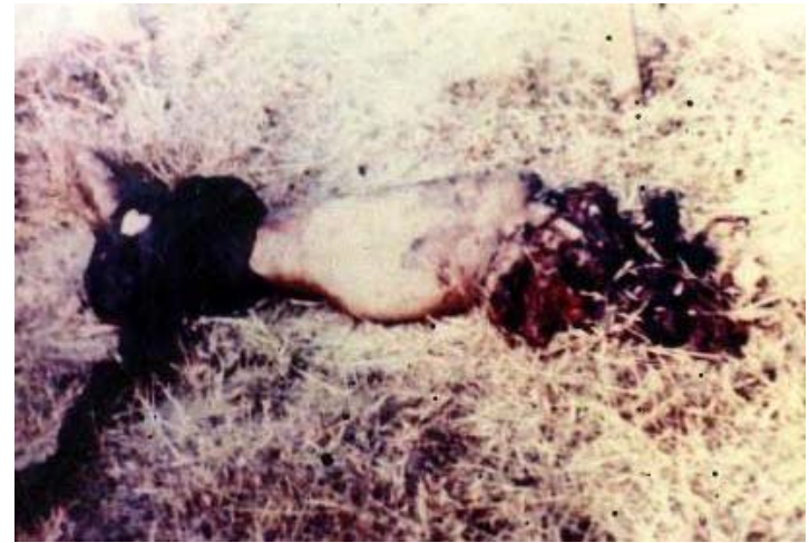
KIA Sapper 6 photos follow: This is the leg referred to in the story of the attack. Not much left, huh?