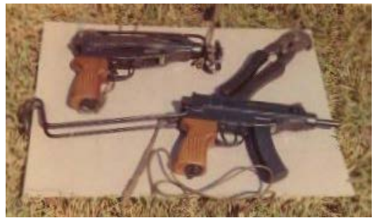
Two of the weapons the NVA/VC used, and a pair of wire cutters.