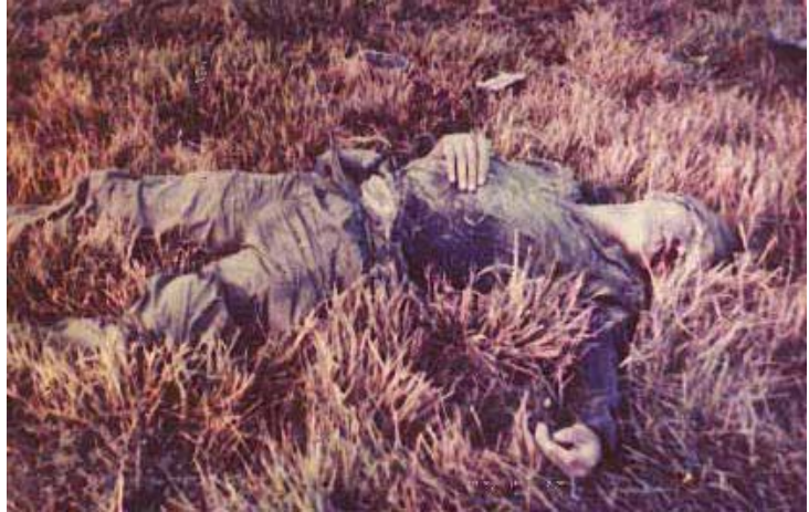
KIA Sapper 5. In the Field.