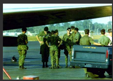
Photo: 8th SPS Sentry Dog Handlers on Ubon RTAFB flight line, just returned TDY from Vietnam. 1970

Intelligence reports received on June 2, 1972 from Nankorn Phanom Province (NKP), Thailand stated that 12 well trained Vietnamese had crossed the Thai border infiltrating into Thailand. They were reportedly were on their way to Ubon City for a sapper mission against Ubon RTAFB. Most were reported to be Vietnamese refugees repatriated to North Vietnam where they received sapper combat training for use against US facilities in Thailand.