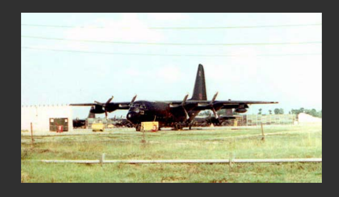
AC-130 Specter Gun Ship on the Ubon RTAFB taxiway. 1970