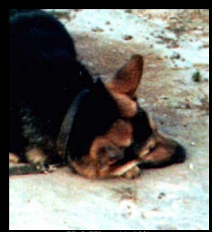
K-9 King (A642)