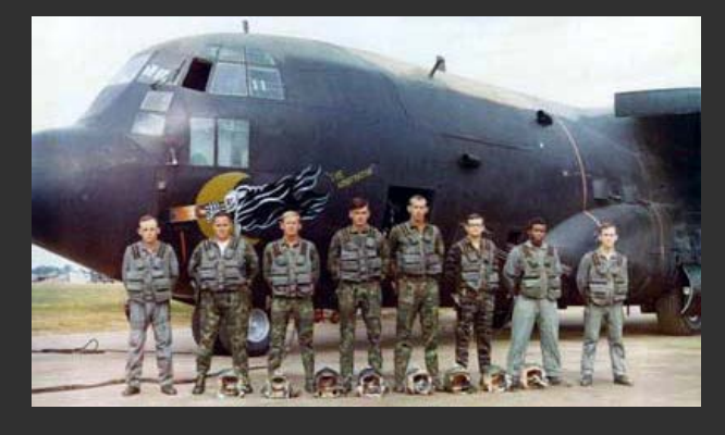
Night photographers posing in front AC-130 at Ubon Thailand "Arbitrator".

The Specter Gun Ships were outfitted with infrared night vision equipment and on board computers to fly the aircraft while at the same time firing their 40mm cannons, 105mm cannons and the 20mm electric gattling guns. These Aircraft could look through the thick jungle canopy and camouflage of the HO Chi Min Trail and rain their deadly fire on the enemy supply convoys and trucks parked below. When over a target, the heat signatures from the engines of the enemy vehicles below would clearly show up on the airman's infrared heat sensing monitors. This advanced technology made any and all targets very visible even at night and in all weather conditions.