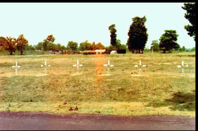
Rest In Peace, K-9 King (A642). Ubon RTAFB, 8th SPS USAF K-9 Cemetery