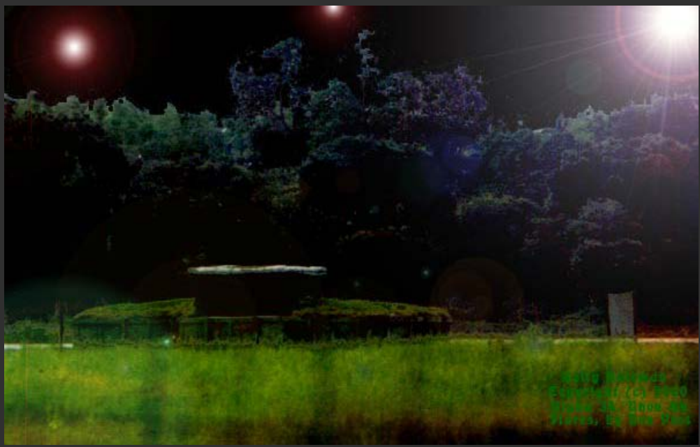
Photo: View looking over Machinegun Bunker, Alpha-34, toward the jungle on the perimeter, Ubon RTAFB, Thailand.

CSC radioed all USAF 81mm mortar pit crews to fire flare illumination to help to locate the hostile force. Echo 2 and Bravo 2 SAT teams arrived at Echo-77 and deployed at the point where the sappers had exited the base. As the SAT Teams deployed both A1C O'Dell and his dog Sheafer were found to be wounded, and were quickly evacuated to the base hospital. A1C O'Dell was wounded in the left knee and Sheafer was hit in the left shoulder. Both would recover.