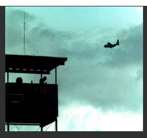
AC-130 Specter Gun Ship, over Texas Tower Fox-56, Fox Sector, Ubon RTAFB, 1970.