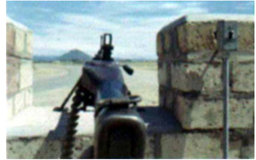
View from the Main Gate of Tuy Hòa mountain in the distance. I though this was a good photo even if I did take it myself (The preferred end to view things from!).