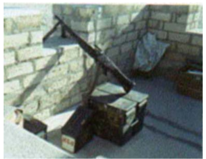
This was the M60 that was in 009 and the light fortifications on the Main Gate--not much uh.