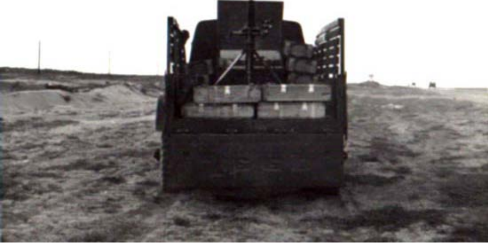
AF Photo of the portable 81MM Mortar mounted on the back of a Jeep truck.