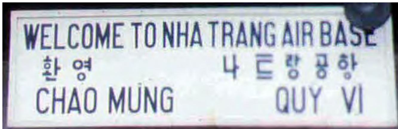
21. Nha Trang AB 1969-1970.