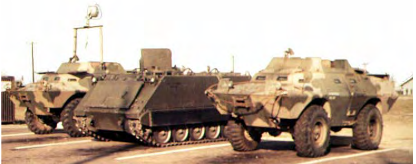
20. Sgt Domenic Sebben: Here is a photo of the APCs we used.