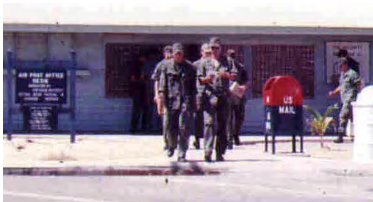
15. Nha Trang AB, Post Office, close up. 1969-1970.