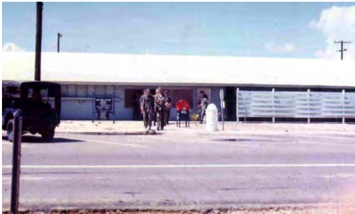
14. Nha Trang AB, Post Office. 1969-1970.