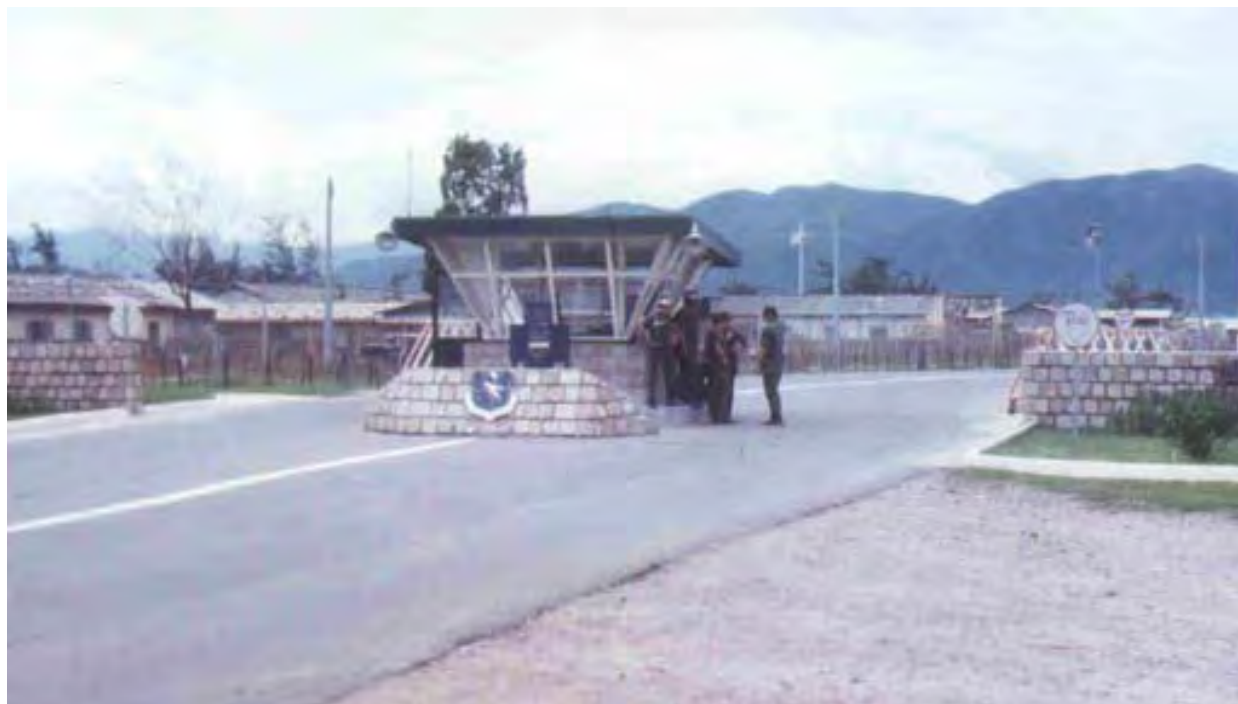
12. Nha Trang AB, Main Gate. SPS. 1969-1970.