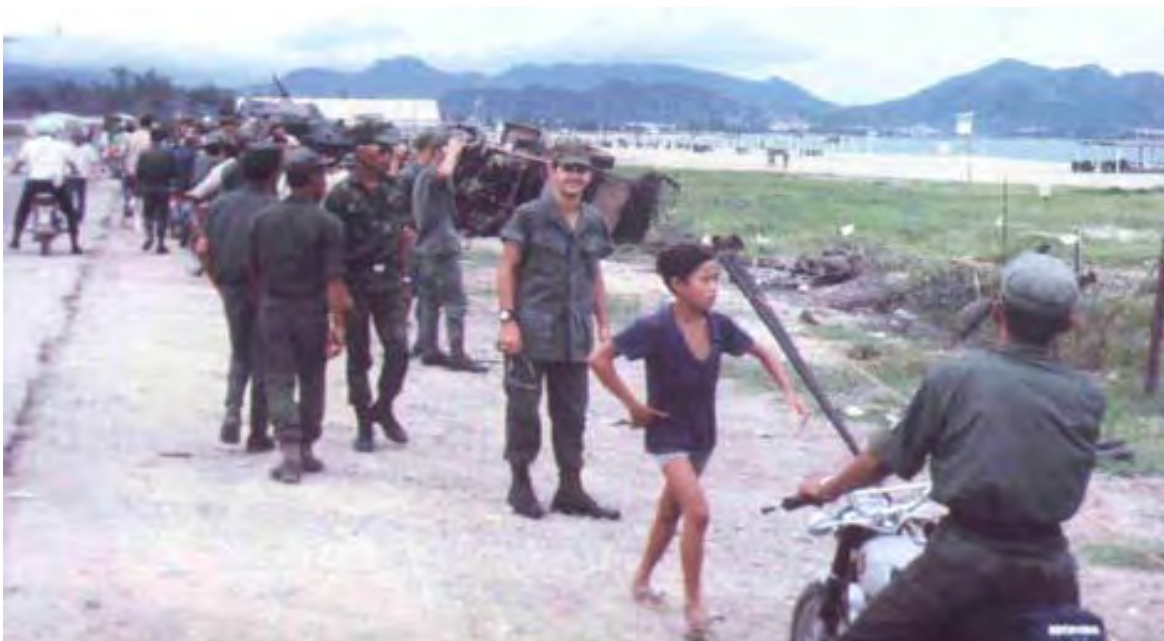
17. Nha Trang AB, vehicle wreck, close up. 1969-1970.