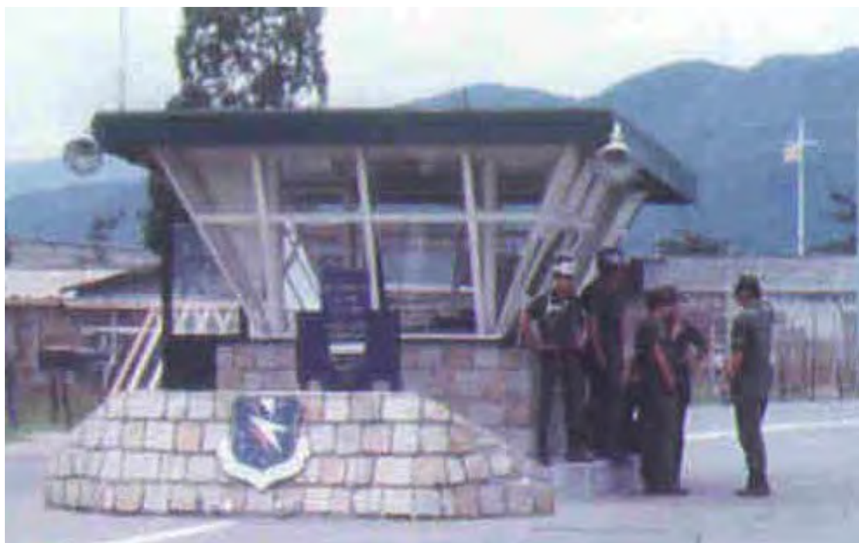
13. Nha Trang AB, Main Gate, close up. SPS. 1969-1970.