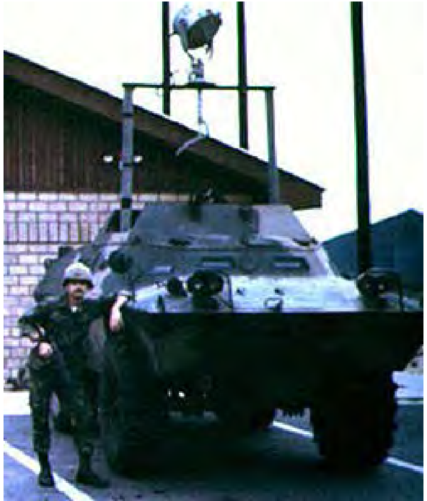
19. Sgt Domenic Sebben, holding up a V-100. 31st SPS Tuy Hòa Air Base, RVN.