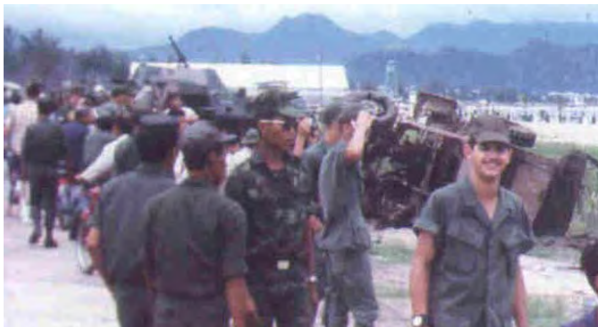
16. Nha Trang AB, vehicle wreck. 1969-1970.