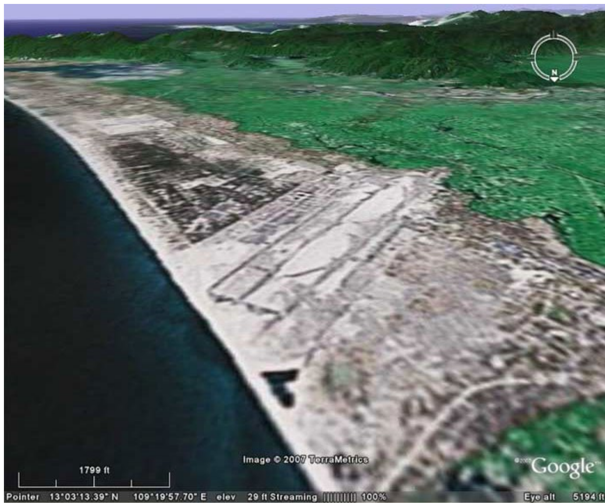
Tuy Hoa AB, imaged/angled South at 5,194 feet altitude.