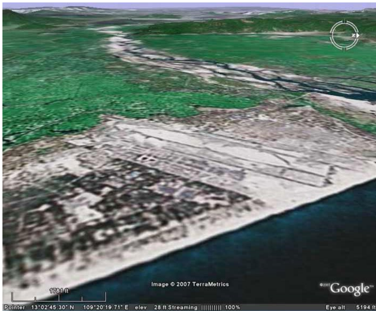
Tuy Hoa AB, imaged/angled West at 5,194 feet altitude.