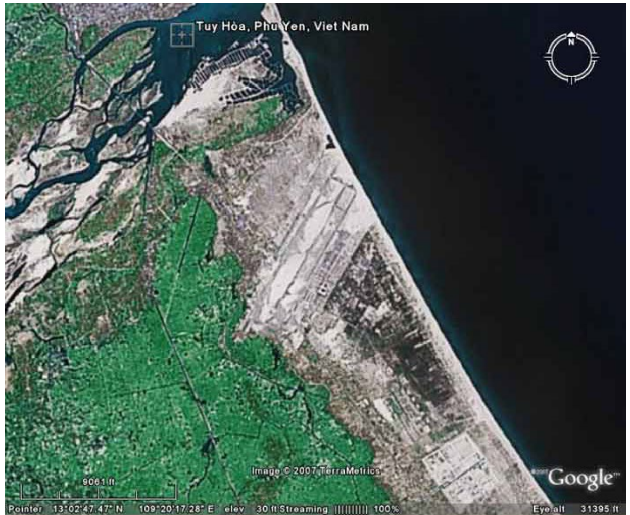
Tuy Hoa AB, imaged Fly Over at 31,395 feet altitude.