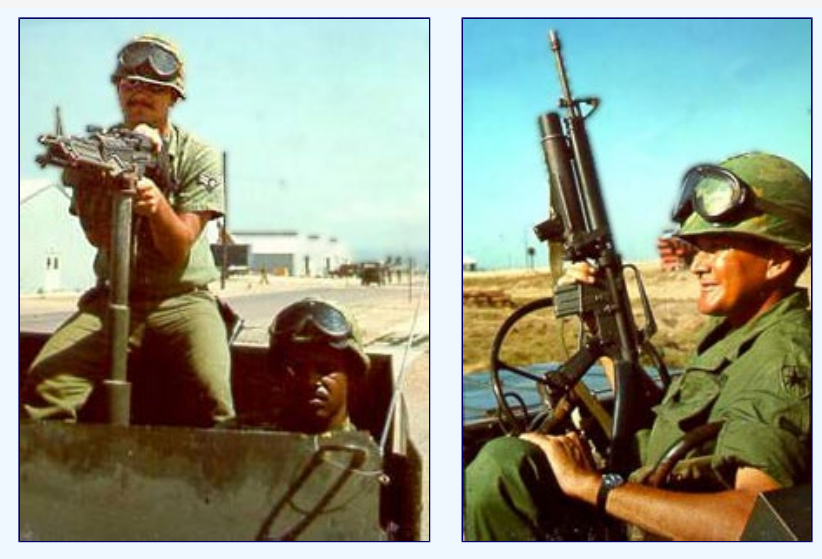
(1) and (2)

Perhaps the men will recognize faces and locations and add their comments!