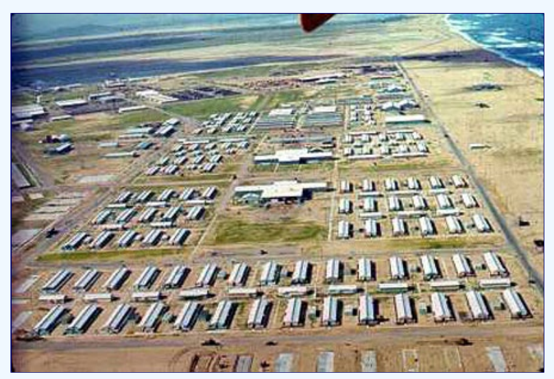
7) An aerial of the base taken from an HH-43 Pedro helicopter. It is at the south end of the base along the shoreline looking towards the north. If my memory serves me, the metal hooches at the bottom of the picture were the

(6) A photo of two SPS [law enforcement] taken elsewhere in the country (I really have no idea where other than it was not at Tuy Hoa AB).