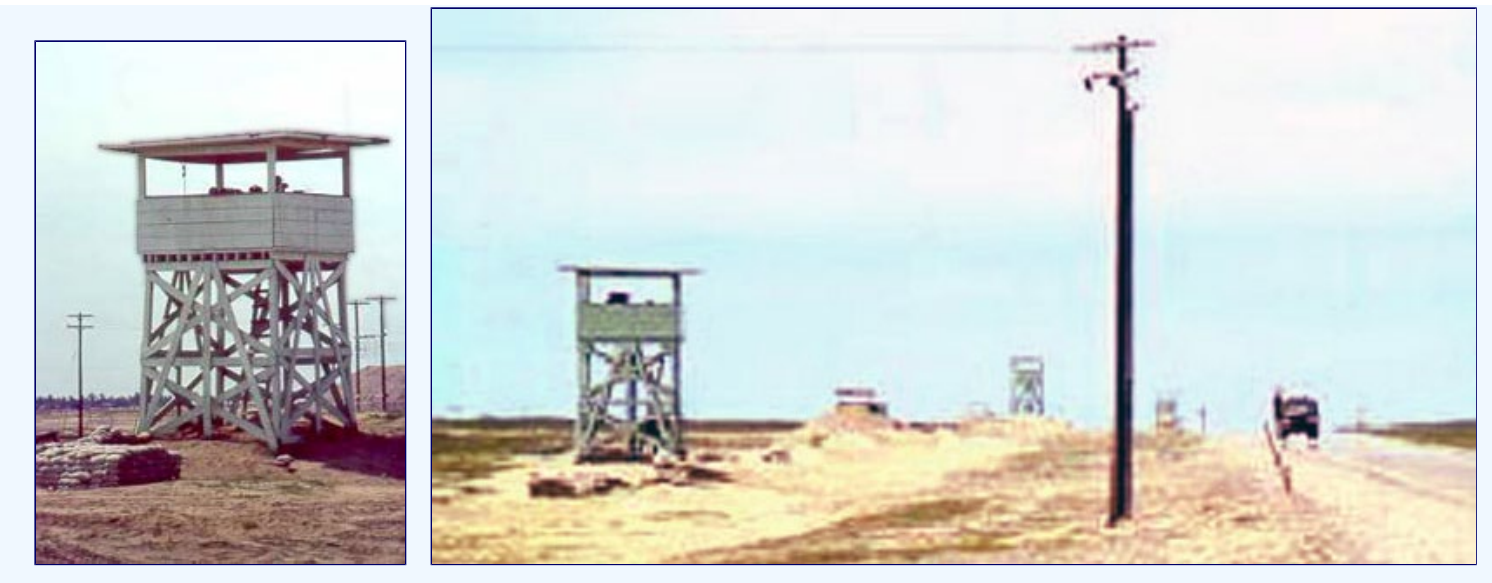
(4) and (5)