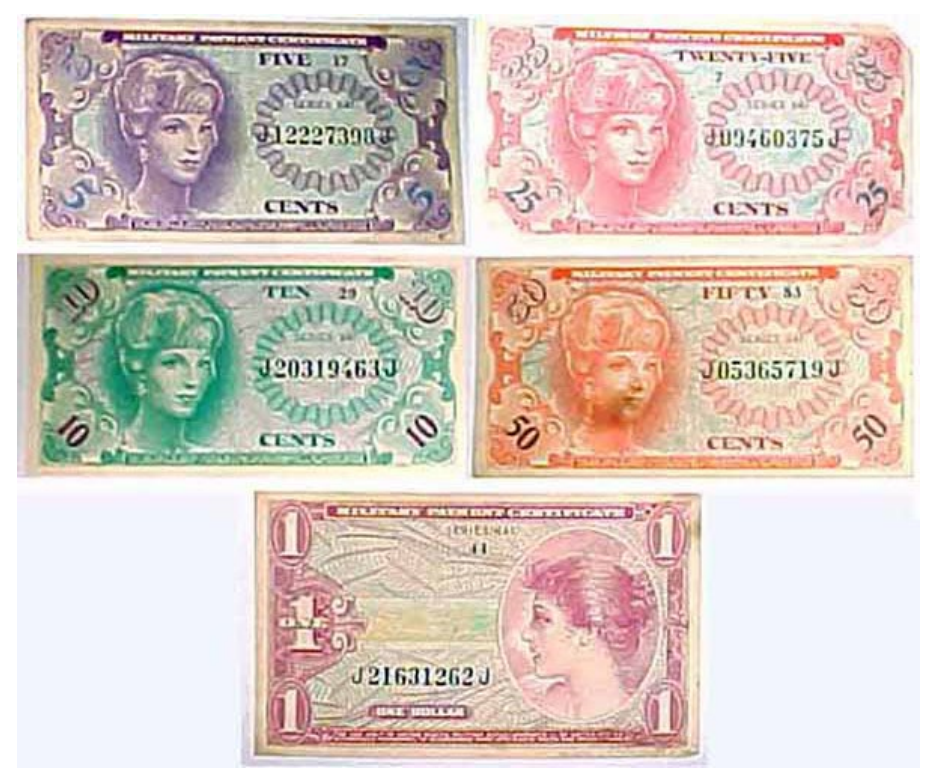
17. MPC Script.