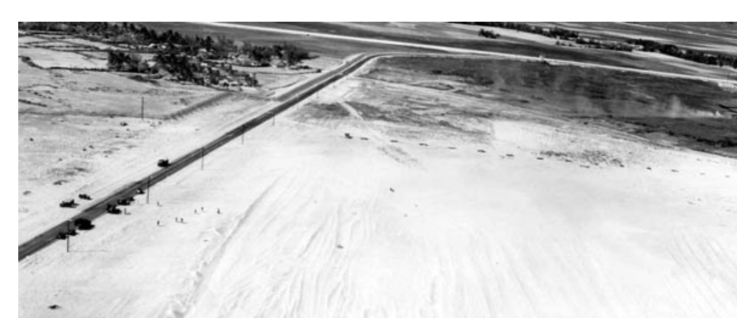
Photo 4 - Aerial view of killing field, a few of the bodies of dead sappers can be seen. They were running from bottom right to top left and were picked off one at a time. Most sapper's died in the sand trying to escape to village at top left of photo.

BELOW PHOTOS ARE GRAPHIC WOUNDS: Sappers 1-4 were killed in the areas between the flight line and perimeter fence, and were carrying assorted weapons such as AK47s, Bangolore Torpedo mines, B40 Rockets, homemade grenades and satchel charges.