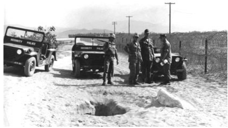
Photo 1 - Members of the 31st SPS check out a fighting hole dug by Viet Cong outside the perimeter fence between Oscar-7 (tower) and Golf-16 (bunker). VC used this fox hole to support sappers on base trying to escape after their attack.

The attack of 29Jul68 occurred a little after midnight. Viet Cong soldiers were killed between the flight line and the perimeter fence while apparently trying to reach a small village just outside the base possibly named UAT LAM.