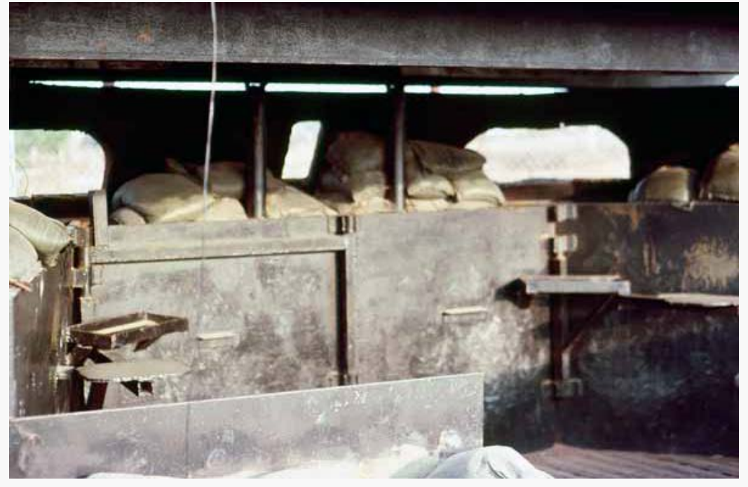
19. Tân Sơn Nhứt AB: Bunker BB7: This is looking inside BB7. They were made of 3/4" steel with a wall like the insied of a house with dirt in the middle. In front of the bunker were sandbags and then 55gal. steel drums. also there was a cyclone fence surrounding it. this was tp prevent mortors hitting the front.