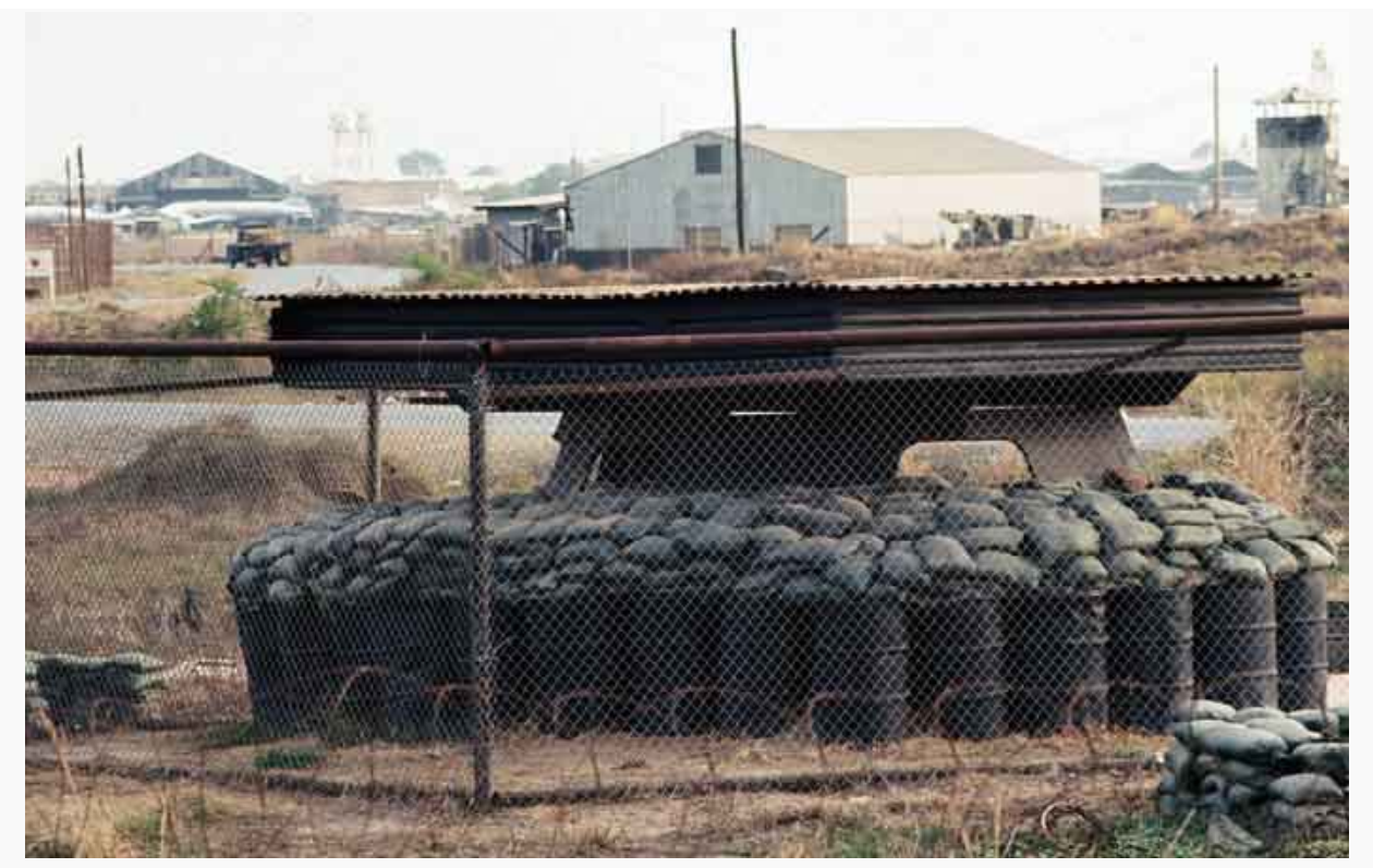
22. Tân Sơn Nhứt AB: Bunker BB7: T-16 showing the fenceline to the rear/right with Bravo-Bunker-8 in the rear, the two story one with the pointed roof. Towers in background.