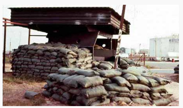
18. Tân Sơn Nhứt AB: Bunker BB7: Close up left side of BB7. We had a can of white spray paint and painted the numbers on a pole. also if you look close, there was a small lizard. My companion (this is a two man bunker) sprayed the lizard and you can see the outline.