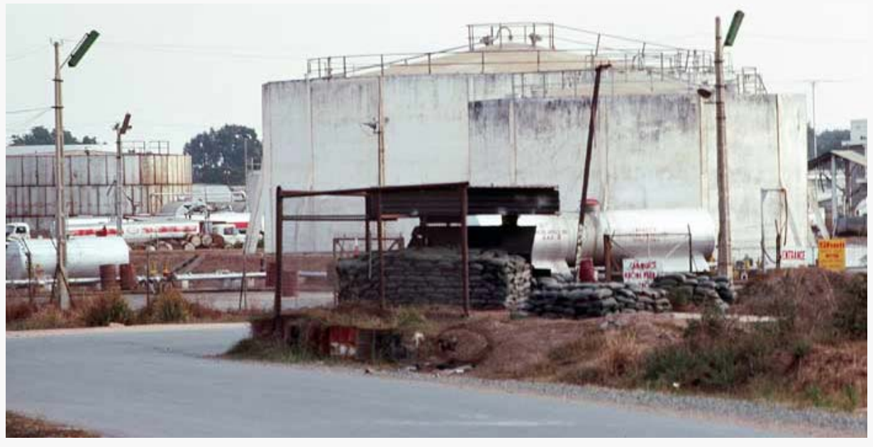
21. Tân Sơn Nhứt AB: Bunker BB7: Shows left side of BB7 from a distance. Notice the shell fuel tanks in the background. If they went up so would we. Oh well .