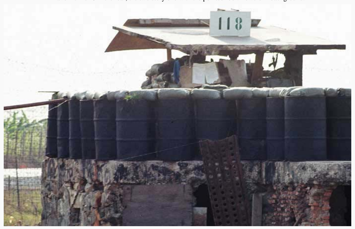
23. Tân Sơn Nhứt AB: Bunker BB7: 051-Bunker, viewed from rear.