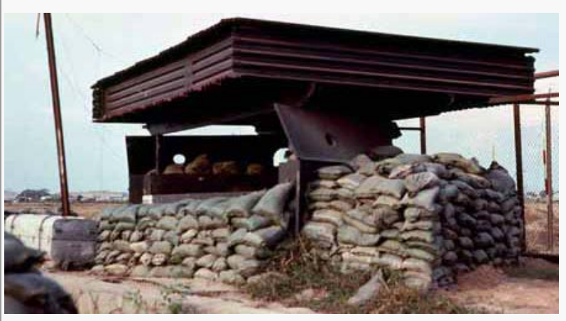
17. Tân Sơn Nhứt AB: Bunker BB7: Right side of bunker. Extra ammo can and cleaning supplies were chained up in a transfer case in the rear of the bunker.