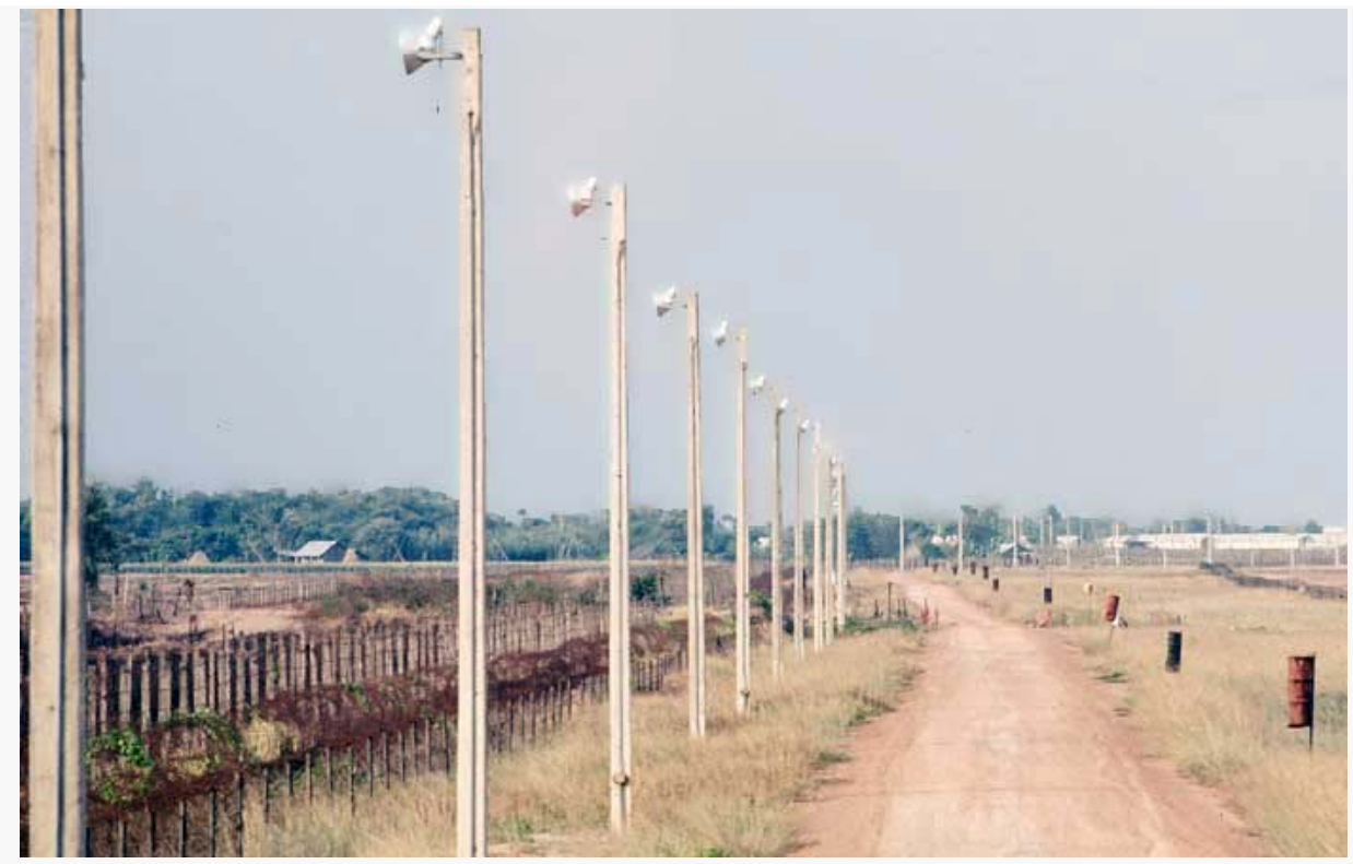
24. Tân Son Nhứt AB: Bunker: Perimeter Road. Minefield and Floodlights to Left.

Page-1 • Page-2 • Page-3 • Towers and Bunkers-Menu