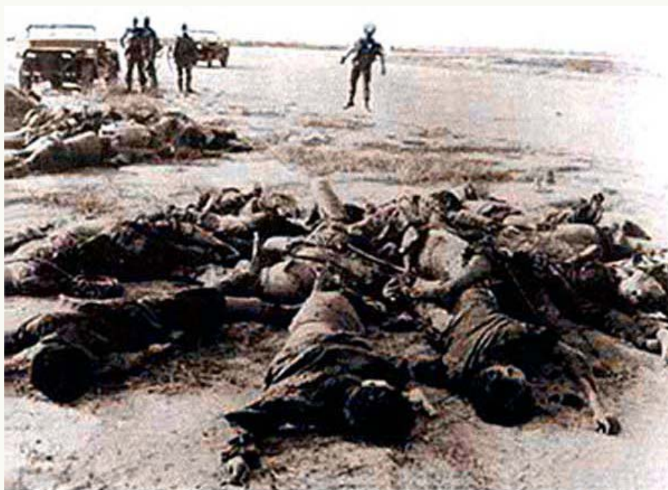
377th Security Police view the bodies of Communist forces killed in the attack on Tan Son Nhut Air Base during Tet Offensive.

3. Tân Sơn Nhứt AB, Bunkers and defense. 1968.