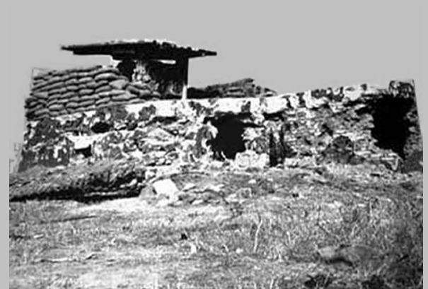
9. Tân Sơn Nhứt AB, Battle damaged O-51 Bunker. Tet 1968. 1967-1968.