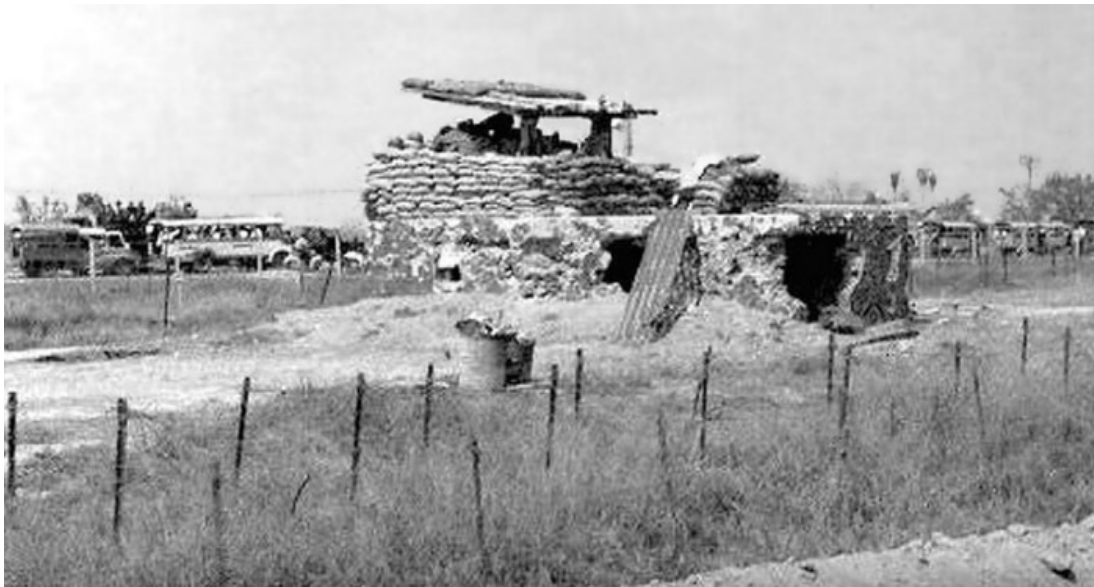
7. Tân Sơn Nhứt AB, O-51 Bunker, captured by VC and NVA, received air-strikes and artillery rounds before being retaken. Tet 1968.