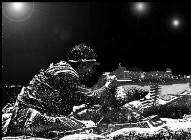
377th SPS fought through the night of Tet '68, blunting the strong enemy attack of over 1,400 VC & NVA soldiers.