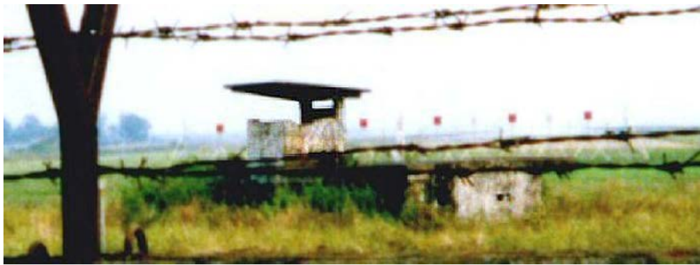
10. Decades later, a revisiting ex-Security Police 'tourist' pestered his tour-guide for permission to stand atop their parked vehicle and raise his camera over the fence for a photo of O-51 Bunker, as it appears today. Standbags have long since melted away, but the blood of four KIA SPs and hundreds of VC and NVA remains a part of that battlefield of Tet 1968.