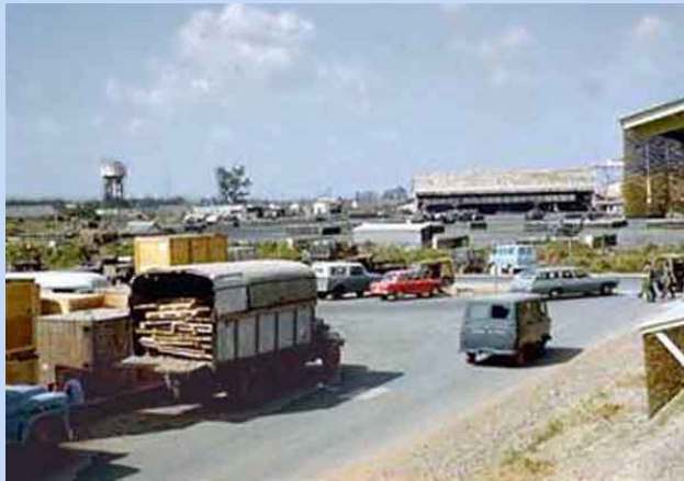
9. Tân Sơn Nhứt AB, Tango-Tower. 1968.