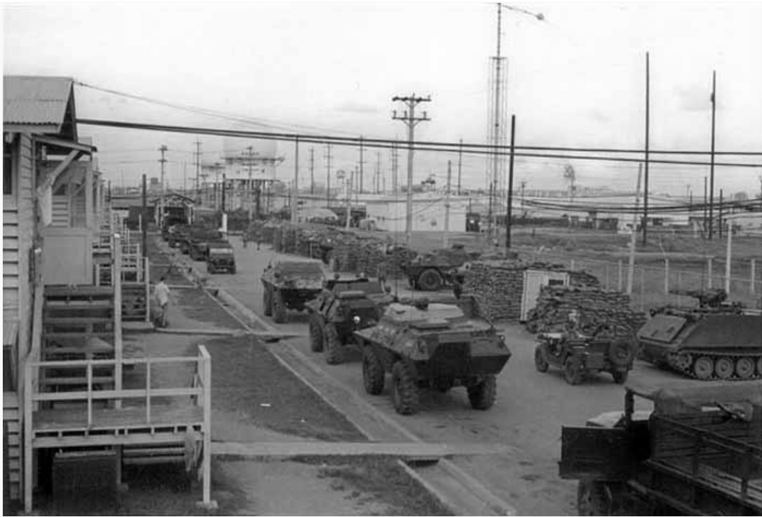
11. Tân Sơn Nhứt AB, Airborne Gate. APCs, Bunkers, and Radar Tower.