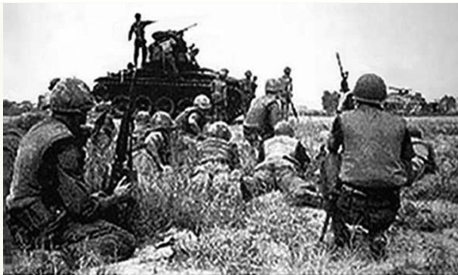
Members of the 377th SPS, supported by armor, move to resecure Tan Son Nhut AB after penetration by Communist forces on January 31st, 1968.

3. Tân Sơn Nhứt AB, Bunkers and defense. 1968.