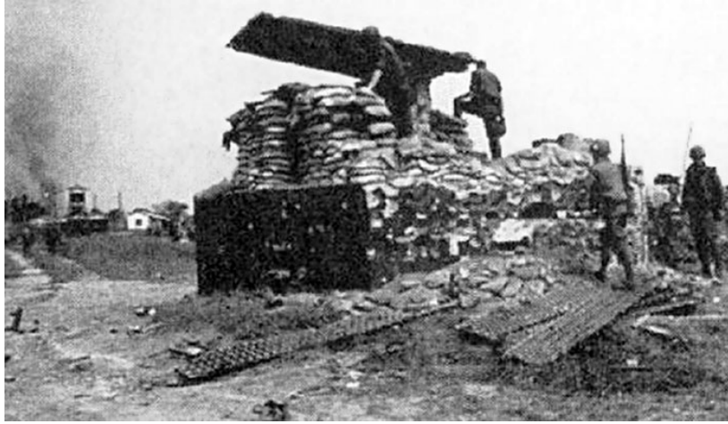
6. Tân Sơn Nhứt AB, O-51 recaptured. Four Security Police KIA. Tet 1968. 1967-1968.