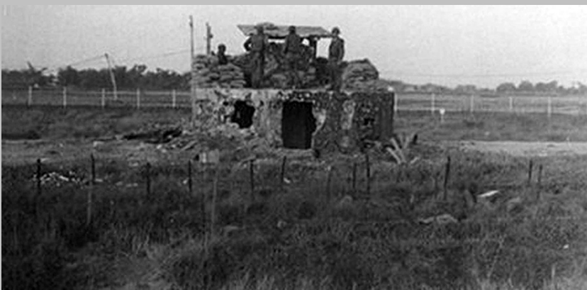
8. Tân Sơn Nhứt AB, O-51 recaptured. Security Police (Air Force Infantry) stand guard. 1968. 1968.