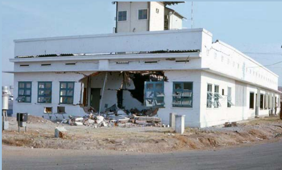
10. Tân Sơn Nhứt AB, Control Tower. 122 mm Rocket direct hit.