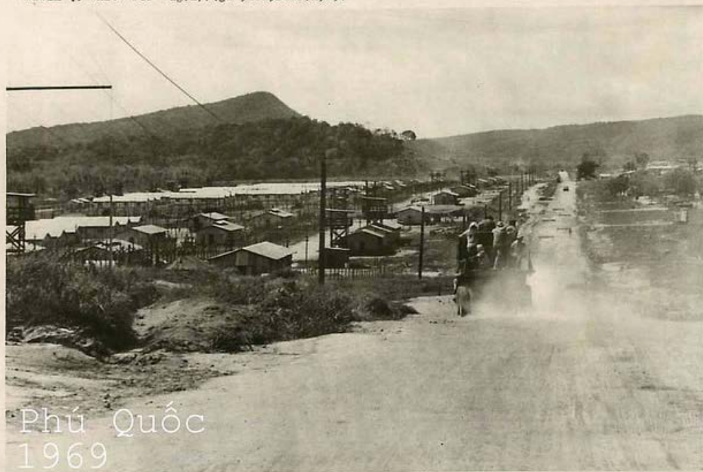
Phú Quốc 1969

ADVANCE FOR SUNDAY AMs OF AUG.17 (NY18-Aug.14)--PRISON ON PHU QUOC ISLAND--This is a general view of prisoners of war camp near An Thoi, a village on South Vietnamese island of Phu Quoc in Gulf of Siam. South Vietnamese government maintains biggest prisoner of war camp here, holding 17,000 men, including more than 4,000 men from North Vietnam kept in a separate compound.(AP Wirephoto)(See AP Wire Story by Edwin Q. White For Aug.17)(gch92015faaz)1969.