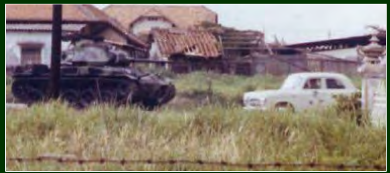
16) Long Binh Gate - A little heavy back-up at the Gate. I have the right of way... any questions little fella?