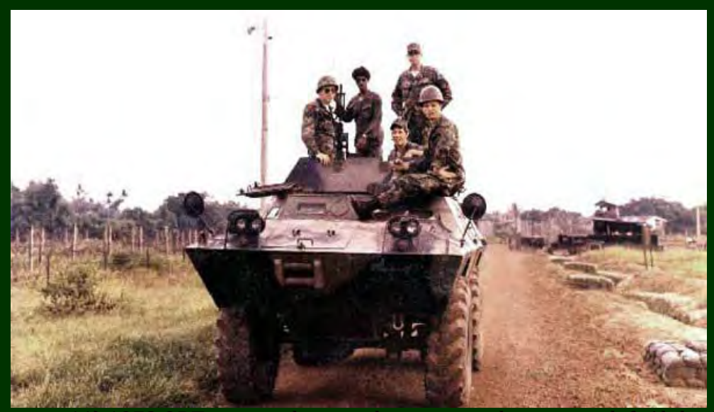
11) 1972 QRT on patrol on north perimeter, having just left Alpha-5