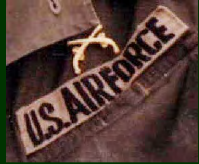
8) Cross-Pistols pin, above USAF patch.