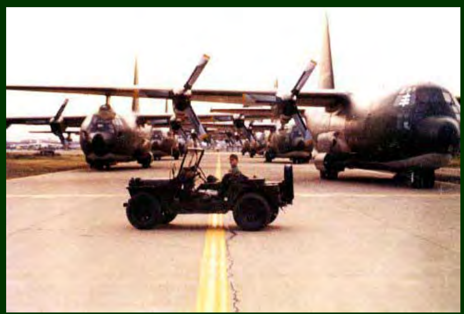
9) Took this one to record the degree of buildup being done before the peace treaty went into effect. Note the taped closed cockpit windows.