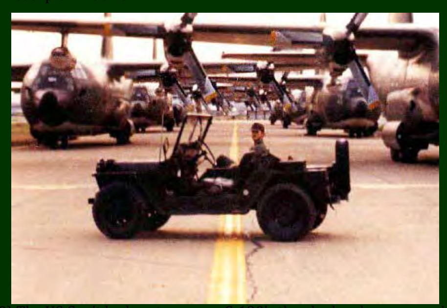
no pilots for them all so they fined them all up on the runways just parked there.