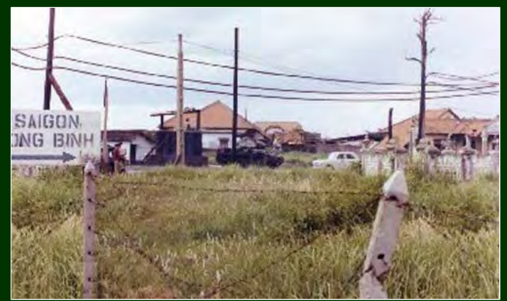
14) Tân Sơn Nhứt: Long Binh Gate.