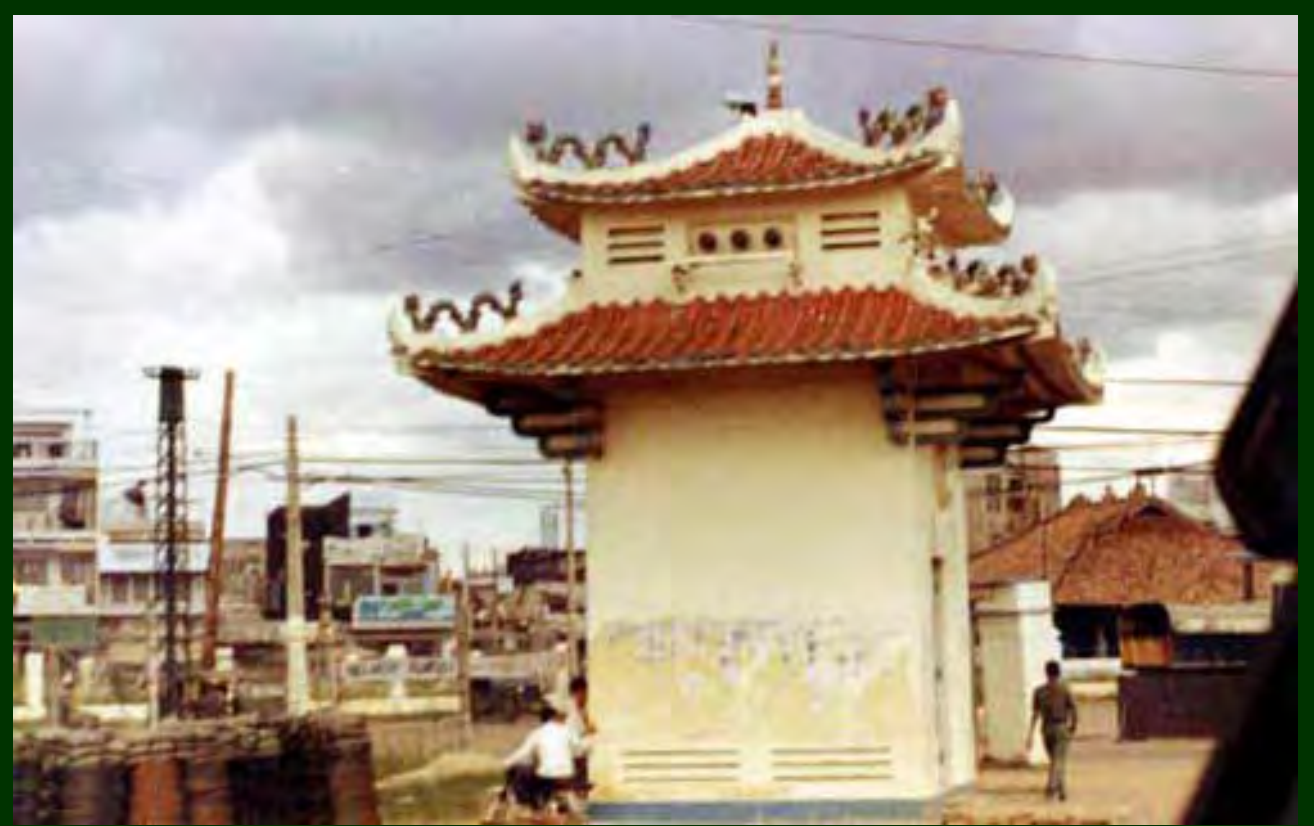
6) TSN - Remember this gate, eastside of TSN gate to Saigon? QC's ran their counterpart gate right next to it on the road.