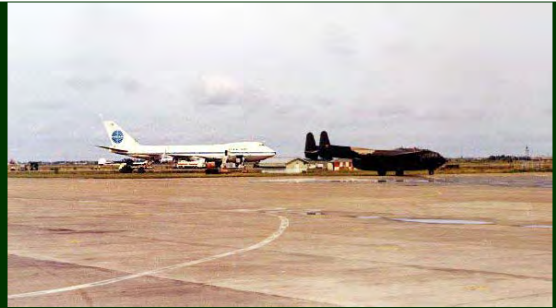
3) I always liked this photo of the AC119 gunship "warbird"