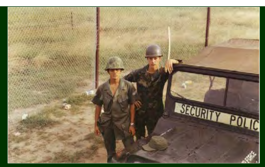
18) Quick Response Team, at Alpha 72.