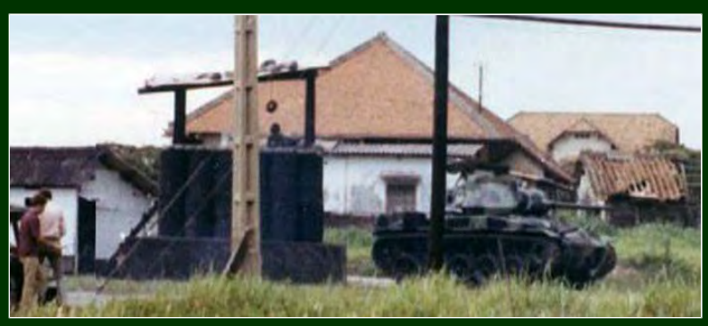
15) It was okay to wear your civies into town.