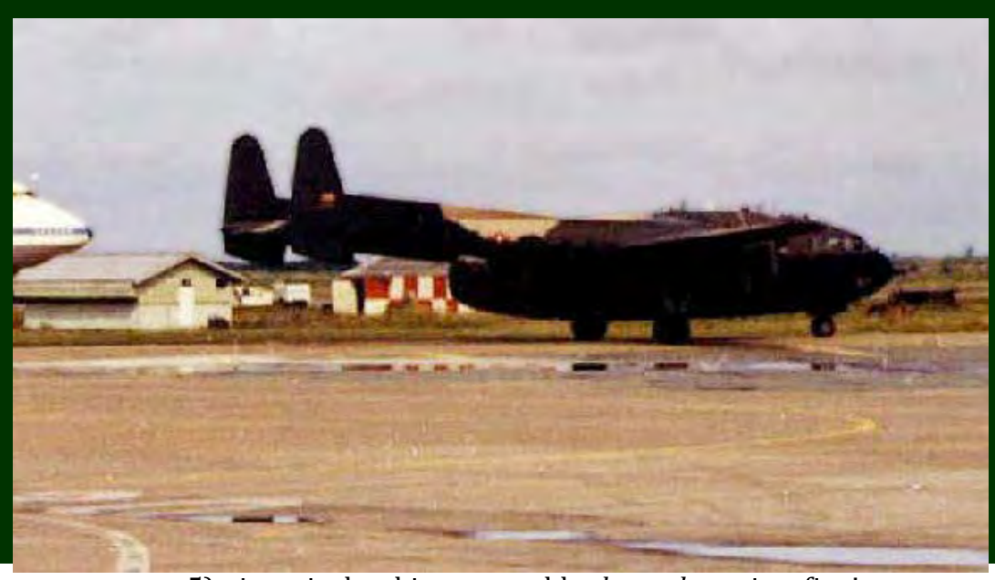
5)... in a pinch... this one would take me home just fine!