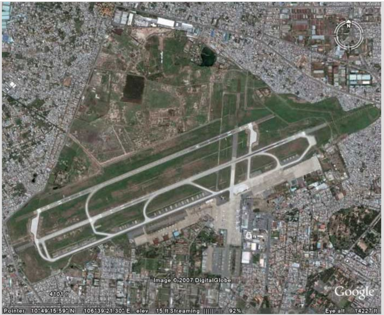
TSN AB, imaged Fly Over at 14,227 feet altitude.