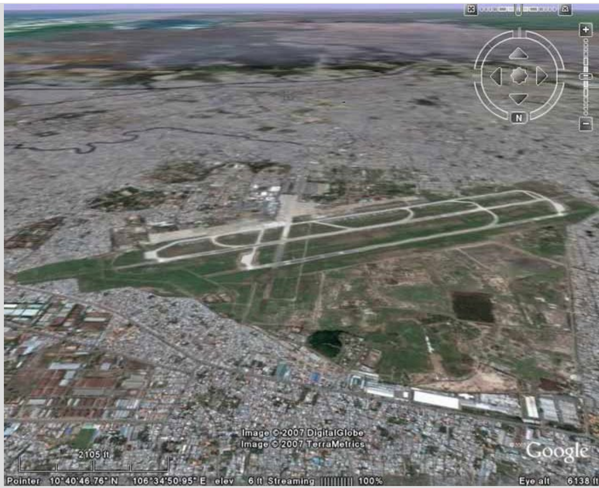
TSN AB, imaged/angled South at 6,138 feet altitude.