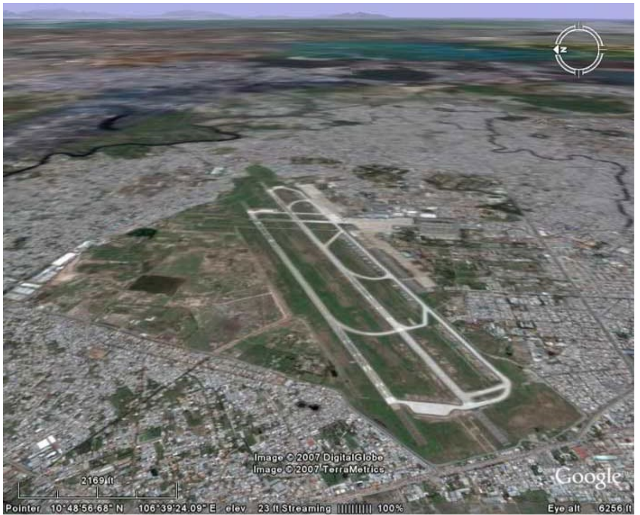
TSN AB, imaged/angled East at 6,256 feet altitude.