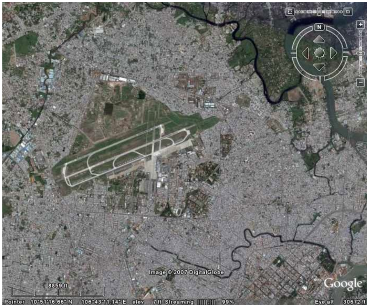
TSN AB, imaged Fly Over at 30,672 feet altitude.