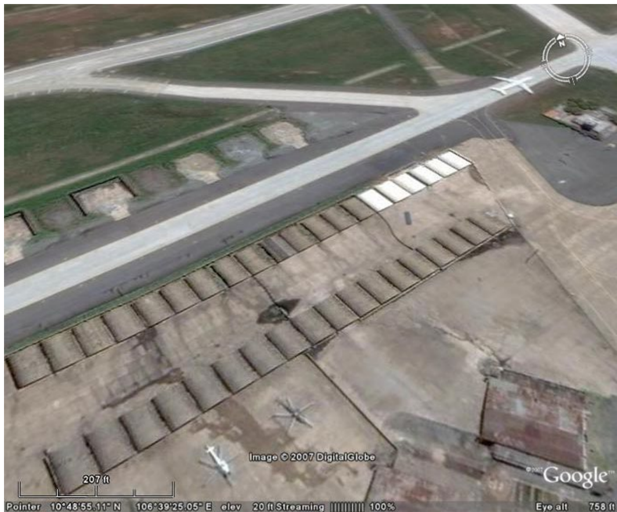
TSN AB, imaged/angled N/E, Control Tower at 758 feet altitude.