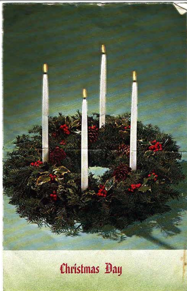
1. Christmas Day card and Menu cover, 1967. 1967.