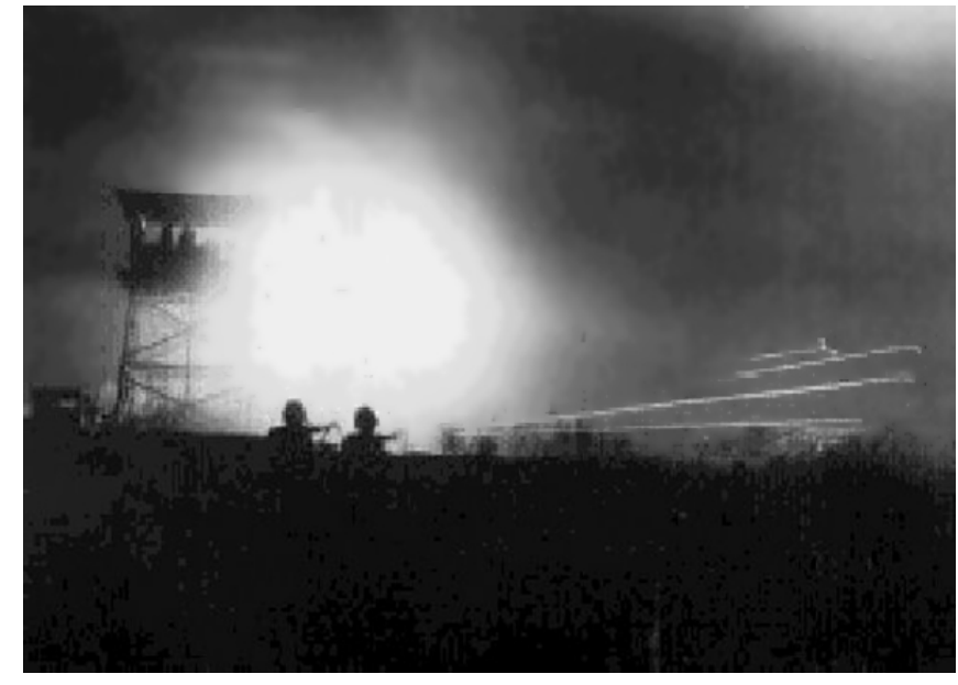
Photo: Perimeter Towers on both sides fire on NVA soldiers attacking O51 Bunker.

The North Vietnamese attacked the bunker in full force. Records of taped radio transmissions recorded the twenty-four minutes Bunker O51's defenders fought against such overwhelming odds. Communist forces closed with and enveloped Bunker O51. Machine gun fire from Bunker O51, flanking positions from SP Towers, and repeated strafing runs by AC-47 and Cobra helicopter gunships failed to blunt the enemy's forward progress.