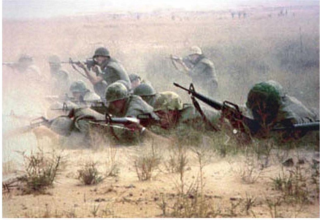
Members of the 377th SPS open up on Communist forces who infiltrated Tan Son Nhut AB during the Tet 1968 Offensive.