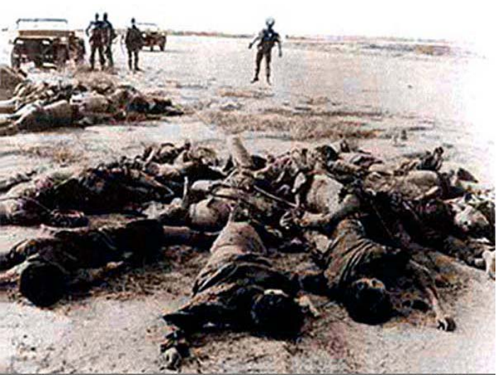
377th Security Police view the bodies of Communist forces killed in the attack on Tan Son Nhut Air Base during Tet Offensive.

The inscription reads: "This is the resting place of those soldiers lost