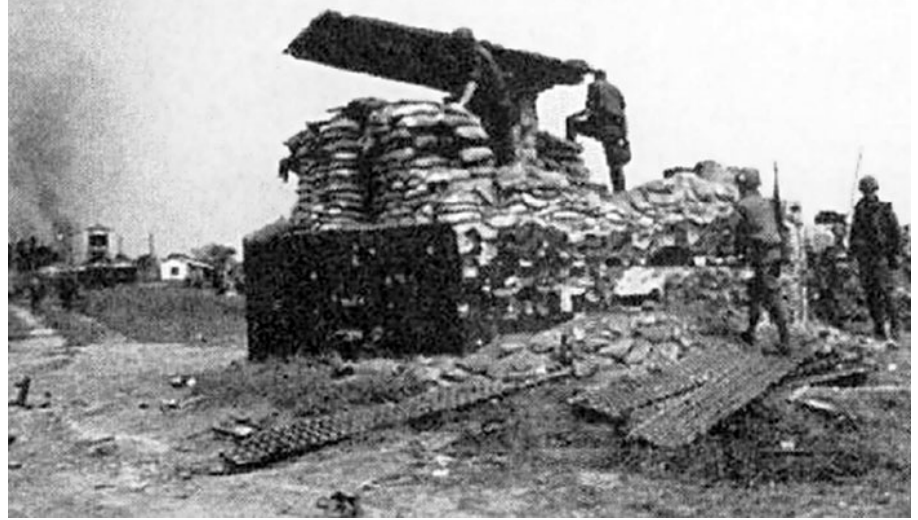
Photo: Perimeter Tower, Tango-4, in the distance, fired on NVA soldiers attacking O51