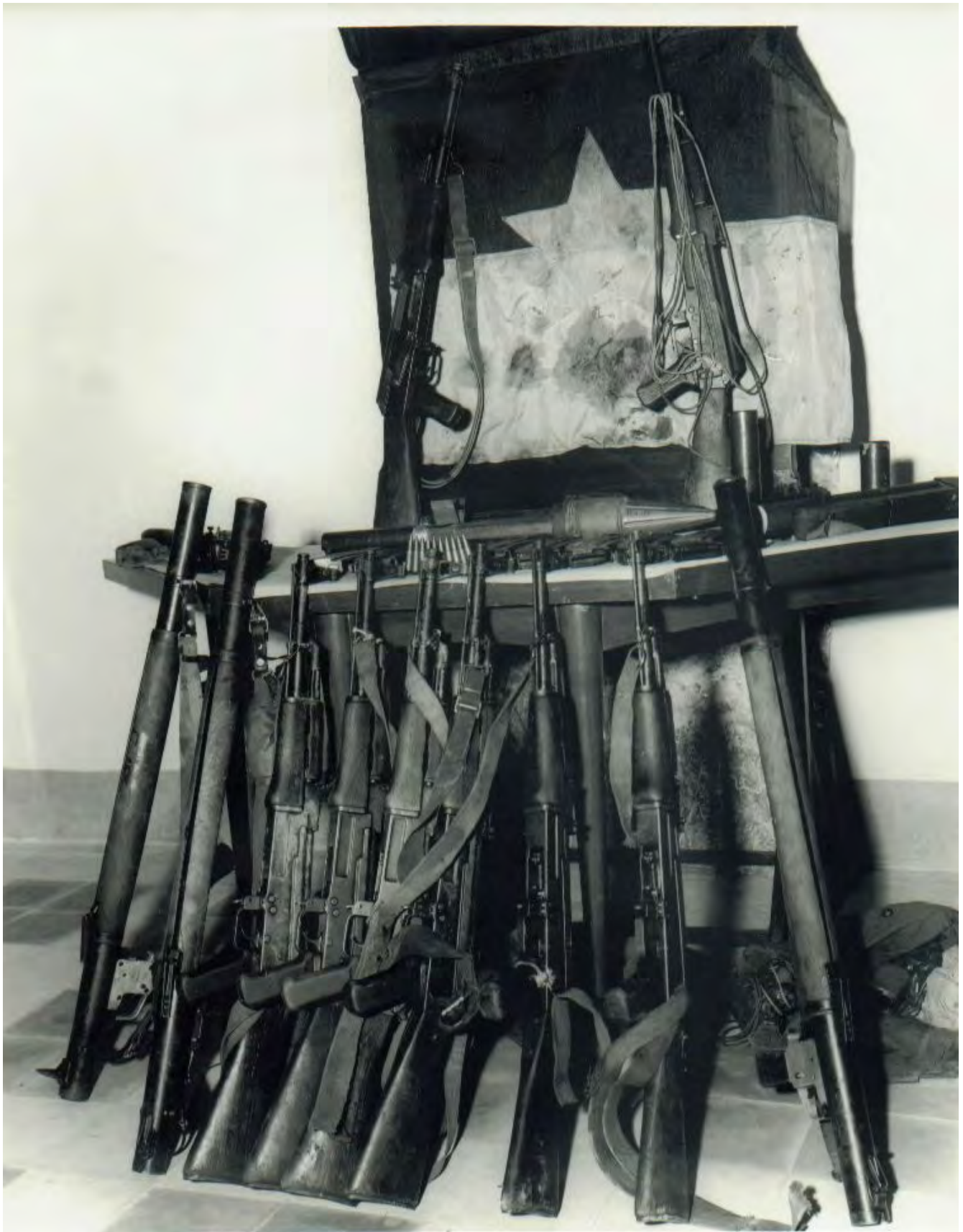
More weapons confiscated from the enemy, Dec 4, 1966.