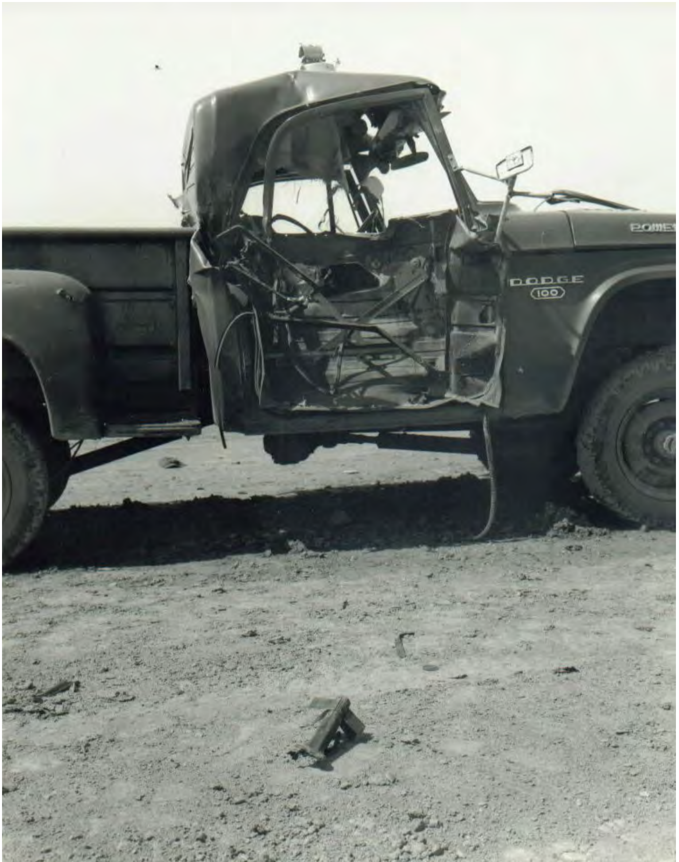
377 th Air Police Squadron vehicle, used on Dec 4, 1966.