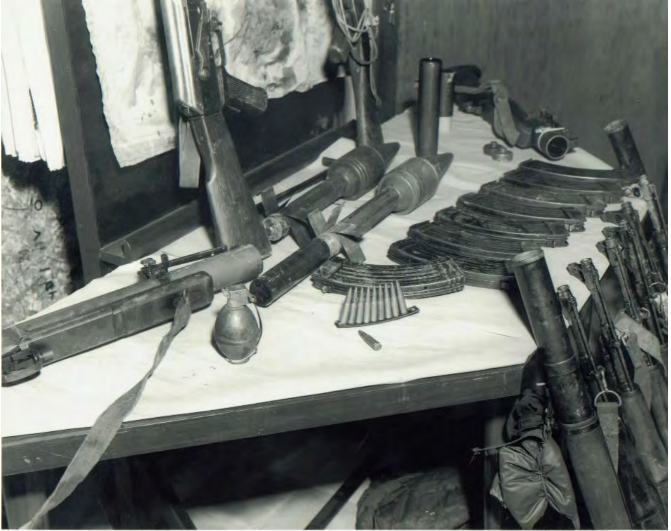
This photograph shows some of the enemy weapons confiscated after the Attack On Tan Son Nhut, Dec 4, 1966.