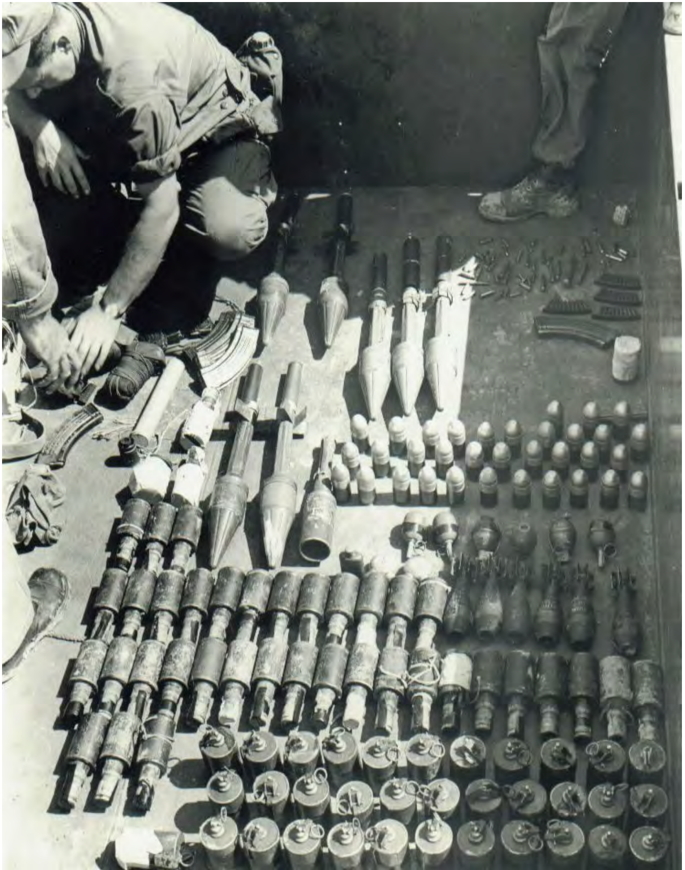
More weapons confiscated from the enemy, Dec 4, 1966. EOD personnel.